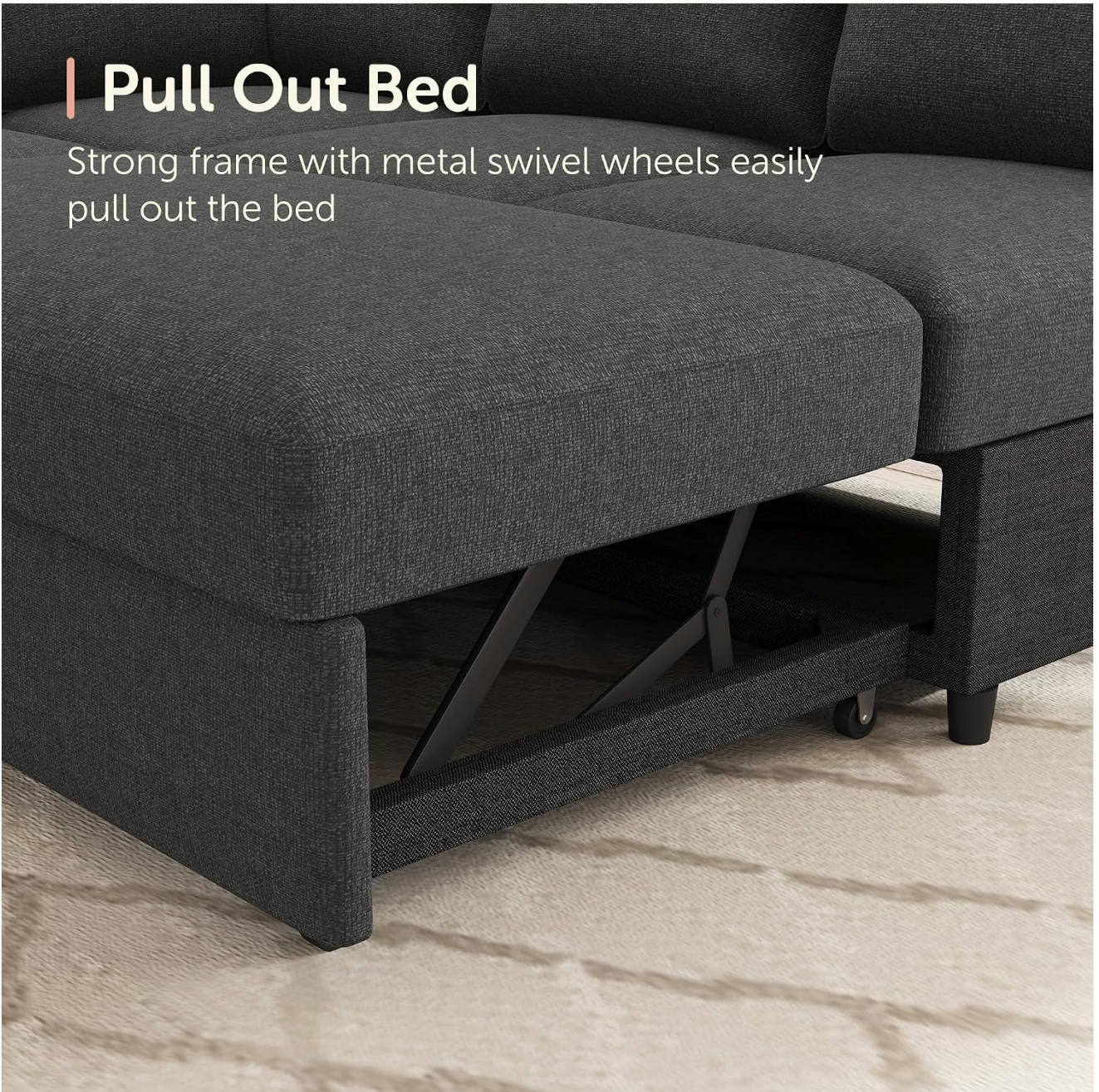
Image: A detailed view of the pull-out bed mechanism, showing the strong frame with metal swivel wheels.

Strong frame with metal swivel wheels easily pull out the bed