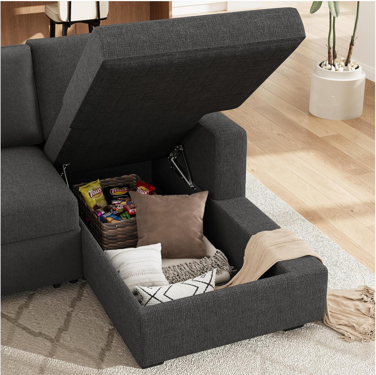
Image: The storage chaise with its lid open, showing ample space for storing items like pillows and blankets.