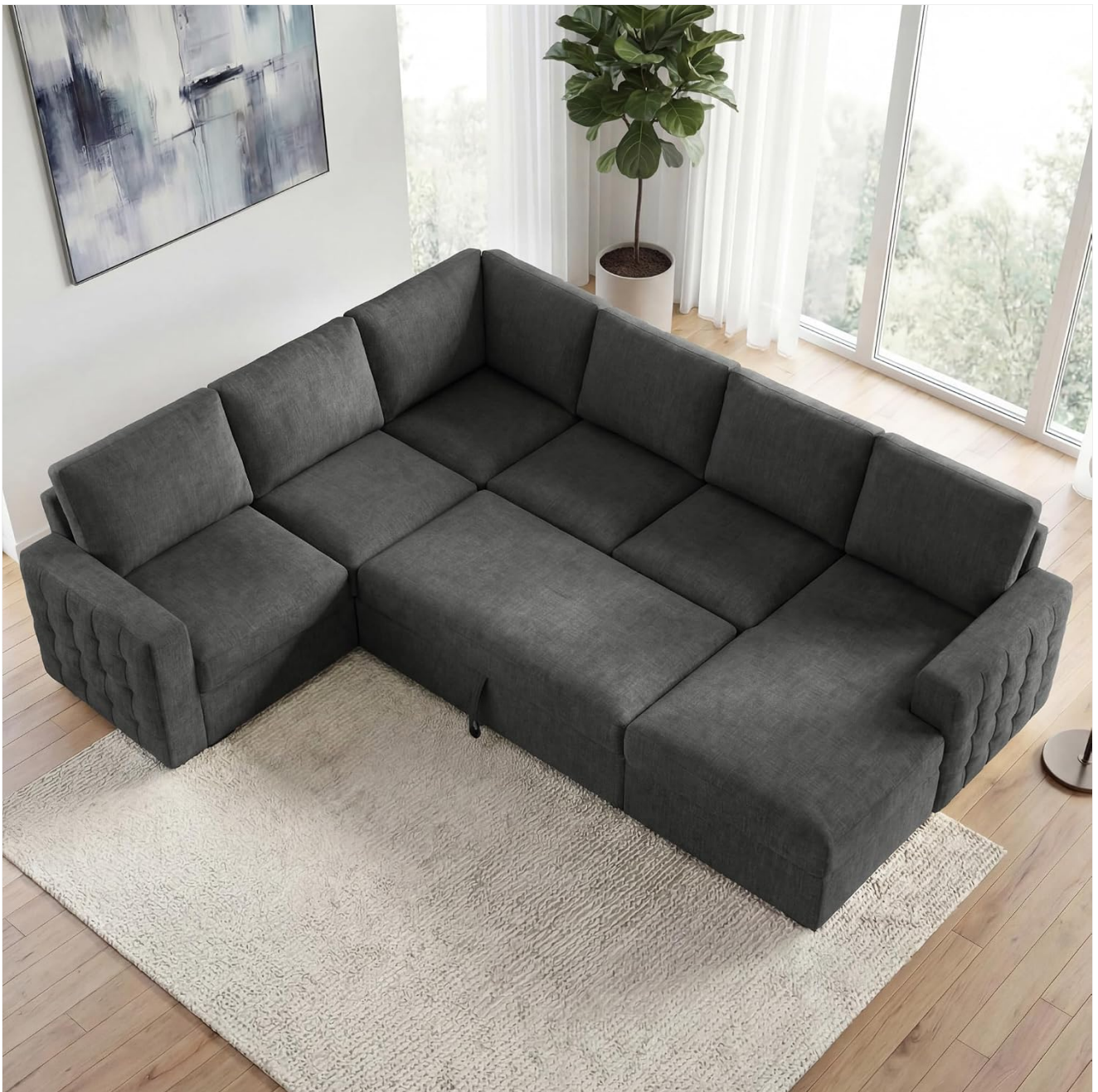
Image: An assembled HONBAY sectional sofa, showing the U-shaped configuration in a living room.