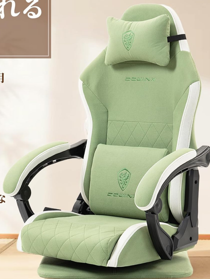
Image: The gaming chair shown in different reclining positions, from upright to a relaxed 145-degree recline, suitable for gaming, studying, or napping.

自然の涼しさと美しさを 技術で再現しました。 木漏れ日のように柔らかく 体を包み込むクッション、 杜若のしなやかさを表 現したデザインライン、 そして風が通り抜けるような 涼やかな座り心地 新たな安楽の境地を、 ぜひご体感ください