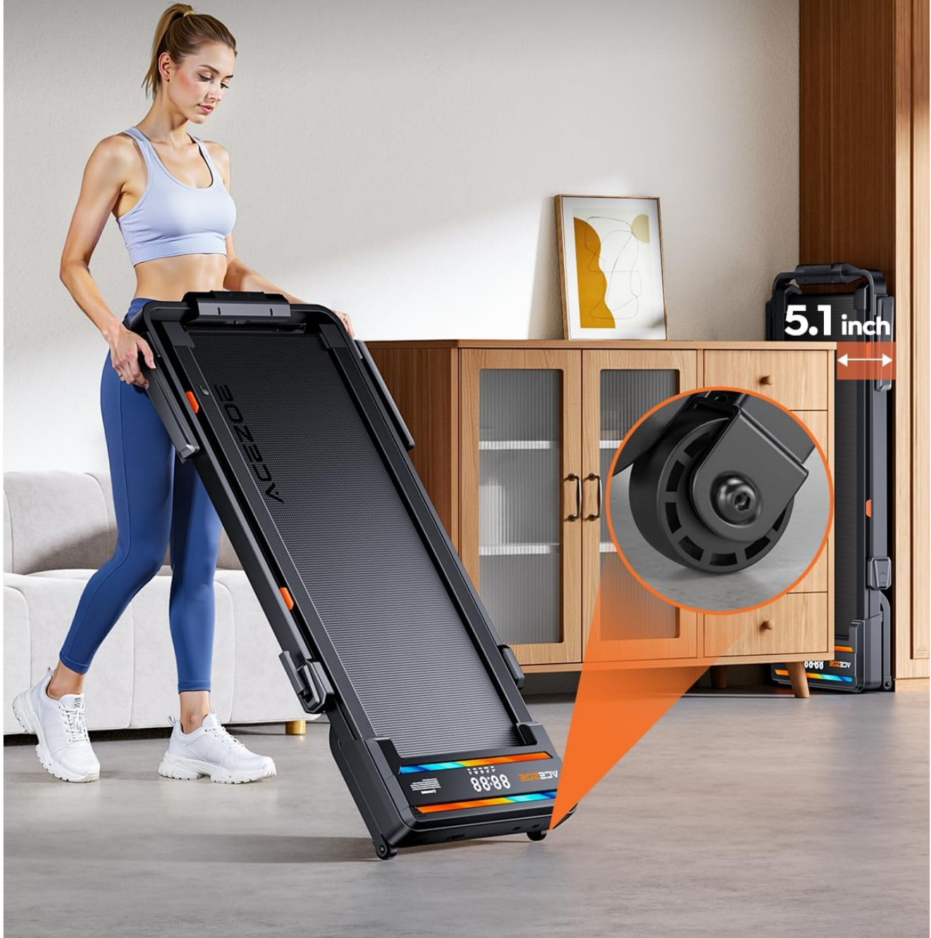
Image: The Acezoe P30 treadmill in its folded position, illustrating its compact storage capability and transport wheels.