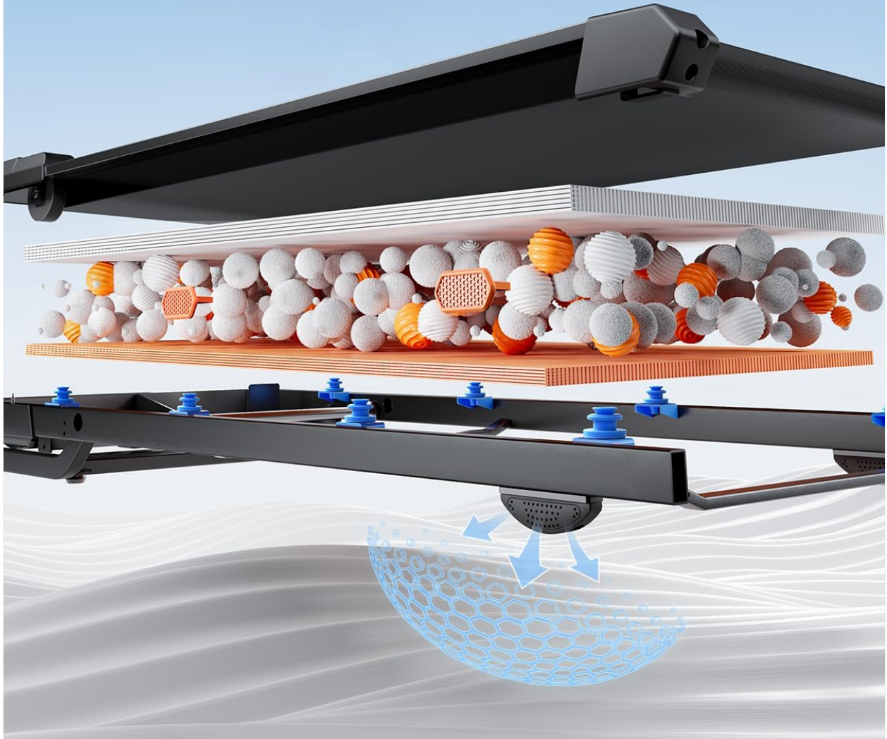
Image: Exploded view of the multi-layer shock absorption system for enhanced comfort and joint protection.