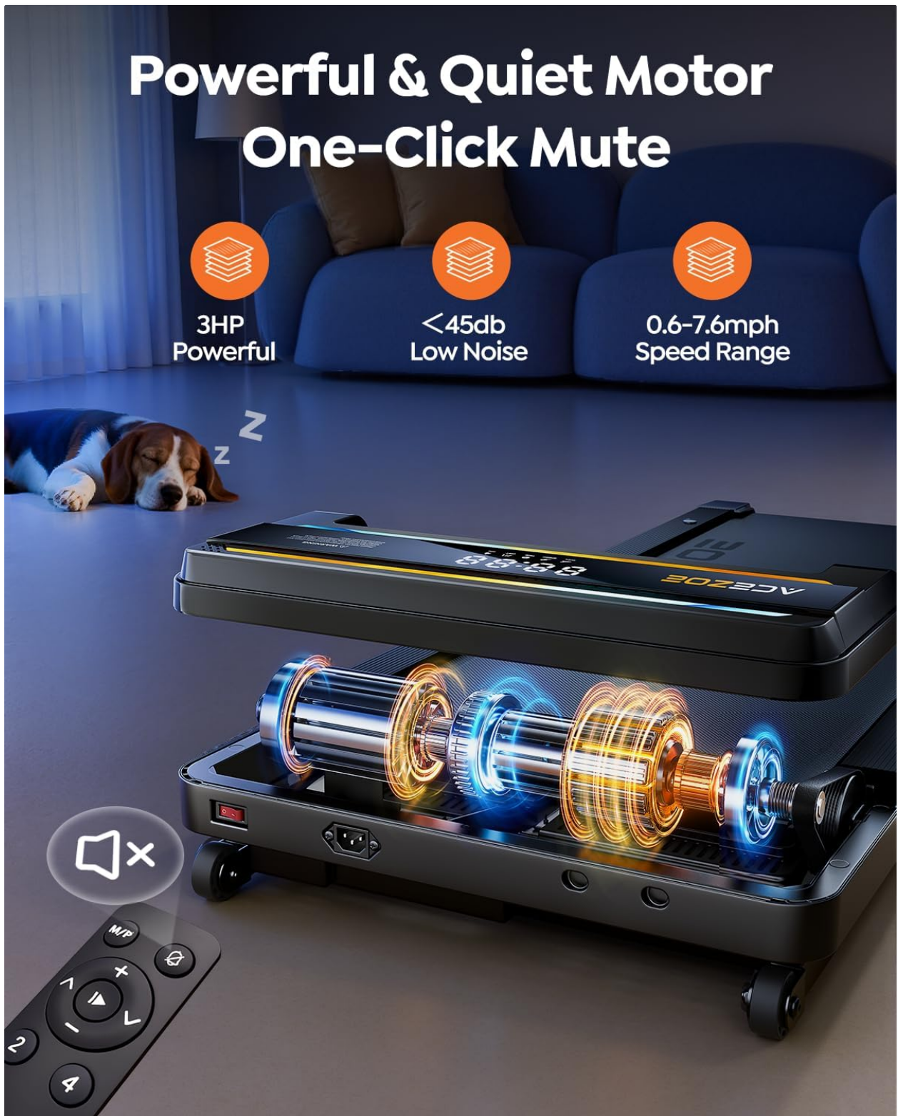
Image: Detailed view of the treadmill's 3.0HP motor, emphasizing its quiet performance.

45dB, suitable for home and office environments.