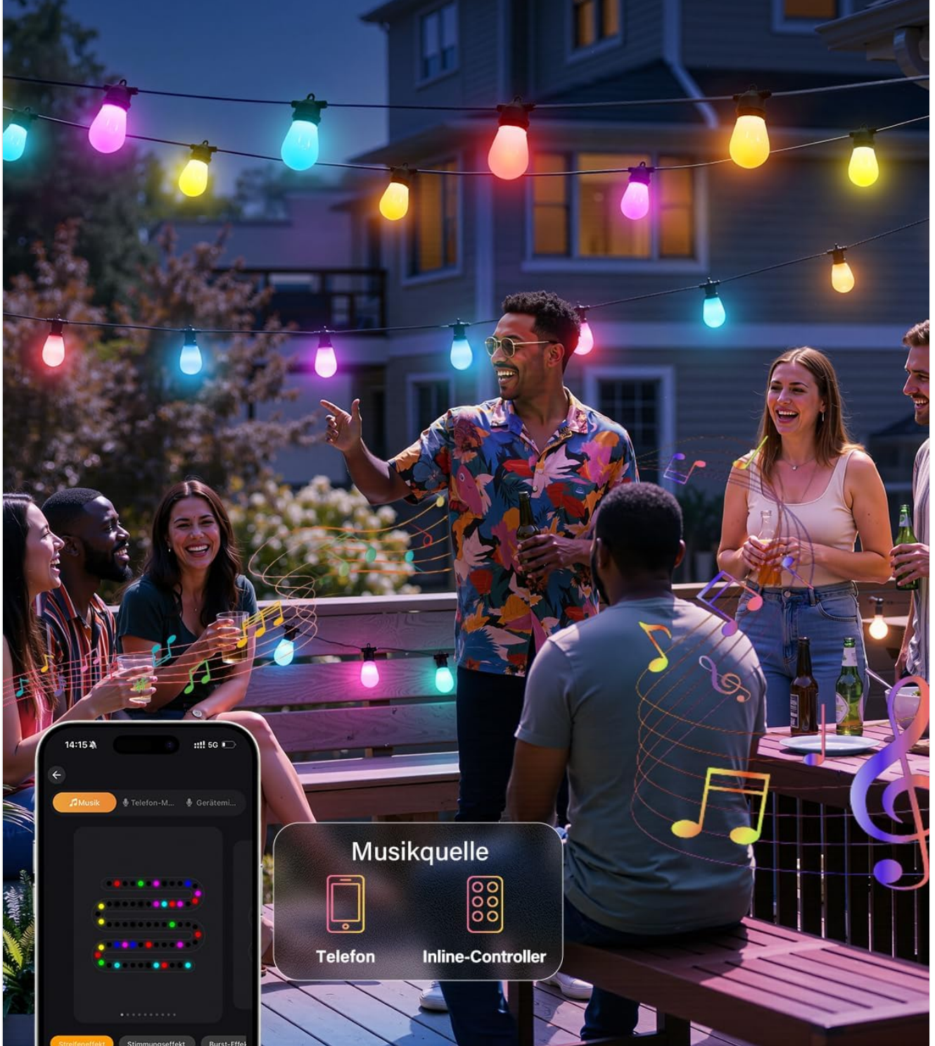
Image: Music-synchronized lighting transforming a patio space with dynamic light effects, as people enjoy a gathering.