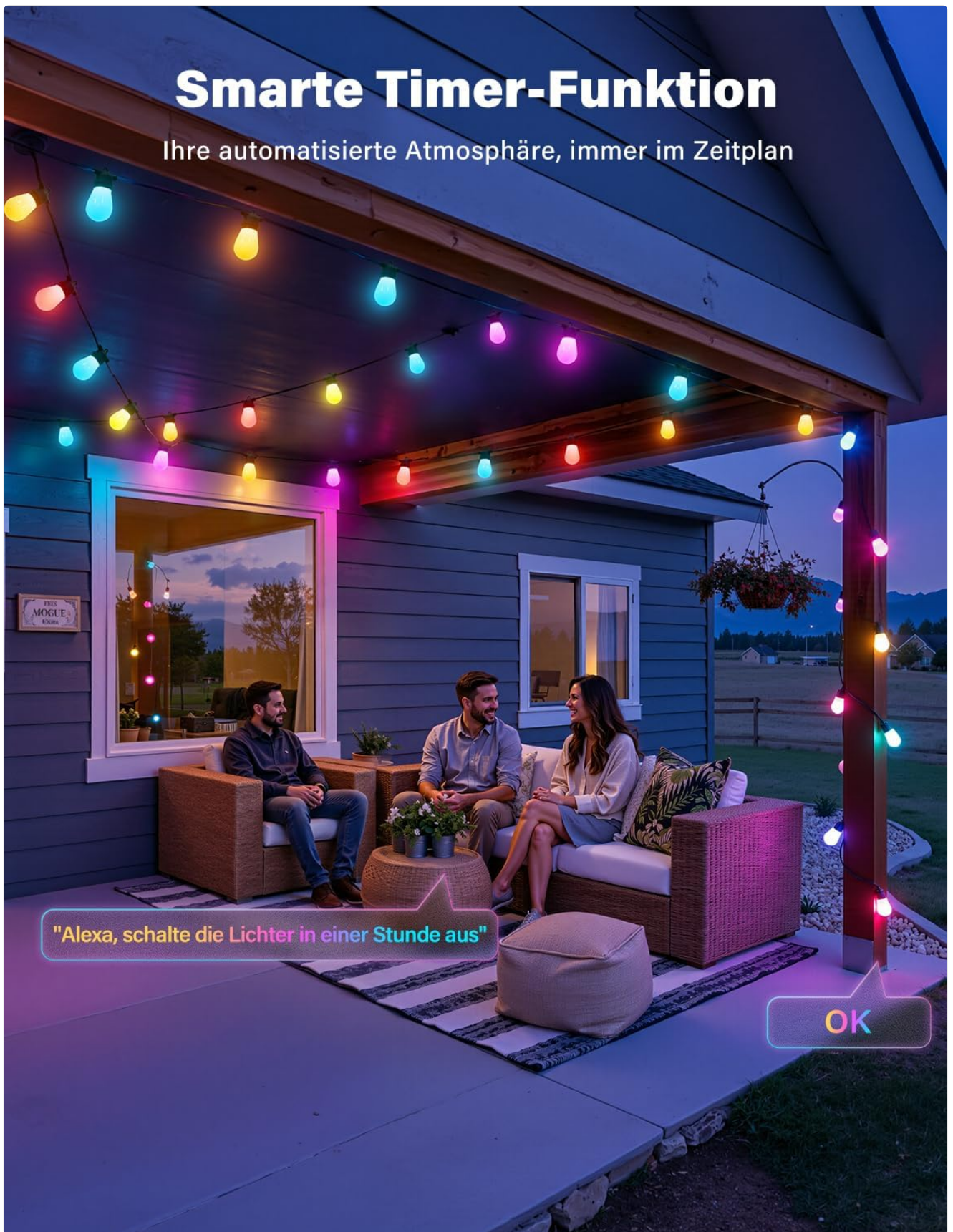
Image: Smart timer function in action, showing automated atmosphere control with string lights on a patio, responding to a voice command like "Alexa, turn off the lights in an hour."

Ihre automatisierte Atmosphäre, immer im Zeitplan