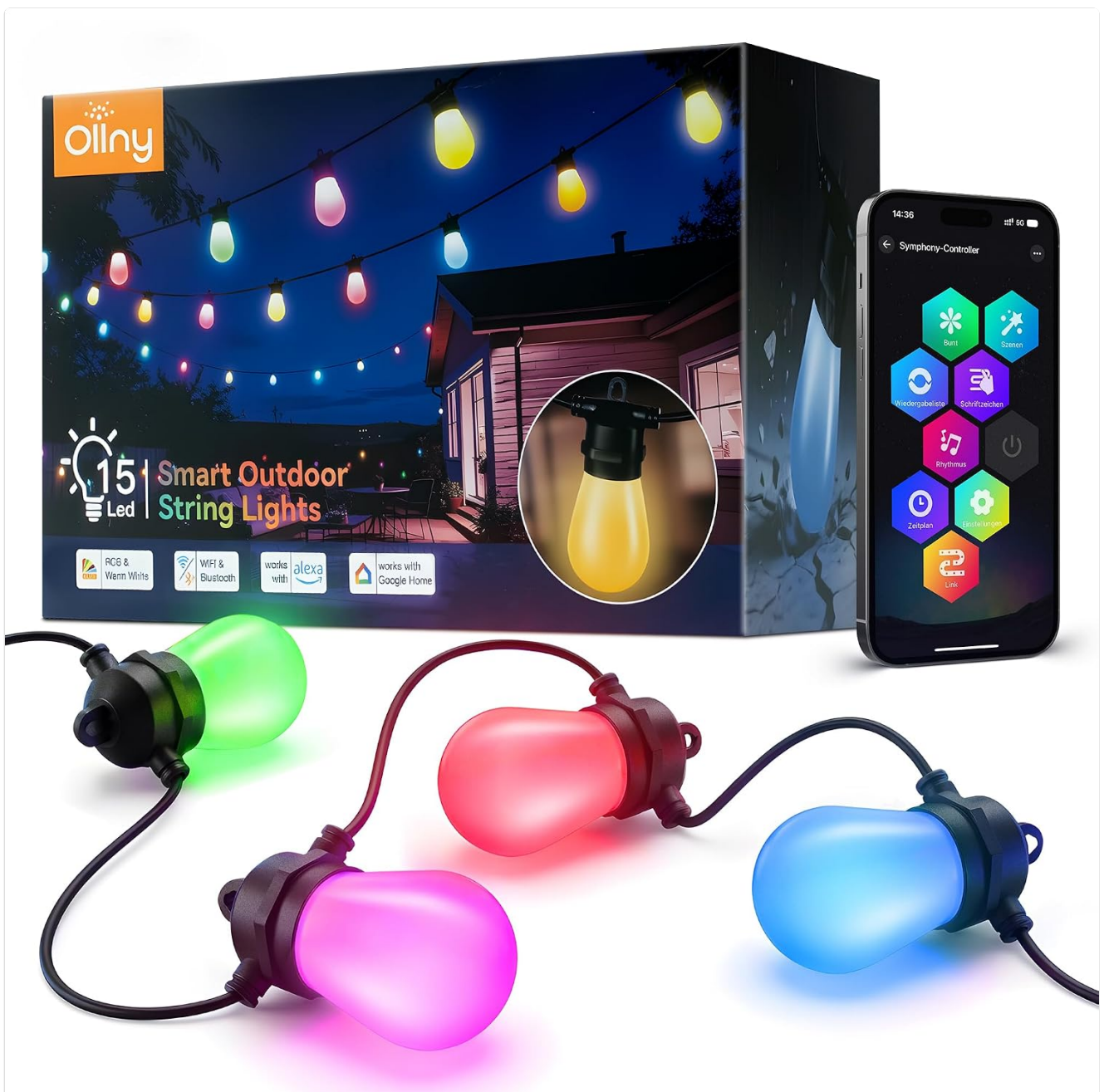
Image: Olny 15M RGBW S14 LED Outdoor String Lights illuminating a garden patio with warm white light, creating a relaxing atmosphere.