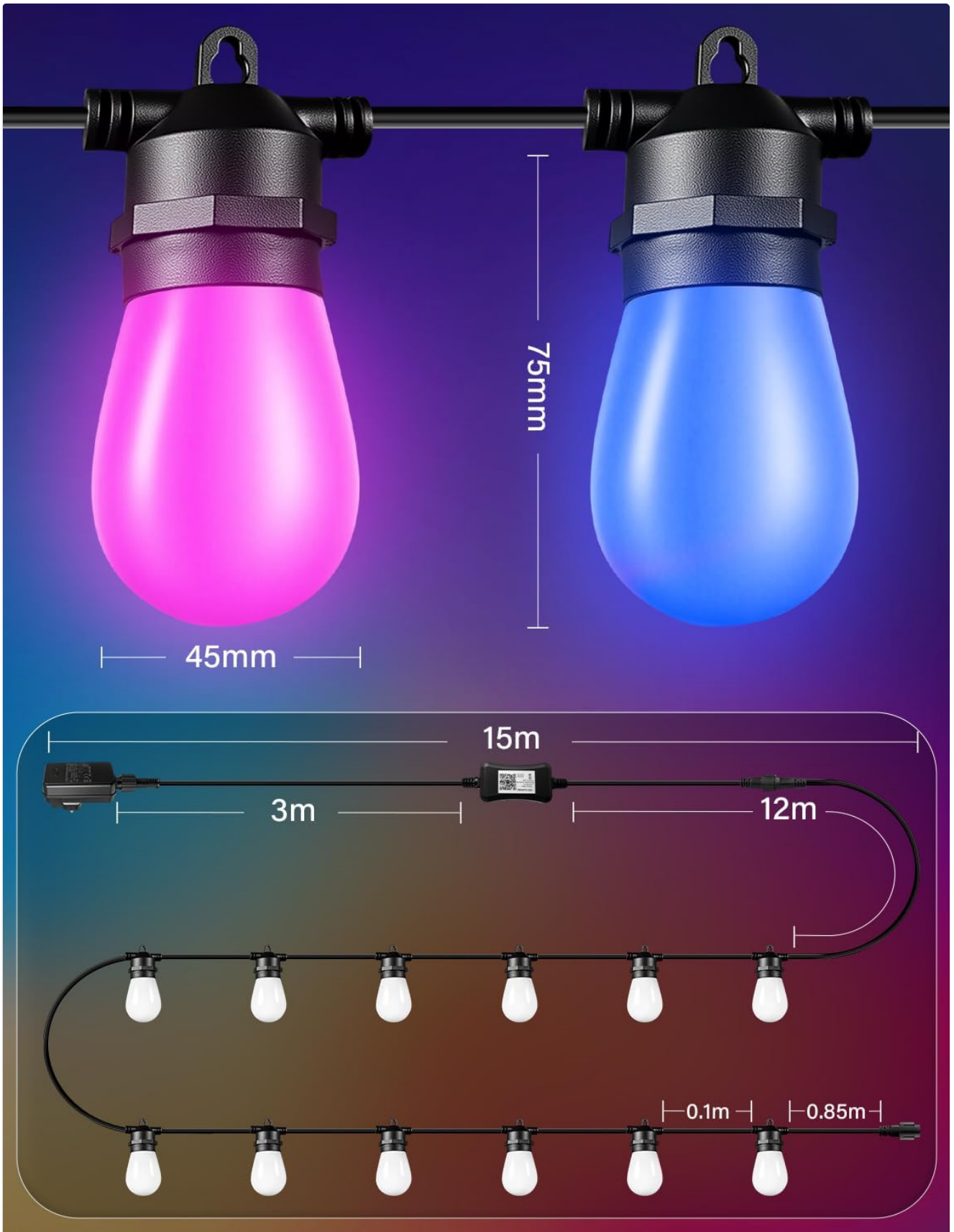
Image: Diagram illustrating the dimensions of the S14 bulbs (75mm height, 45mm width) and the 15-meter string light layout, including the 3m lead cable and 12m light section, with 0.85m spacing between bulbs and 0.1m bulb length.