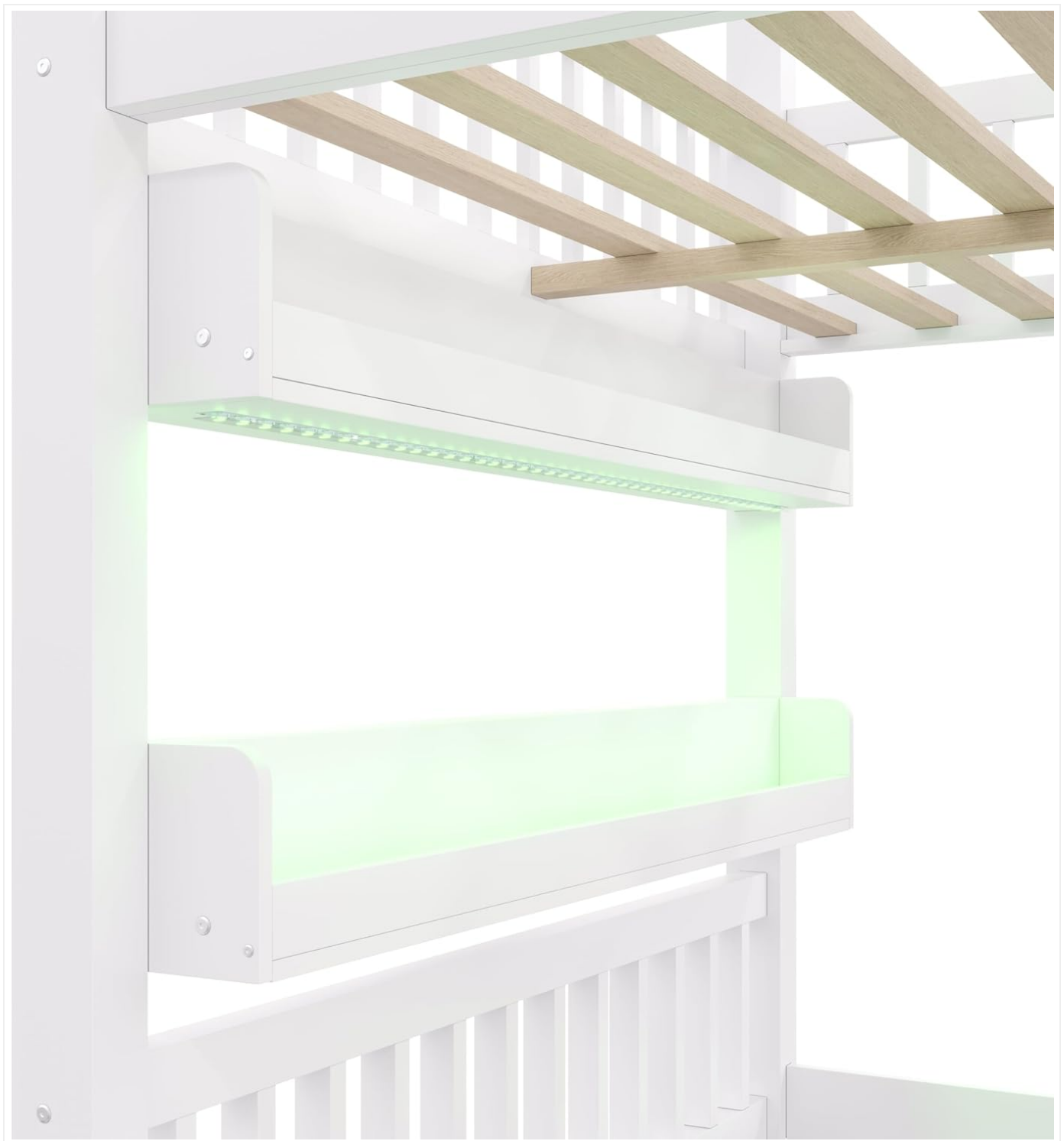
Image: A close-up view of the integrated LED shelf and the lower storage shelves on the VilroCaz House Bed. The LED light is visible, providing illumination, and the shelves are ready for books or small items.