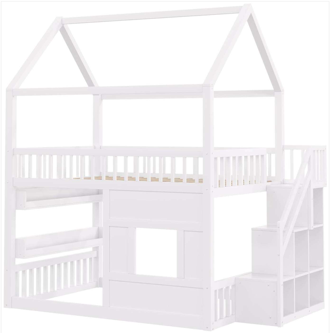
Image: A front-facing view of the VilroCaz House Bed frame, showing the house roof structure, the upper bed frame with guardrails, and the lower open space with a window-like cutout. This image helps visualize the structure during assembly.