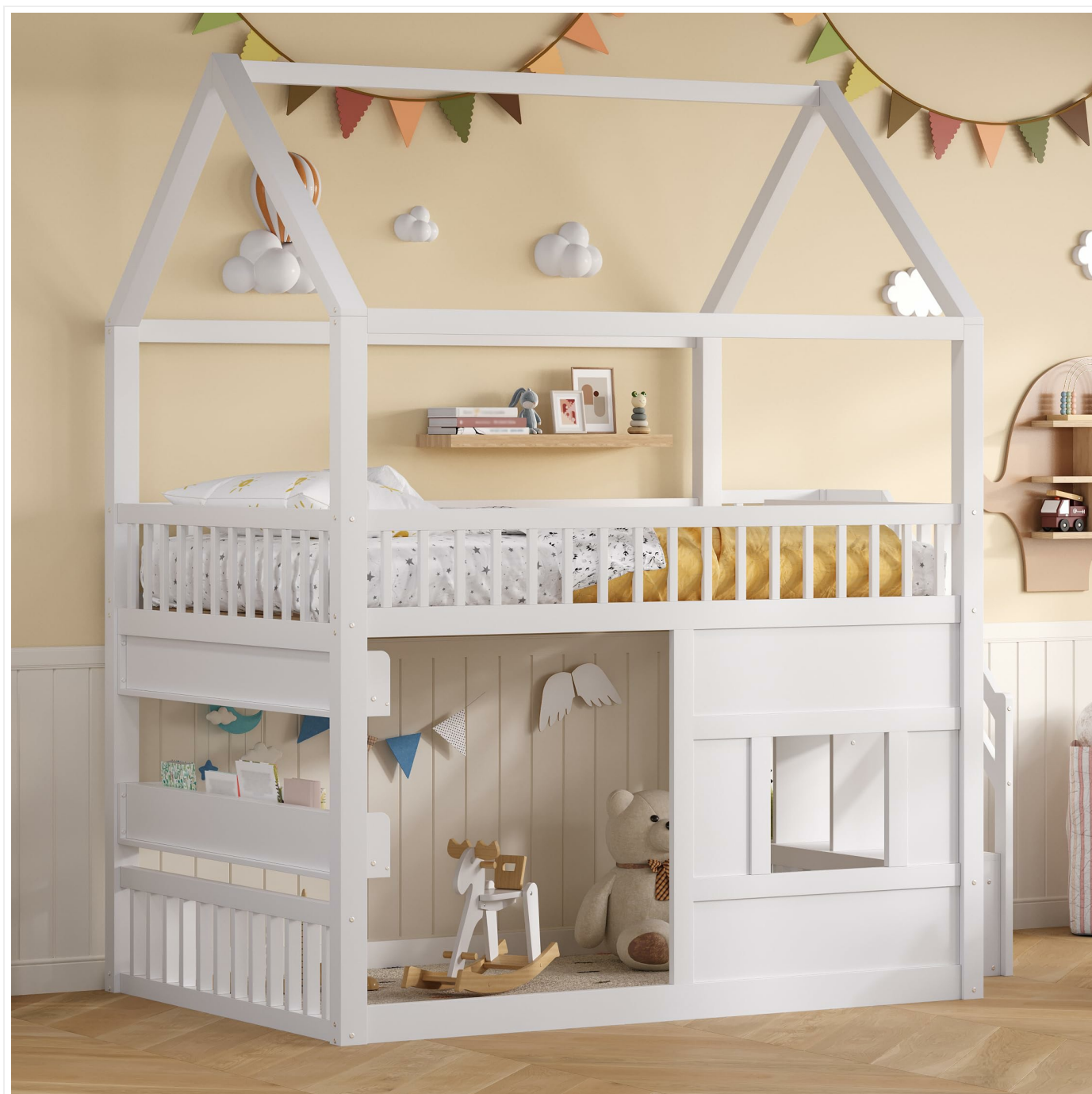
Image: A full view of the VilroCaz Full Size House Bed, showcasing its house-shaped frame, upper sleeping area, lower play/storage space, integrated LED shelf, and staircase with storage compartments. The bed is white and made of wood.