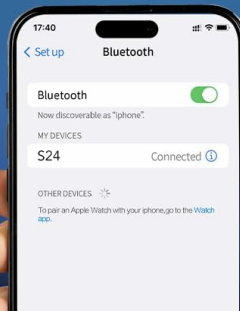
Image: The speaker supports both 3.5mm AUX and Bluetooth 5.4 connectivity.