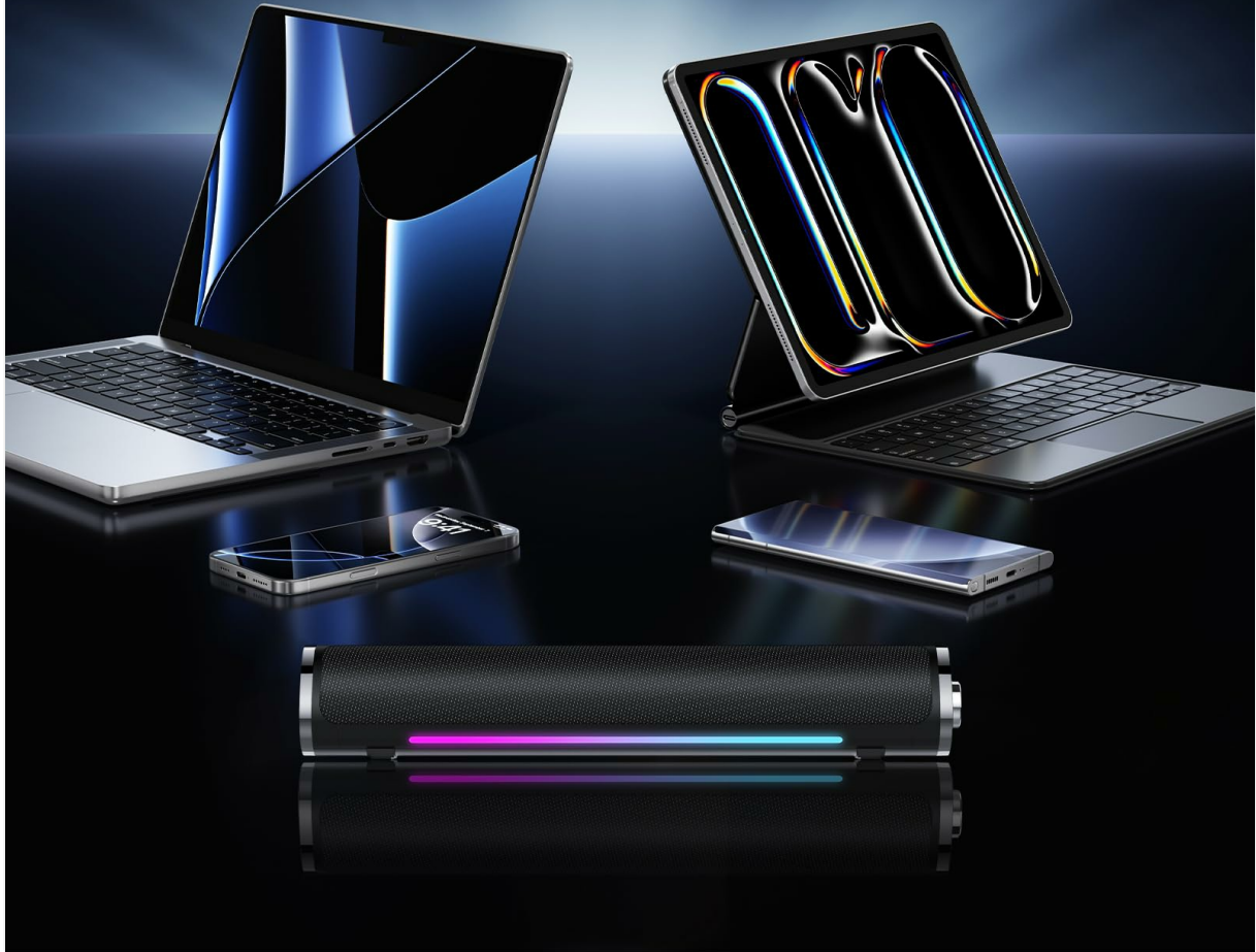
Image: The speaker is compatible with various devices like computers, laptops, tablets, and smartphones.

Enjoy enhanced sound on computers, smartphones, tablets and more.