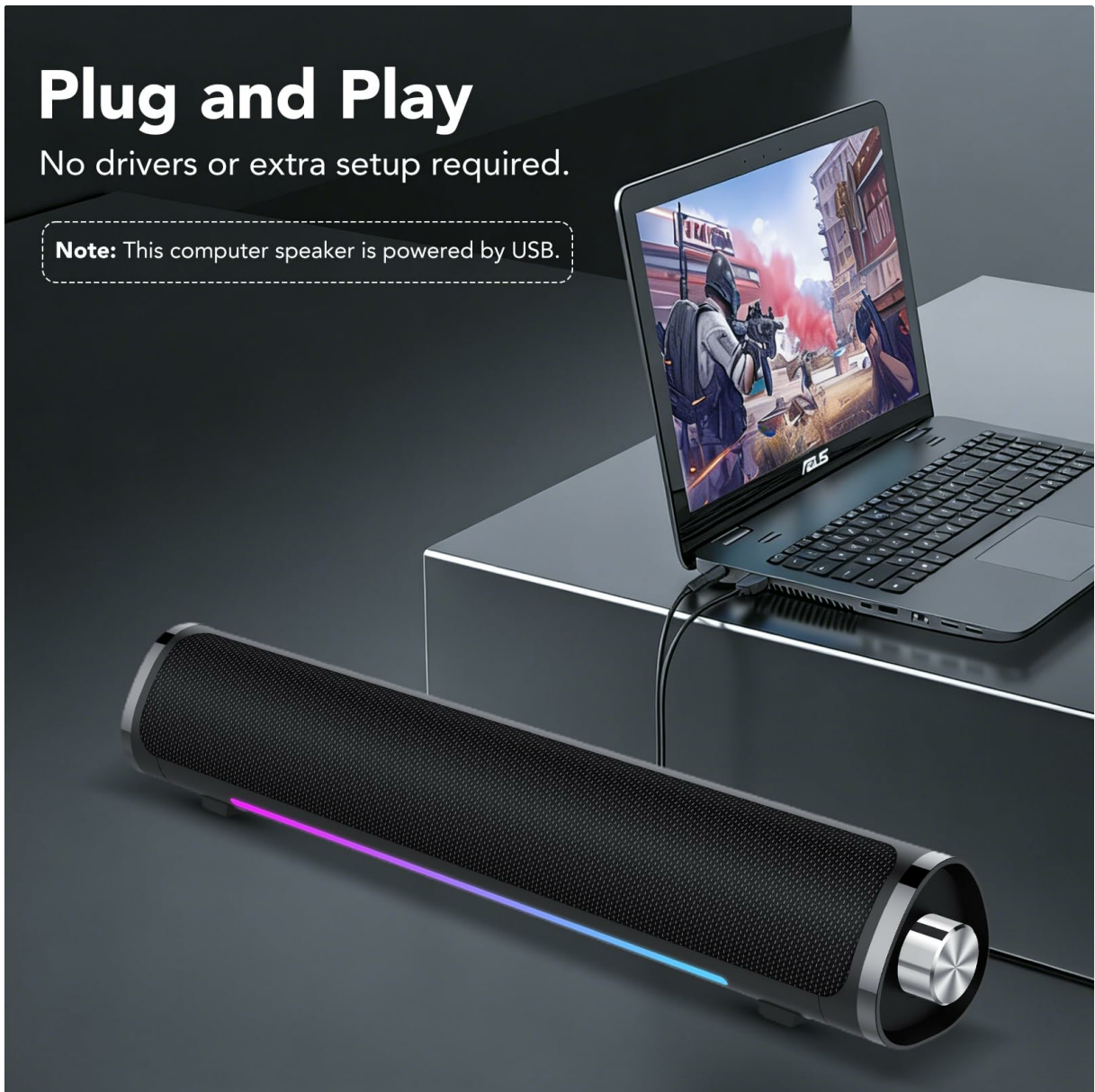
Image: The speaker requires USB power for operation.

Note: This computer speaker is powered by USB.