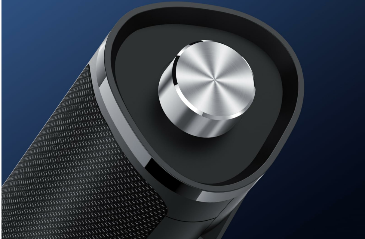
Image: The control knob allows for volume adjustment, play/pause, light mode switching, and connection mode selection.