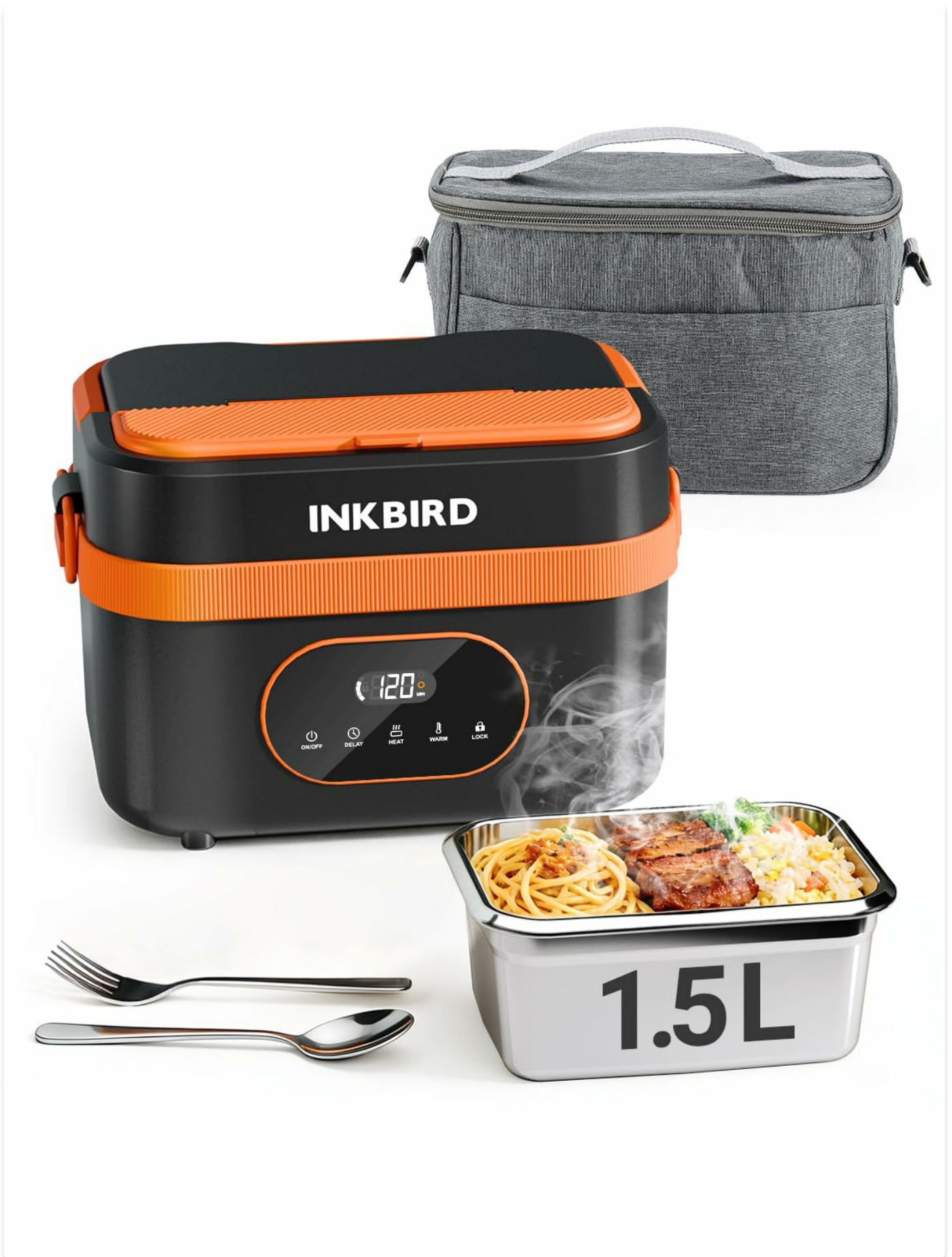
Image: The Inkbird Cordless Electric Lunch Box, showcasing its design and a heated meal.