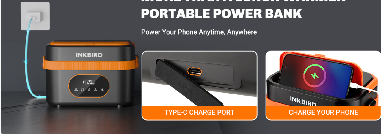
Image: The lunch box being charged via its TYPE-C port, also illustrating its ability to charge a mobile phone.