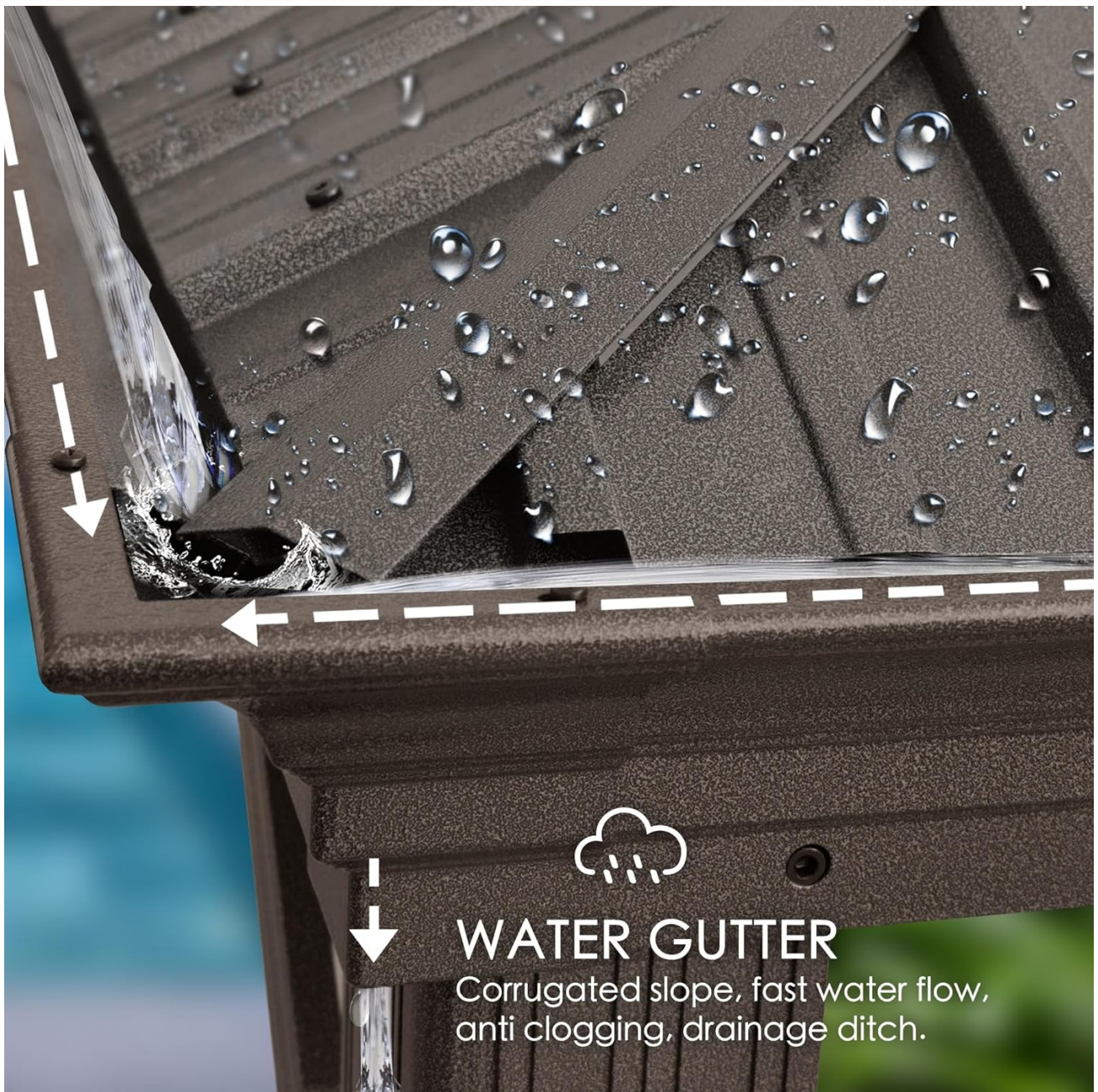
Image: A close-up of the water gutter system, demonstrating its corrugated slope for fast water flow and anti-clogging drainage ditch.