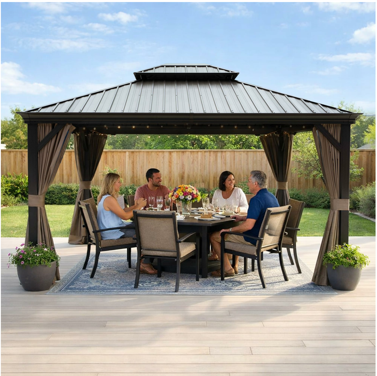
Image: The Kozyard Alexander 10' x 14' Hardtop Gazebo, showcasing its overall design and brown finish.