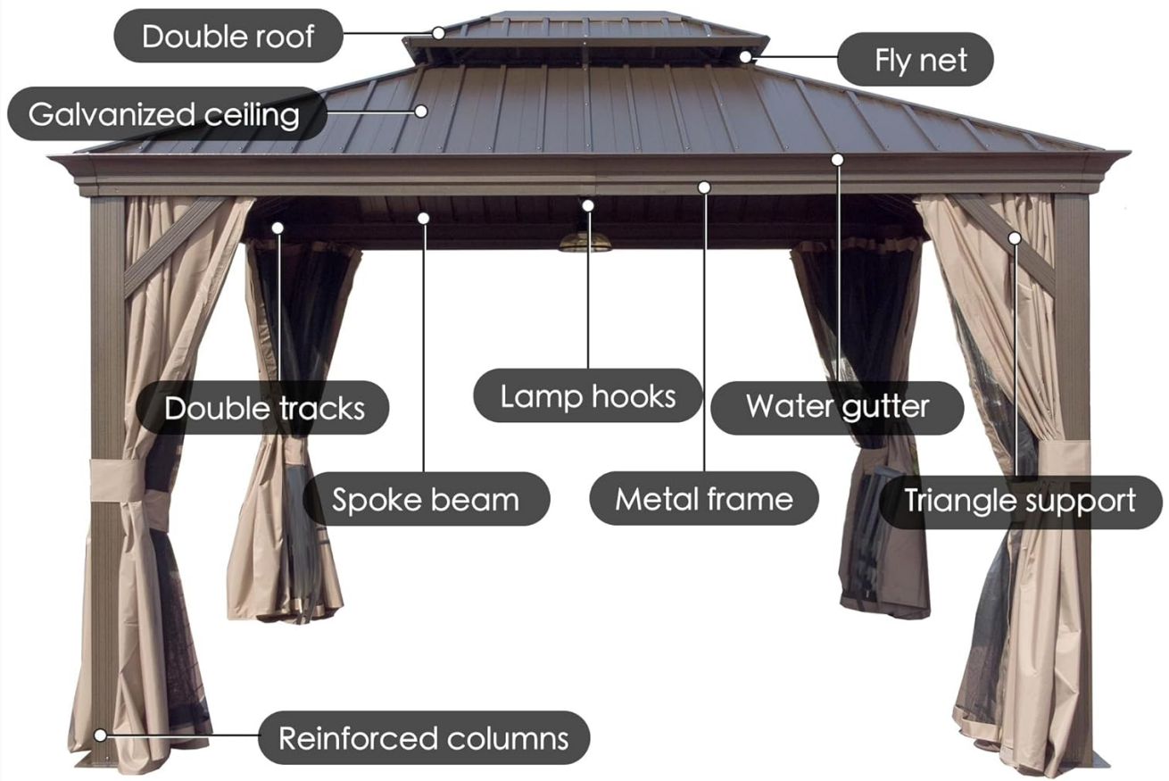
Image: A diagram highlighting the gazebo's full features, including double roof, galvanized ceiling, fly net, double tracks, lamp hooks, water gutter, spoke beam, metal frame, triangle support, and reinforced columns.

Resting, reading, dining, and gathering in nature is a truly enjoyable life.