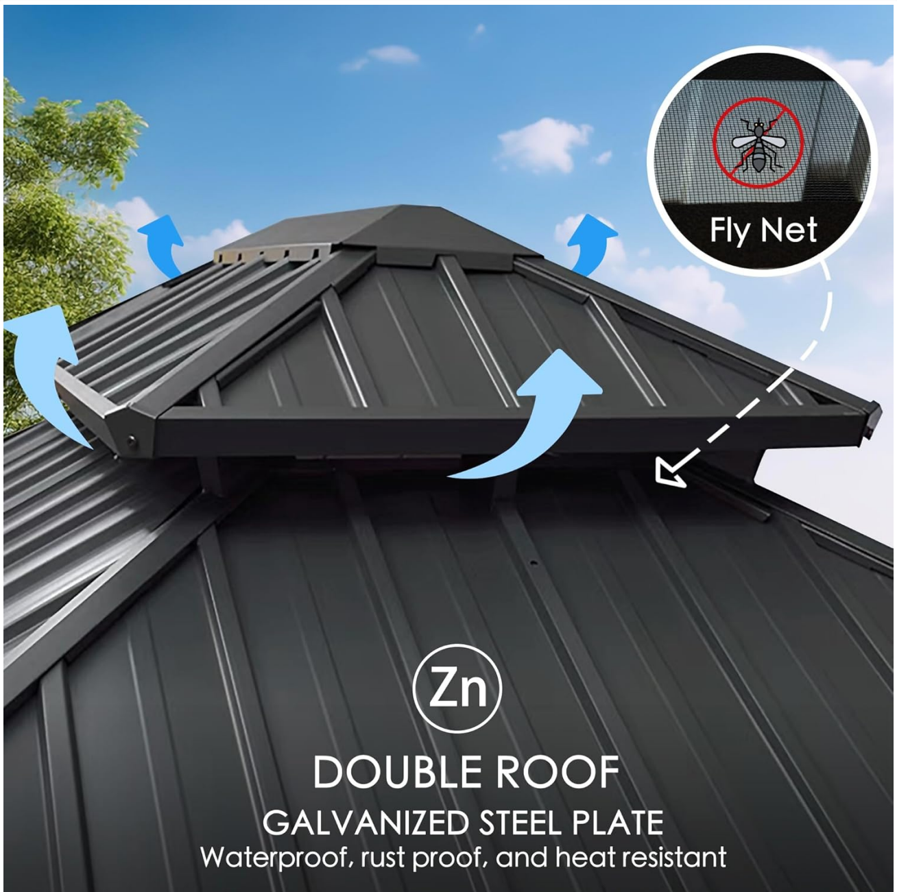
Image: An illustration of the double-roof design, highlighting its galvanized steel plate construction for waterproofing, rust-proofing, and heat resistance, along with the integrated fly net.