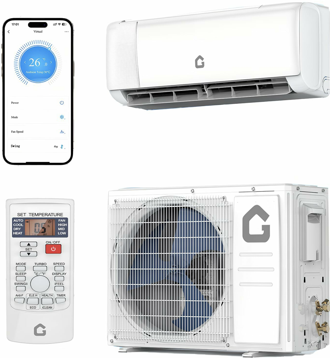
Image 1.1: Acekool 18000 BTU Split Air Conditioner system components.

The system is engineered for stable operation across a wide temperature range, from -13°F to 140°F, ensuring reliable performance in various climates. Its design focuses on energy efficiency and quiet operation.