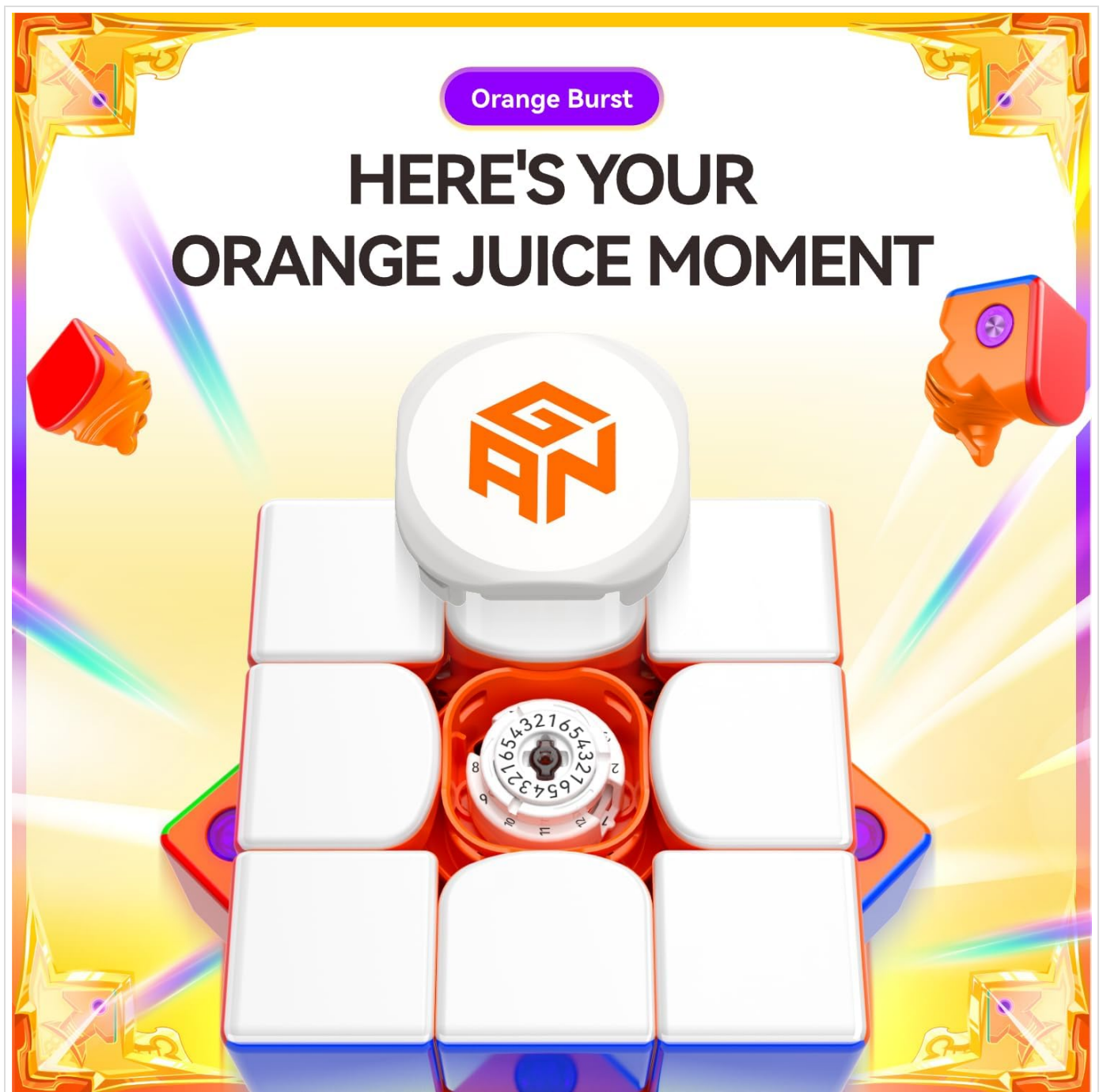
Image: A detailed view of the cube's core, illustrating the tension adjustment system accessible by removing the center cap. The dial shows numbered settings for fine-tuning.