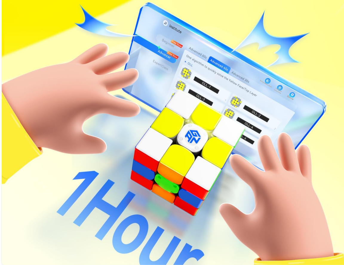
Image: A user holding the GAN i Carry 4 cube and a smartphone displaying the CubeStation app interface, ready for connection.