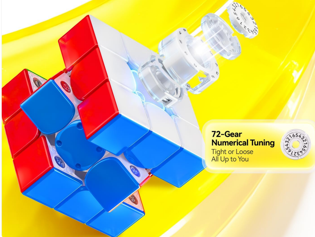
Image: An exploded view of the GAN i Carry 4's core, highlighting the 72-gear numerical tuning system for tension adjustment.

Racing-grade Feel, Addictive from the First Turn.