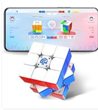
Image: The GAN i Carry 4 cube, its storage box, tuning tool, and user manual.