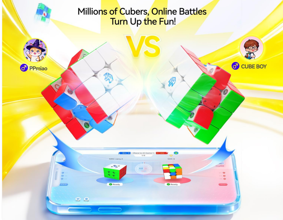
Image: The CubeStation app displaying an online competition interface with two cubes and player avatars, indicating a real-time battle.

Millions of Cubers, Online Battles Turn Up the Fun!