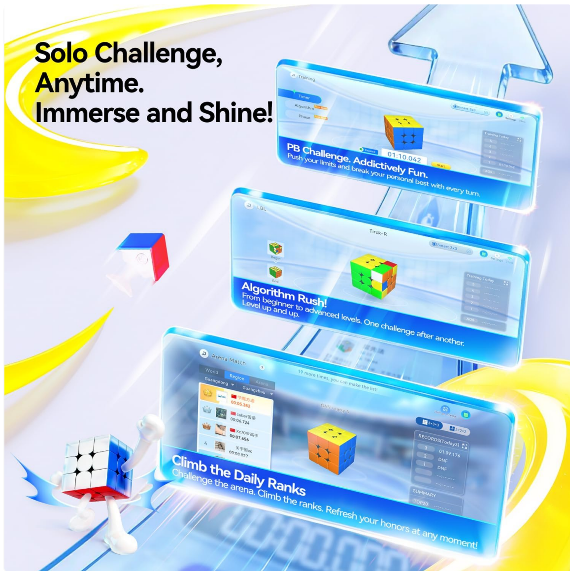
Image: Multiple screens from the CubeStation app, showcasing various solo challenge modes and performance tracking features.

Solo Challenge, Anytime. Immerse and Shine!