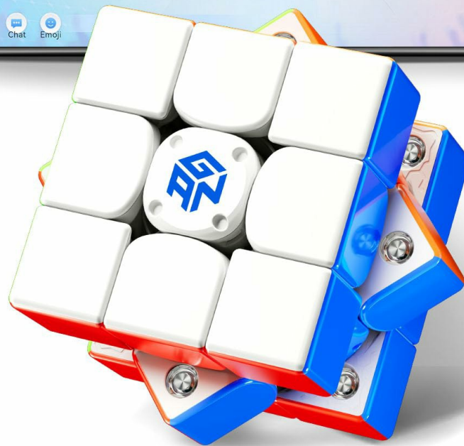
Image: The GAN i Carry 4 Smart Cube, a 3x3 puzzle with a frosted finish.