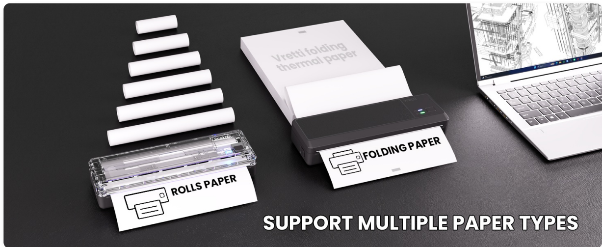
Image: Demonstrates the clean, inkless operation of the printer, emphasizing no mess from ink or toner.