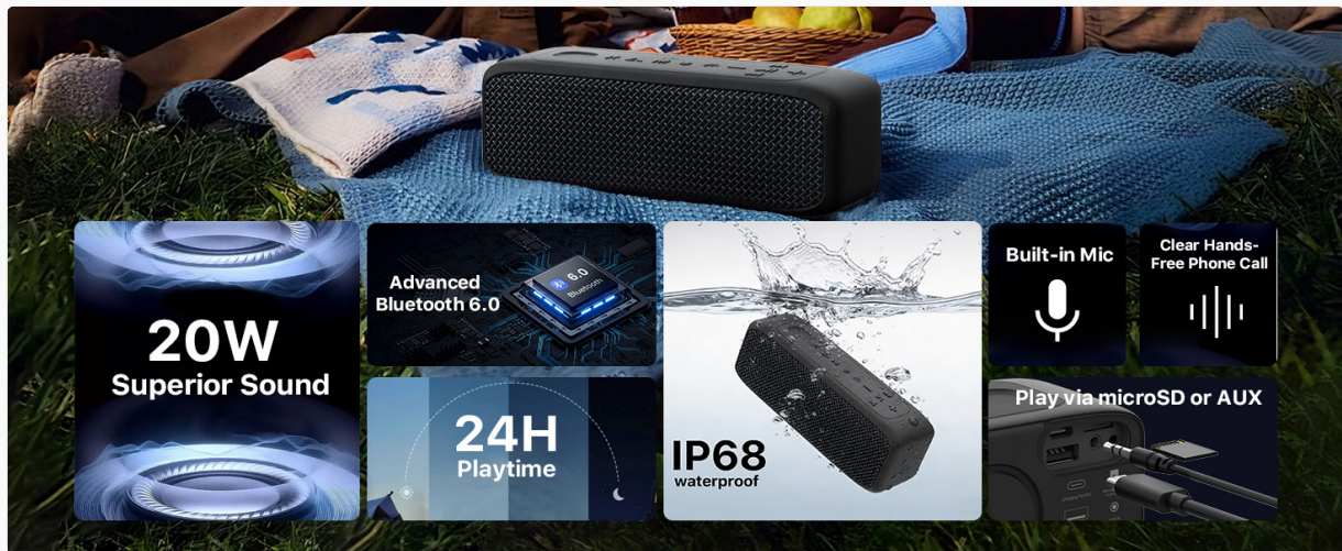
Figure 5: Bluetooth 6.0 for stable signal and easy pairing.