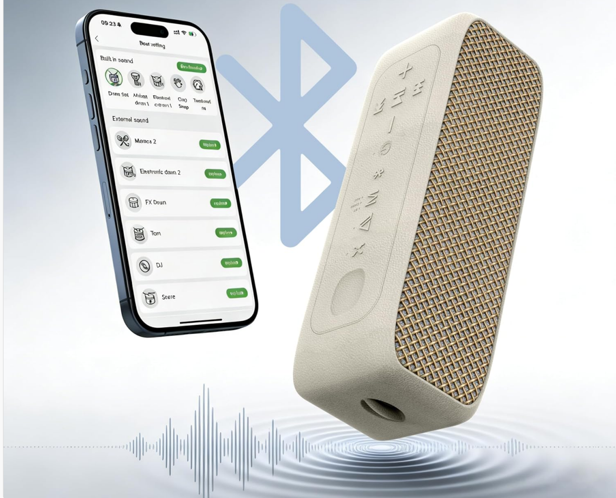
Figure 2: Top-mounted controls for volume, mode, and other functions.