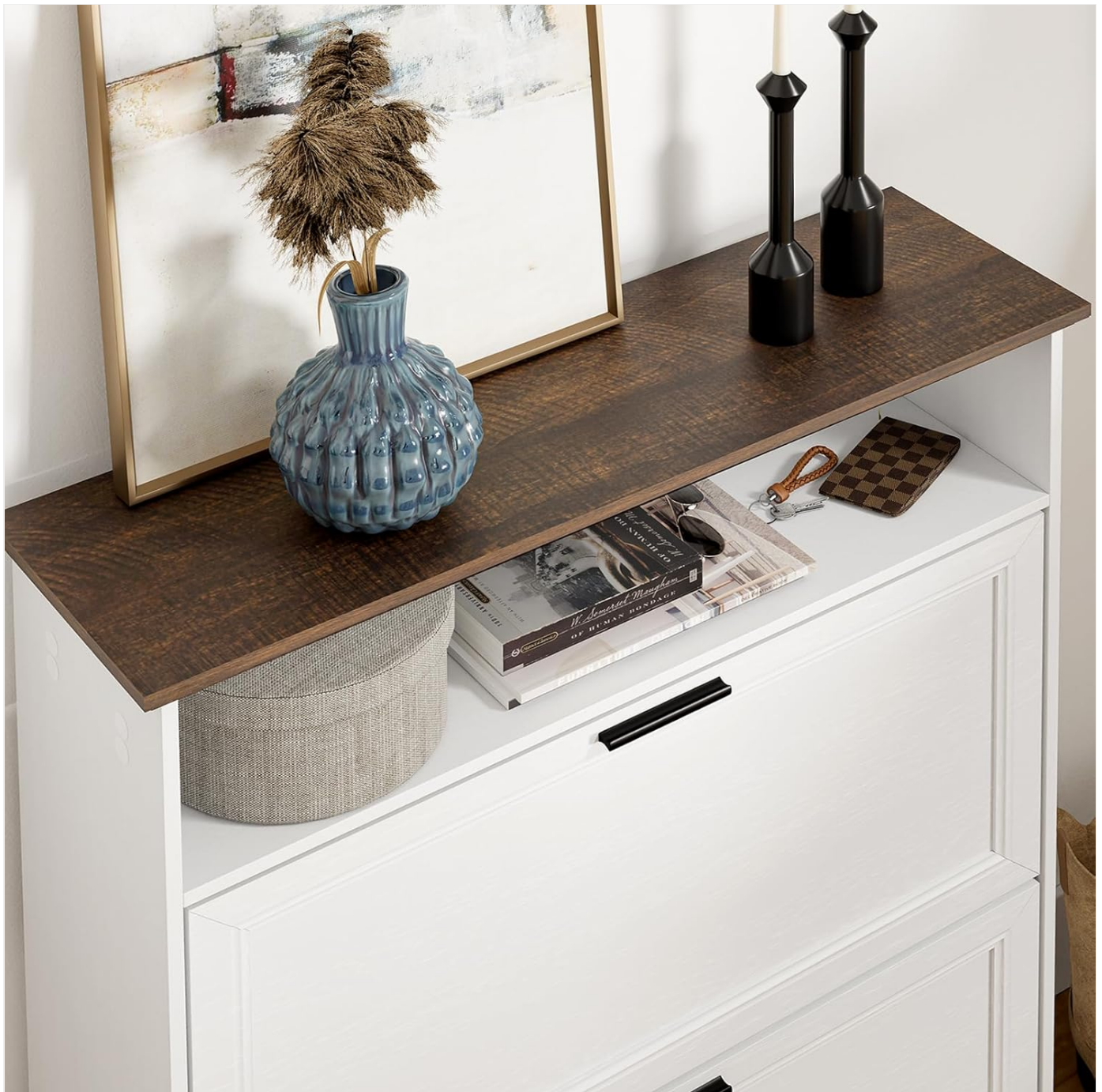
Figure 1: Product Dimensions and Key Features. The cabinet measures approximately 31.4 inches wide, 9.4 inches deep, and 41.3 inches high. It features two flip drawers, an open shelf, and side hooks.

The cabinet includes two flip drawers, an open top shelf, and two side hooks for additional storage. The slim design is ideal for narrow spaces.