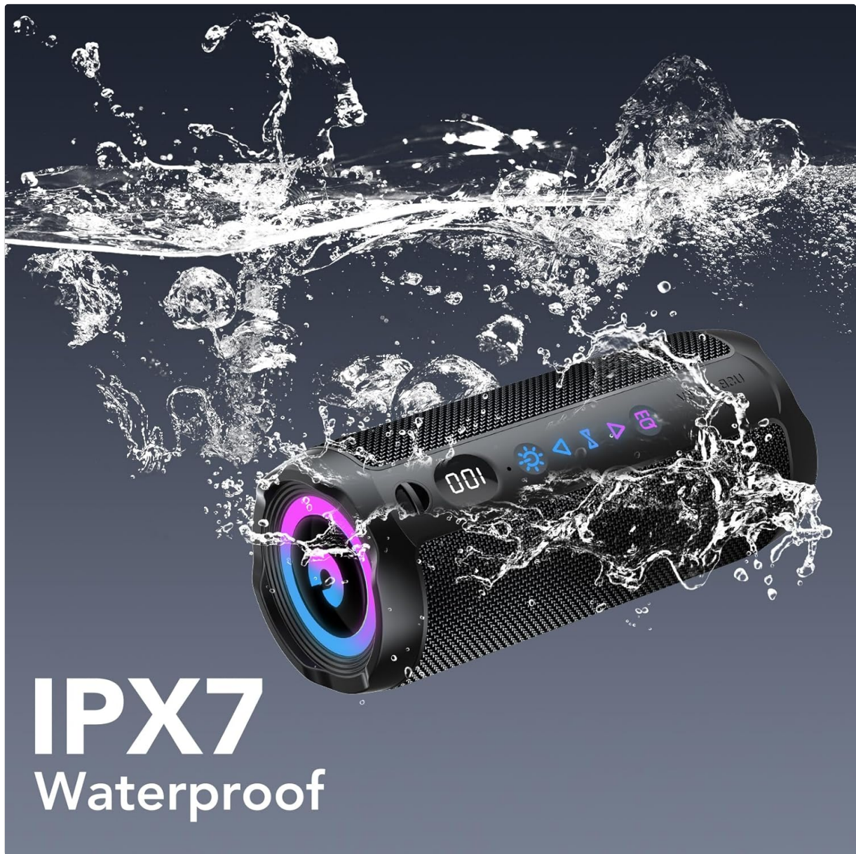
Image: IPX7 Waterproof rating demonstration.