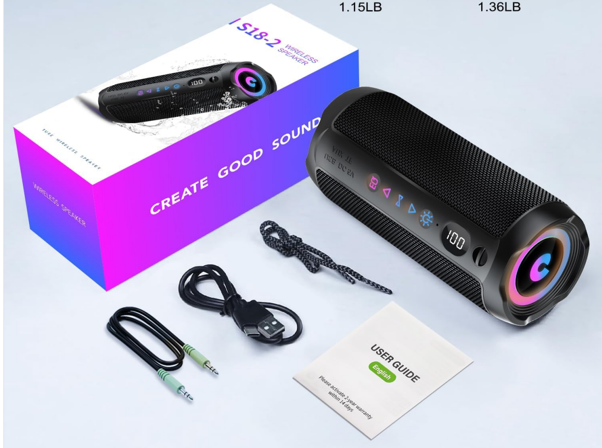
Image: Coioc S18 speaker with included accessories.