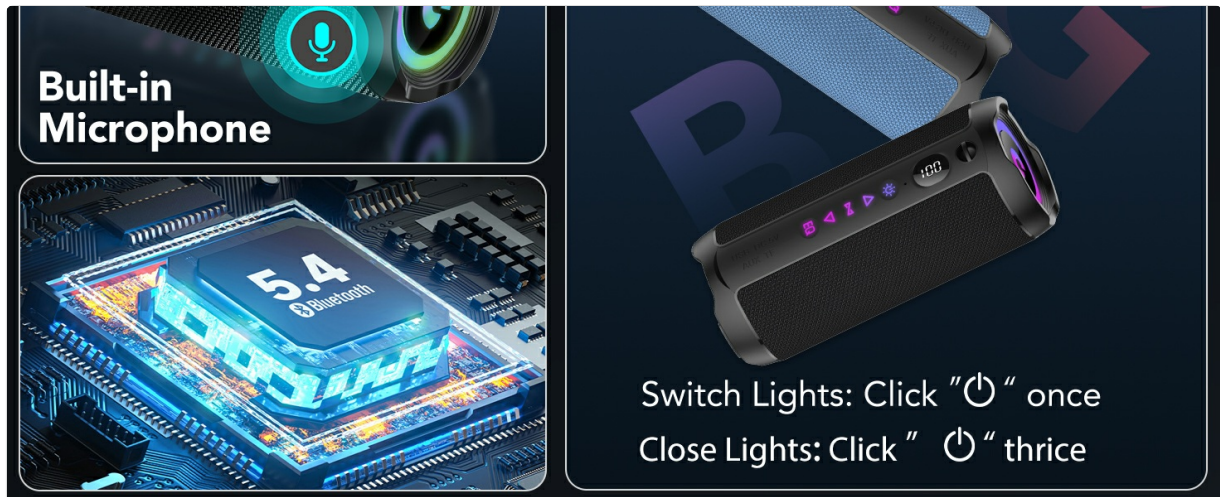
Image: Smart Button Control layout and functions.