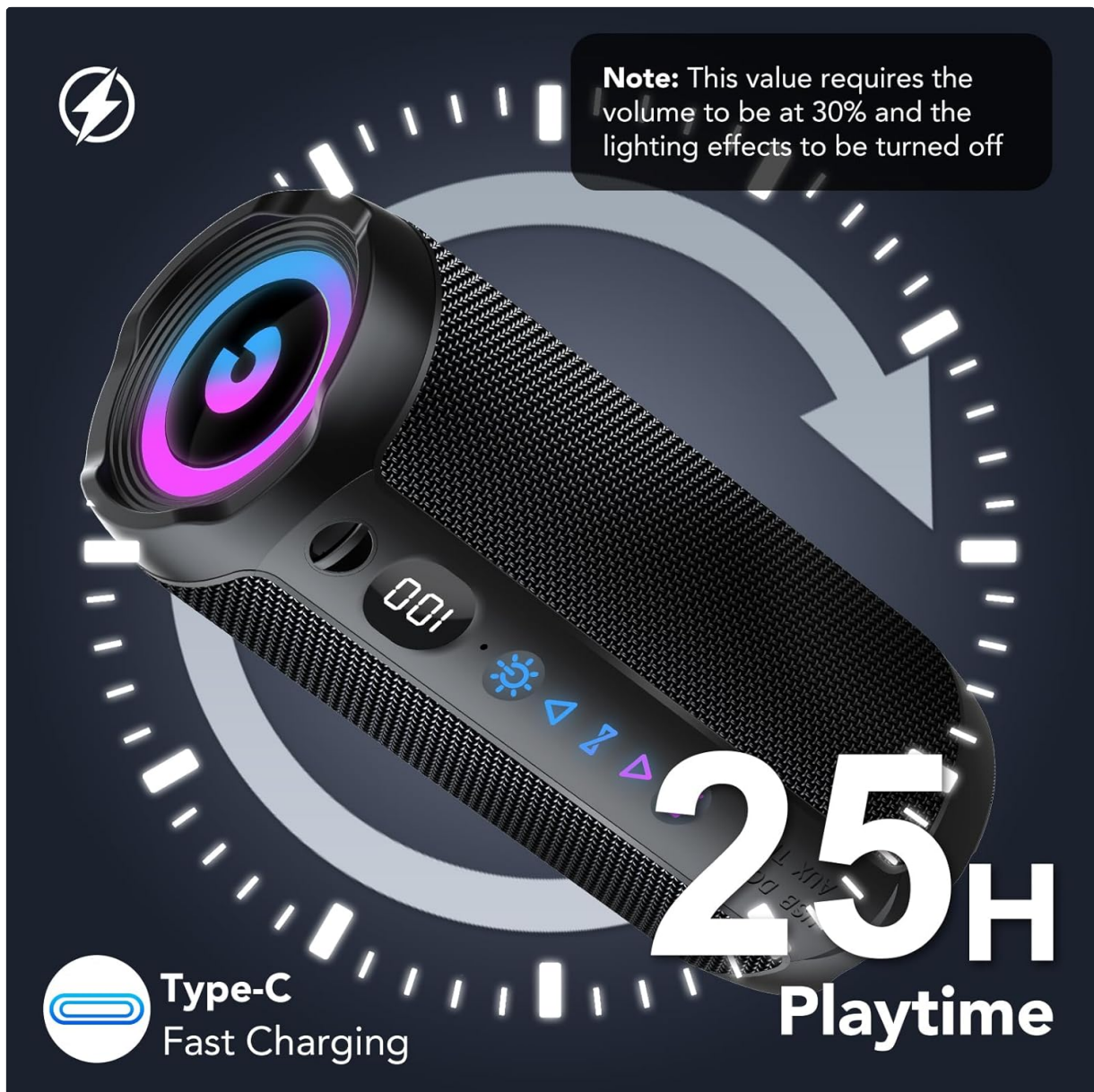
Image: 25H Playtime and Type-C Fast Charging.