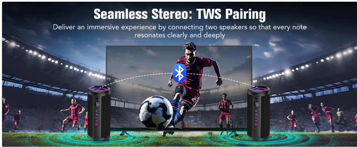
Image: TWS Wireless Pairing setup.

Your browser does not support the video tag.