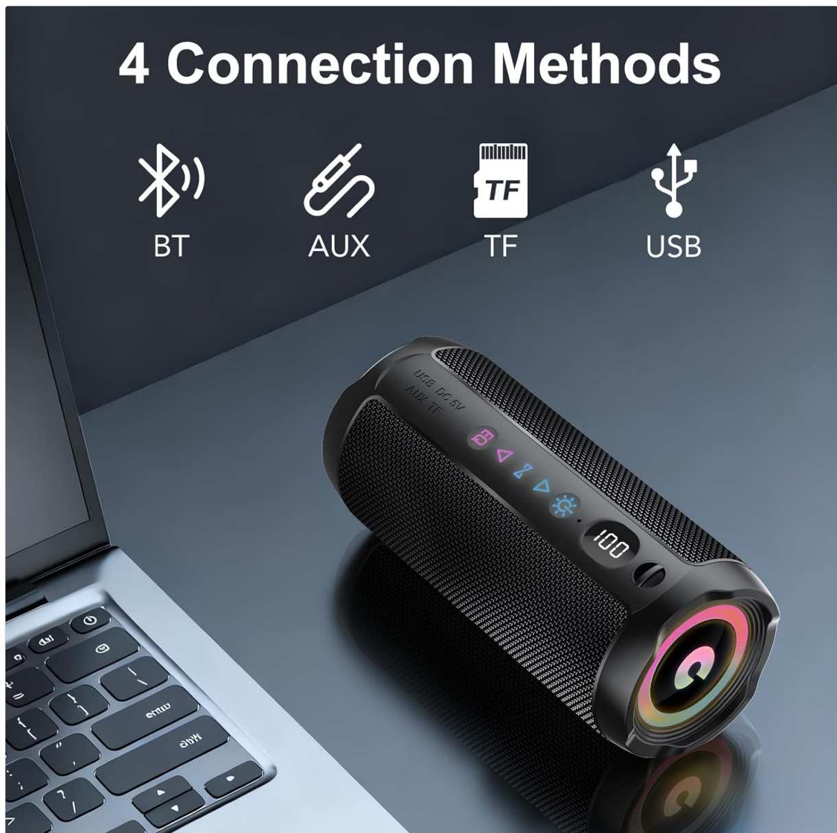
Image: Coioc S18 speaker with its four connection methods.