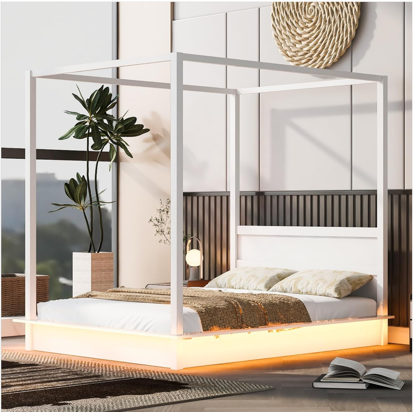
Image 4.2: Side view of the bed, highlighting the LED lighting effect along the base.