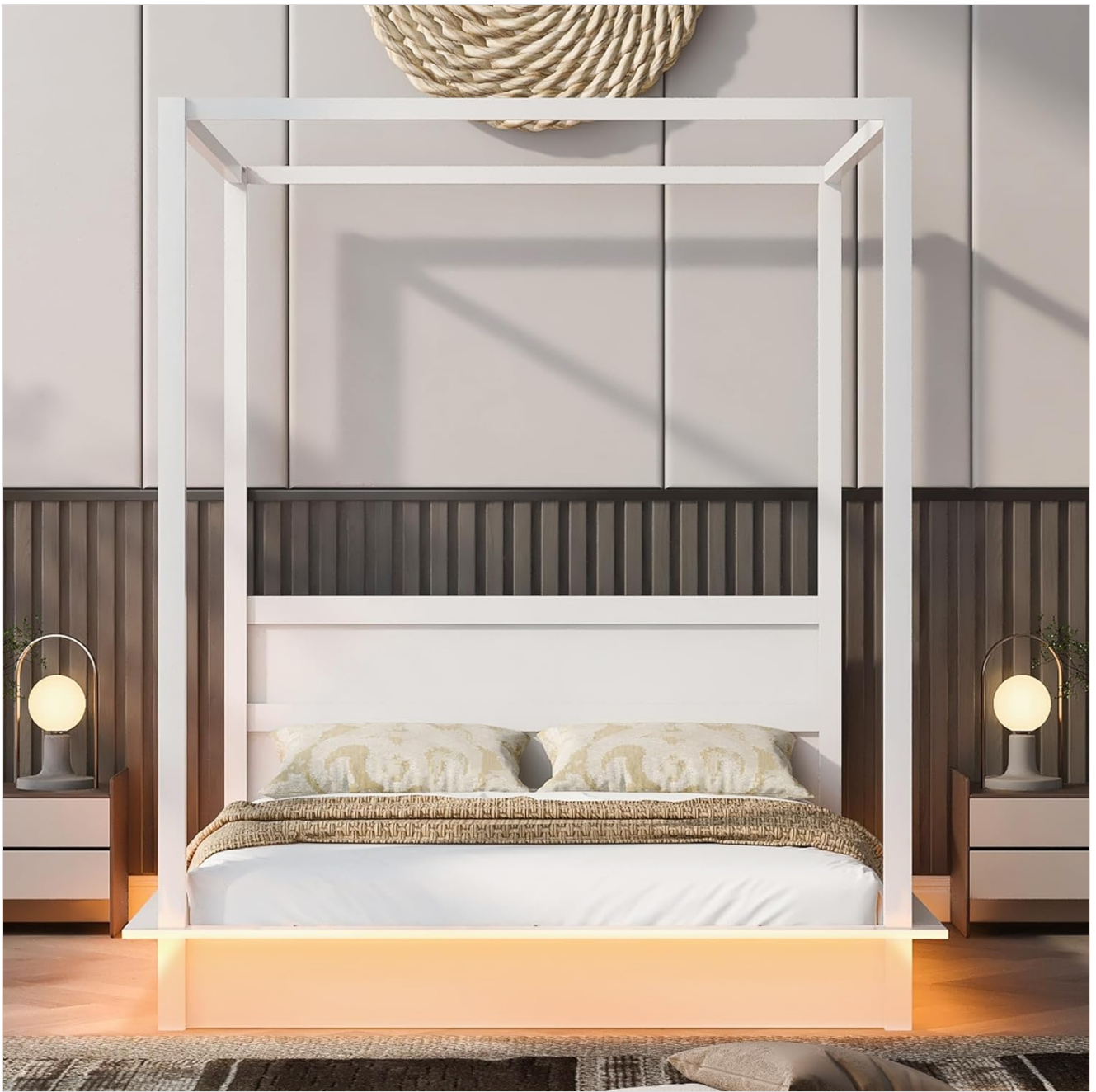
Image 4.1: Front view of the bed with the integrated LED lighting turned on, creating a warm glow.