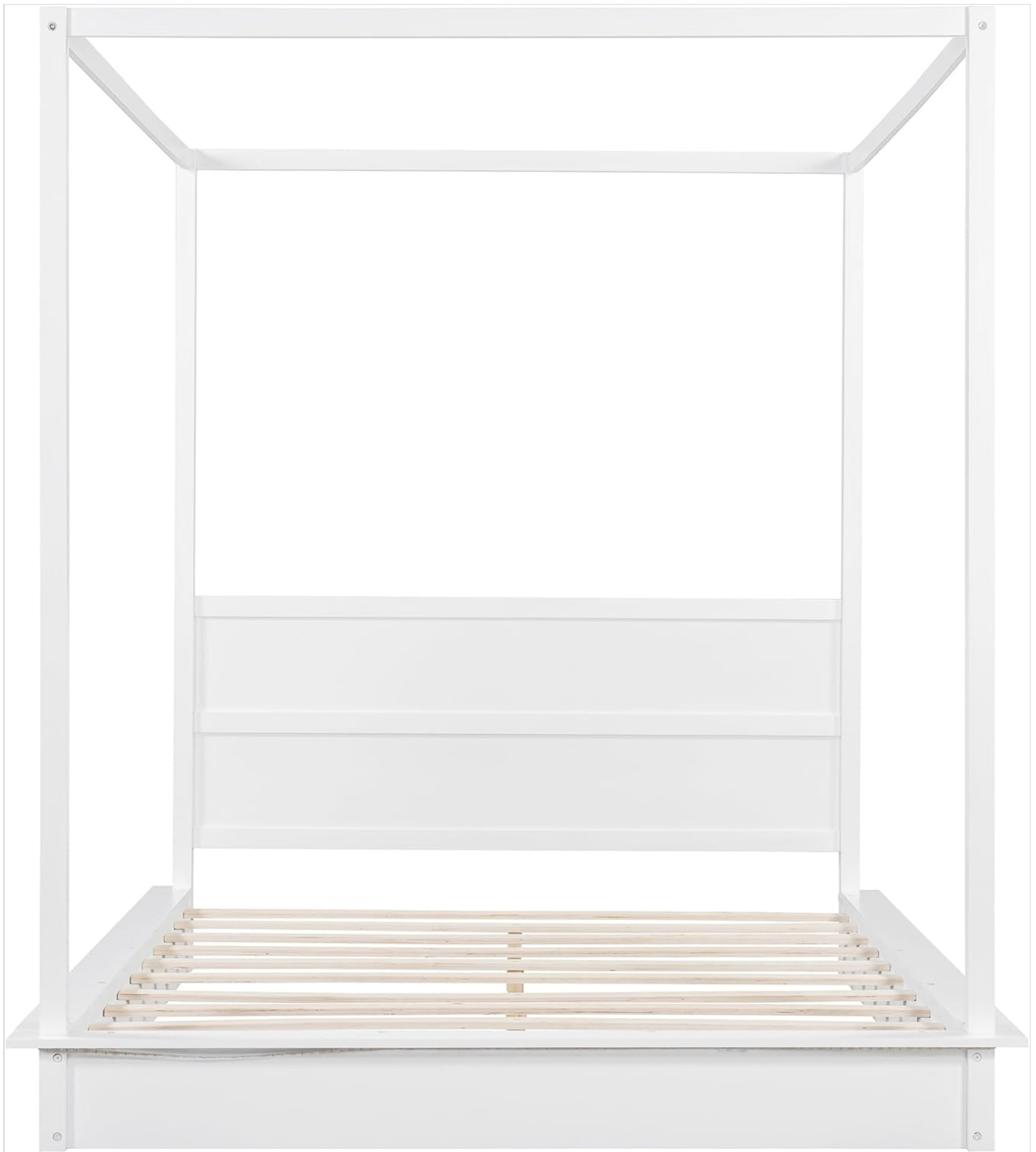
Image 1.1: Front view of the DNYN Queen Size Canopy Platform Bed frame, showcasing its structure without a mattress.