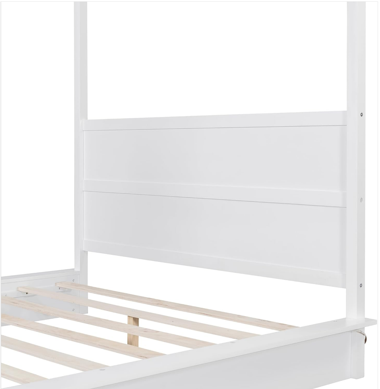
Image 3.2: Close-up of the headboard and wooden slat support system, showing structural details.