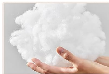
High Grade Cotton