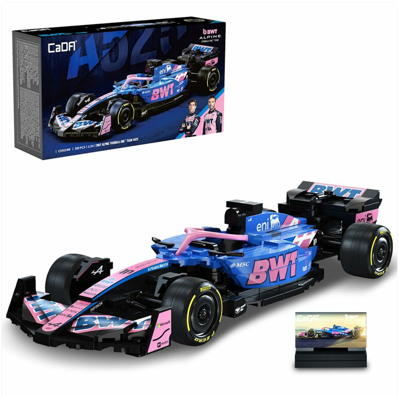
Image: The fully assembled CaDA C55024W BWT Alpine F1 Team A525 Building Blocks Car, showcasing its design and branding.