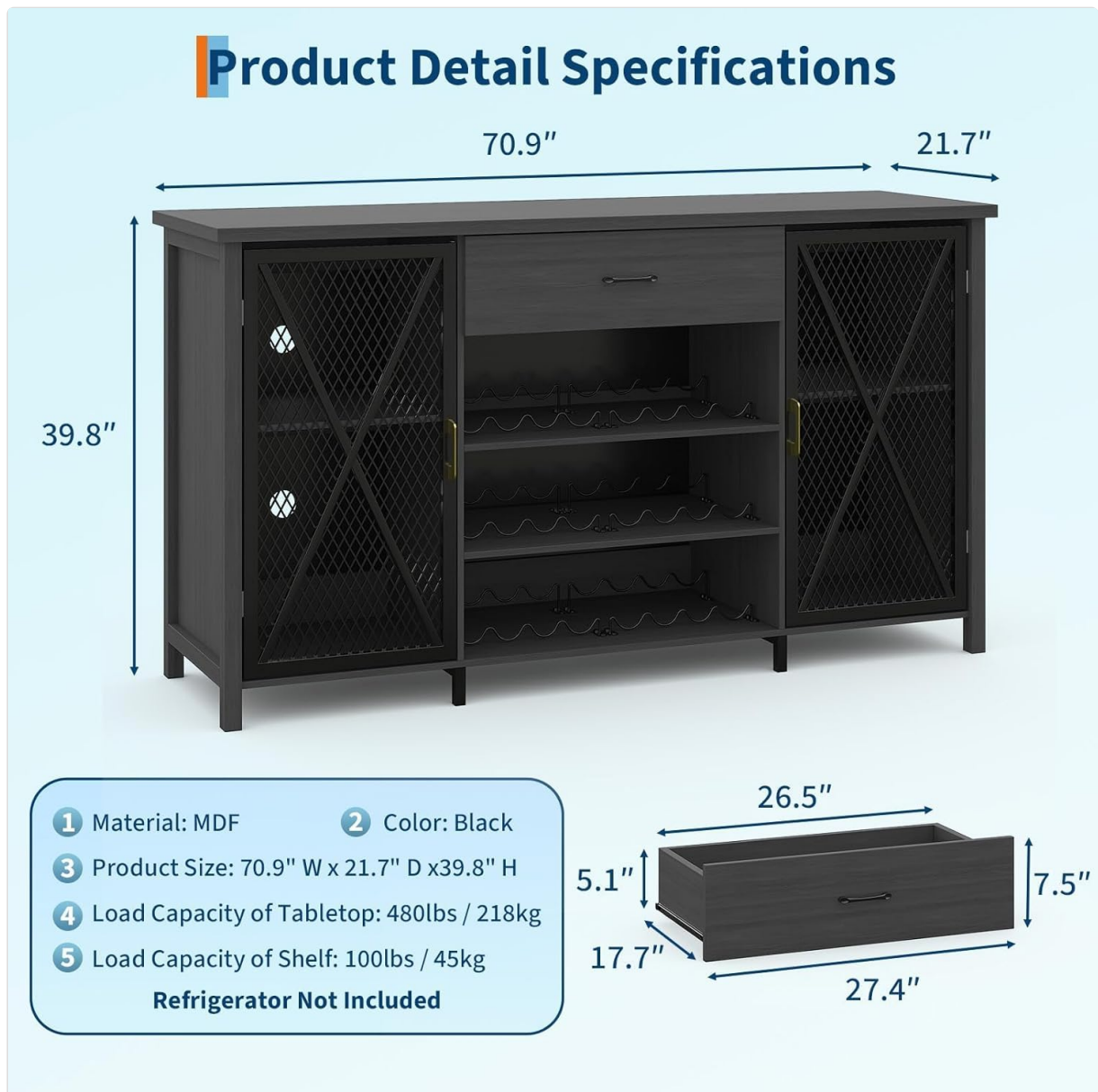
Figure 4: View of the spacious tabletop and practical storage drawers.

hinges to the iron mesh doors and then to the cabinet frame. Adjust hinges for proper door alignment.