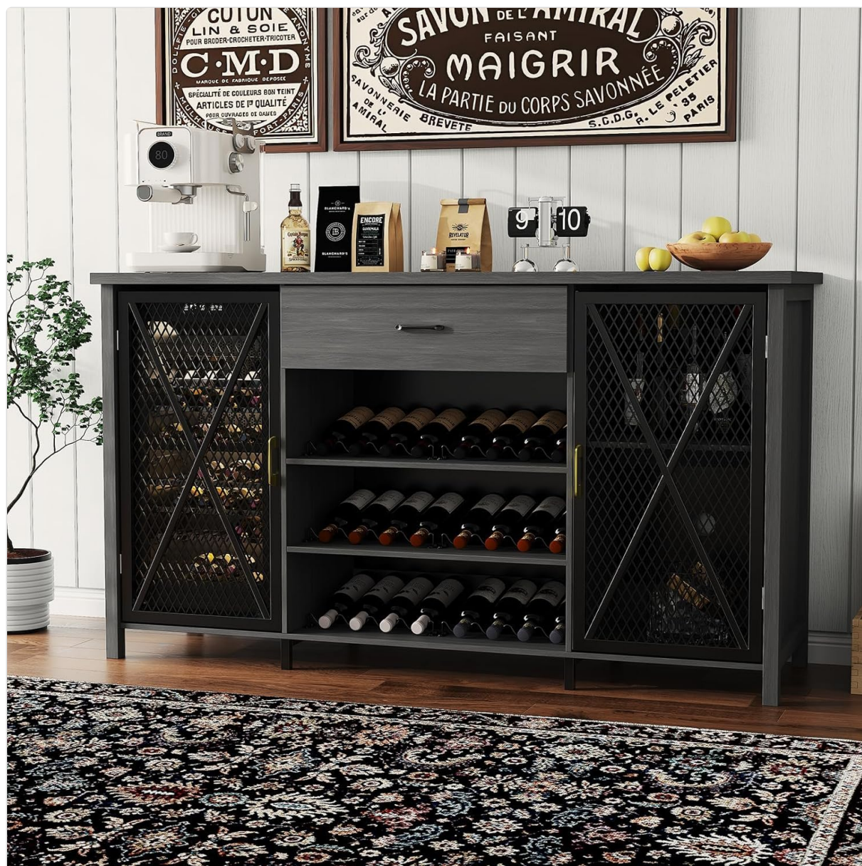
Figure 5: Cabinet showcasing the dedicated space for a wine cooler.