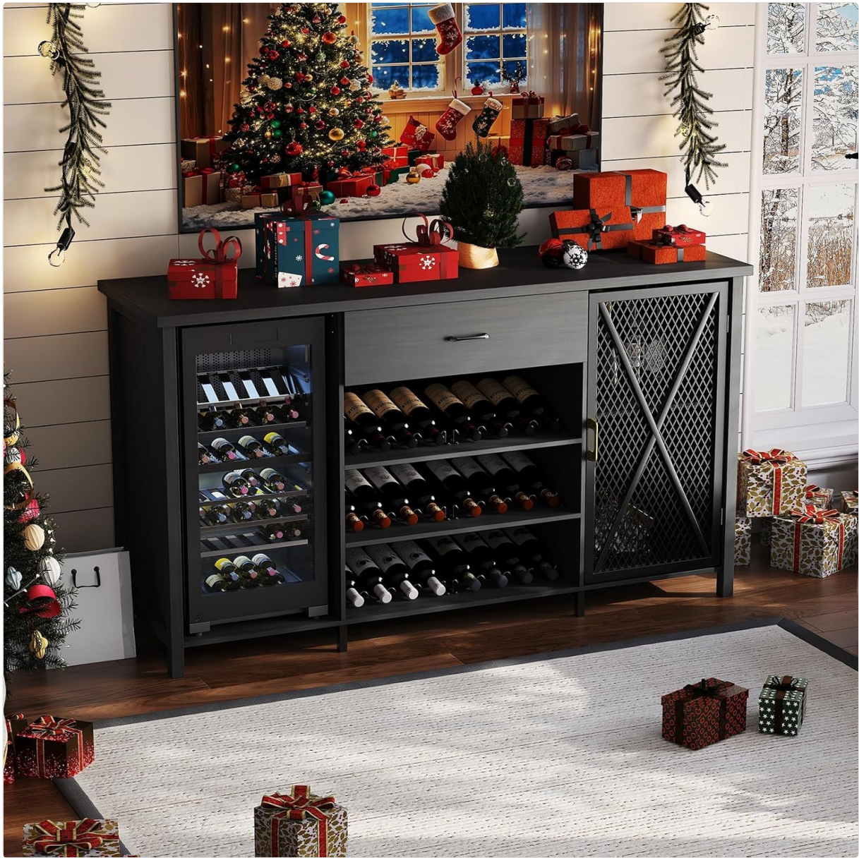
Figure 1: Overall view of the 71" Industrial Wine Bar Cabinet.