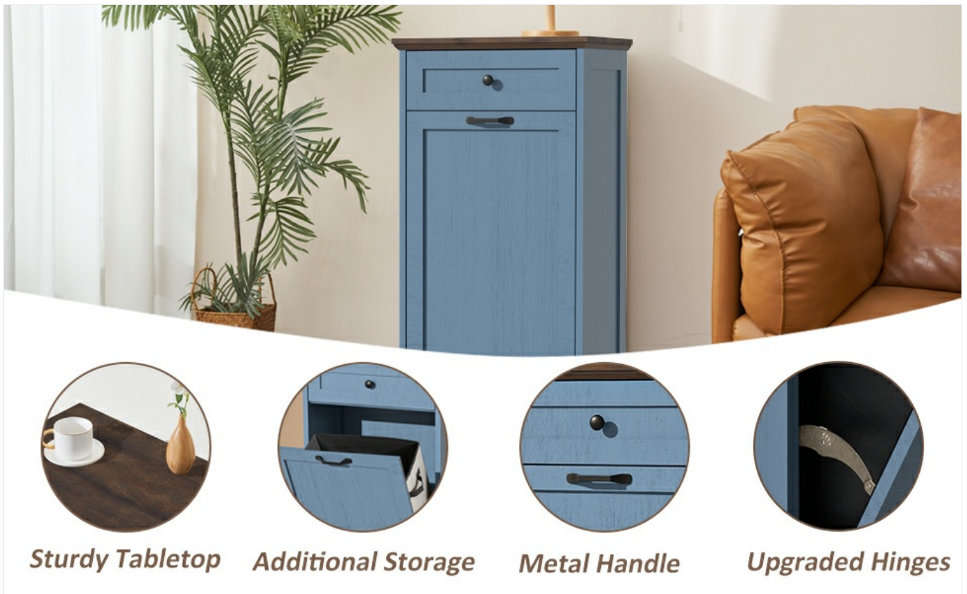
Image: The OUTGUAVA Tilt Out Trash Cabinet demonstrating its applicability in different scenarios, including avoiding odors, storing dirty laundry, and being pet-proof, showcasing its versatile design.