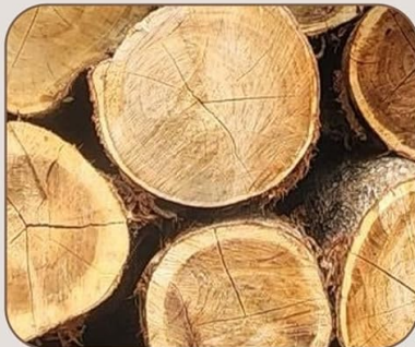
Natural Rubber Wood Frame