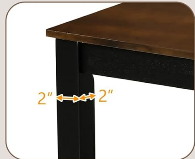
Thickened Supporting Legs

Image: Stable and Reliable Construction. This image highlights key structural features such as the natural rubber wood frame, stable triangular connections, and thickened legs, which contribute to the set's durability.