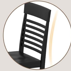
Curved Ladder Backrest