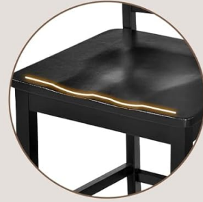
Ergonomic Contoured Seat