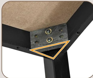
Stable Triangular Structure