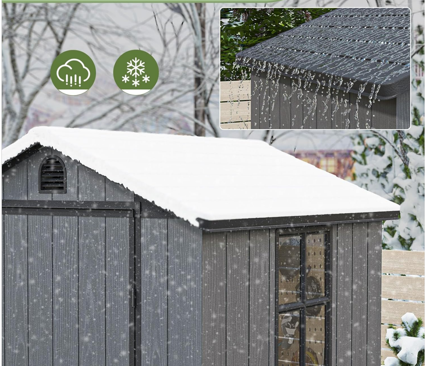
Figure 4.4: The shed's roof design provides all-weather protection.