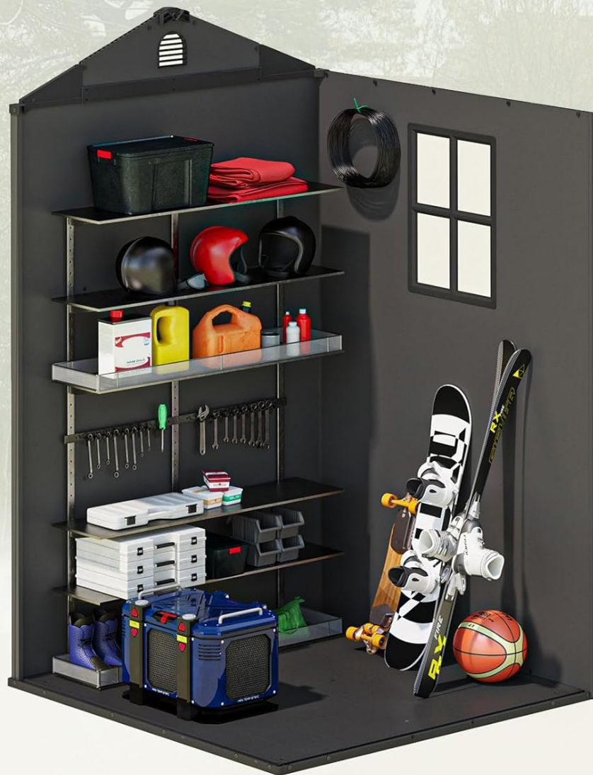
Figure 5.2: Example of interior storage, showcasing the shed's capacity for various tools.