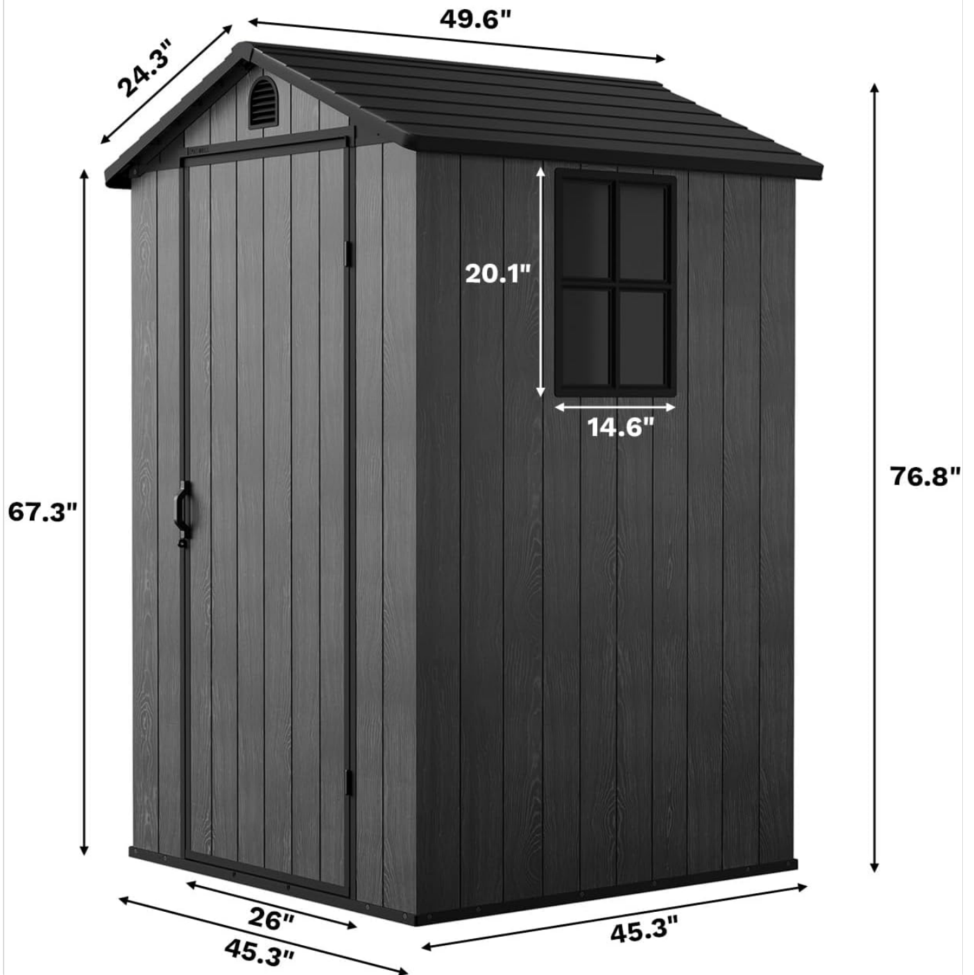
Figure 4.2: Overview of the shed's structure and dimensions during assembly.