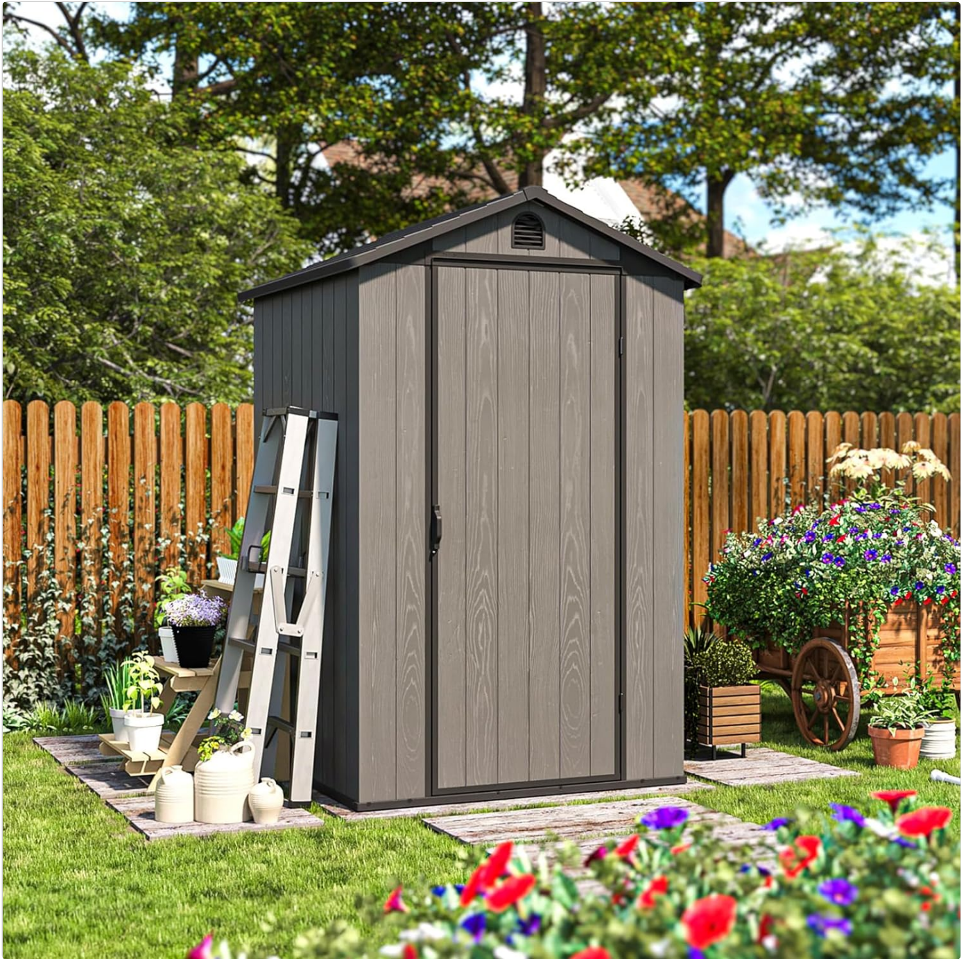
Figure 5.1: The Patiowell shed with its door closed, ready for use.