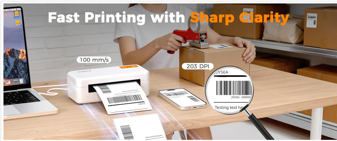
Image: The Joysea E41 Pro printer delivers fast printing at 100mm/s with sharp clarity, thanks to its 203 DPI resolution, ensuring professional-looking labels.