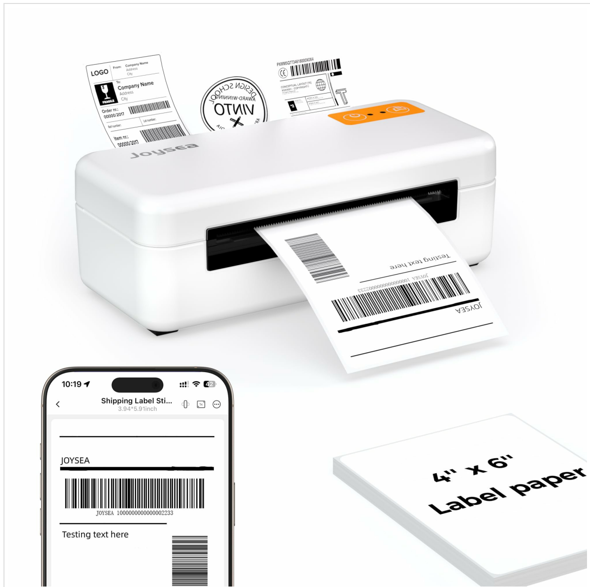
Image: Joysea E41 Pro Thermal Label Printer with its power and USB cables connected.

Familiarize yourself with the main components of your Joysea E41 Pro printer.