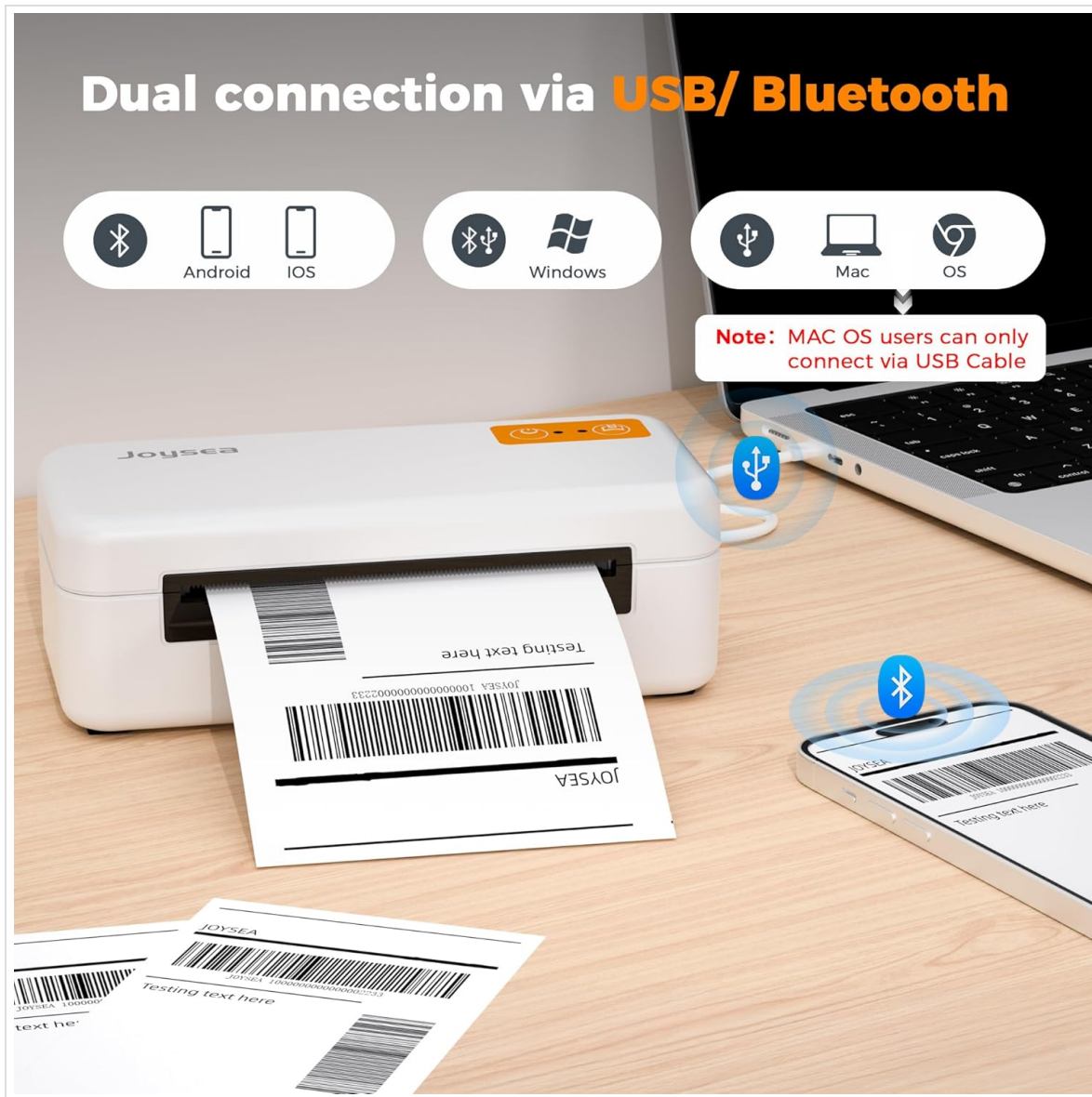
Image: The Joysea E41 Pro printer offers dual connectivity, allowing connection to Windows/Mac via USB and to iOS/Android devices via Bluetooth. Note: Mac OS users can only connect via USB cable.