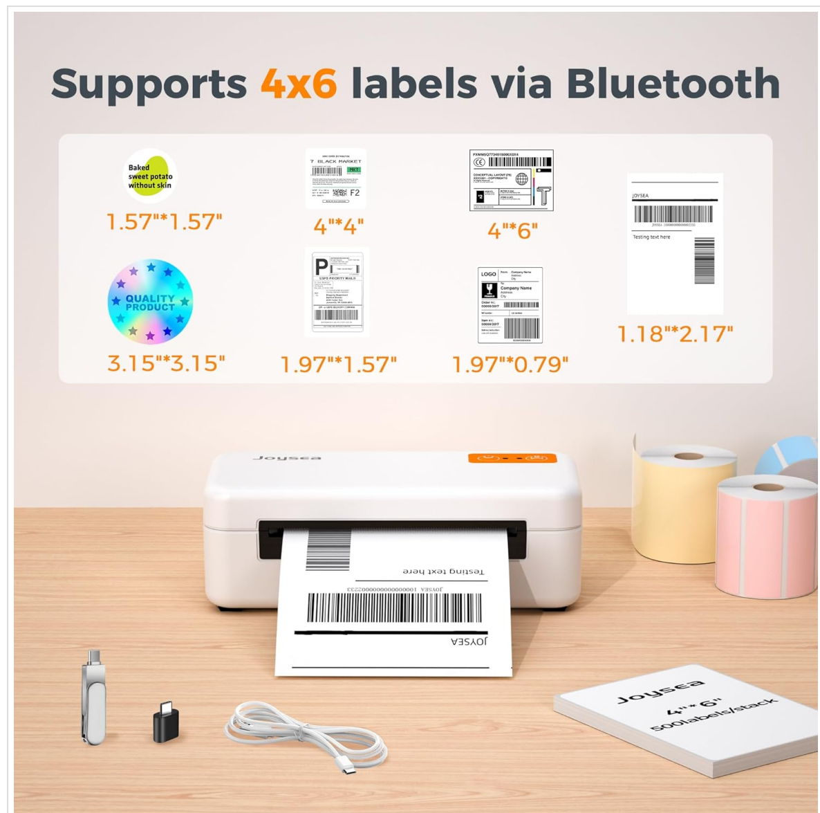
Image: The Joysea E41 Pro printer supports various label sizes, including standard 4x6 inch shipping