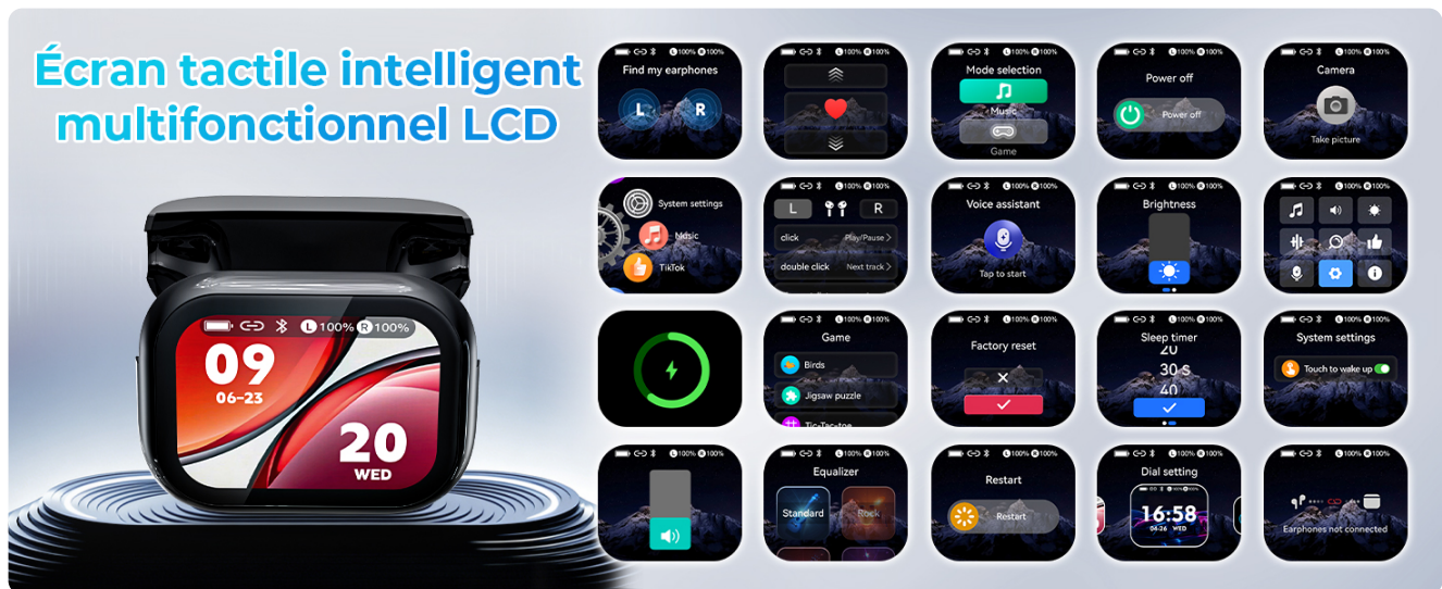
Image: The NE68 AI Translation Earbuds highlighting their 9 practical functions, including various translation modes, call features, and AI dialogue.

The Relxhome NE68 Instant Translator Earbuds are advanced AI-powered devices designed to facilitate seamless communication across language barriers. These earbuds offer real-time, two-way translation in up to 134 languages and accents, with high accuracy and minimal latency. Equipped with a color LCD touch screen and Bluetooth 6.0, they integrate translation, clear calls, and high-quality music playback into a single, ergonomic device. This manual provides detailed instructions for setup, operation, maintenance, and troubleshooting to ensure optimal use of your NE68 earbuds.