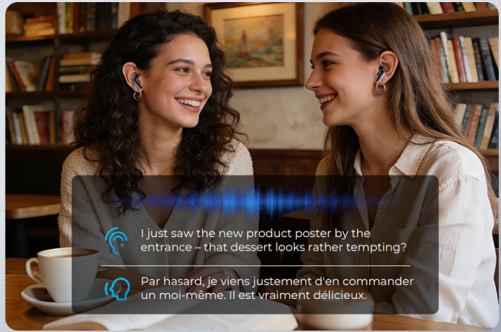
Image: Demonstrates different scenarios of AI real-time translation, including AI chat mode, general translation mode, phone+headset mode, and binaural mode, showing people interacting using the earbuds.

Ce mode nécessite que les deux parties portent chacune une oreillette. Après avoir sélectionné les langues correspondantes sur le téléphone portable, l'une ou l'autre des parties peut appuyer sur son oreillette pour lancer la traduction de la conversation.