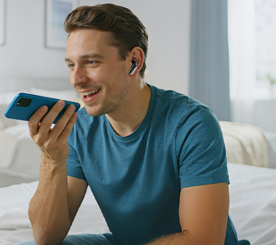
Image: A user relaxing and controlling TikTok videos remotely with the NE68 earbuds, demonstrating hands-free operation for a comfortable viewing experience.