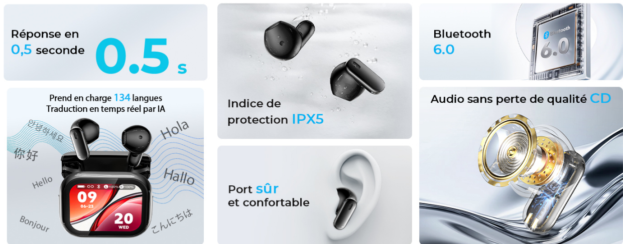
Image: An illustration highlighting the 3-in-1 functionality of the NE68 earbuds, combining music playback, phone calls, and translation capabilities.