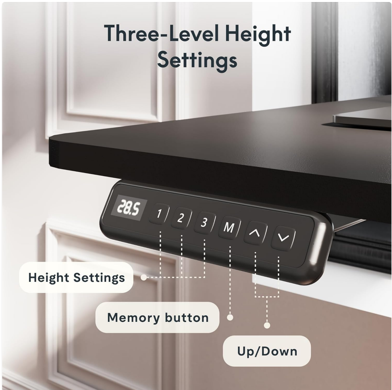
Image: A close-up of the control panel for height adjustment and memory presets.