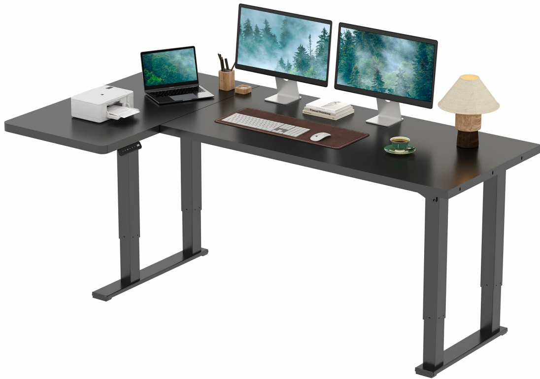
Image: The SANODESK 4-Leg L-Shaped Electric Standing Desk in a black finish, set up in a modern home office with multiple screens.