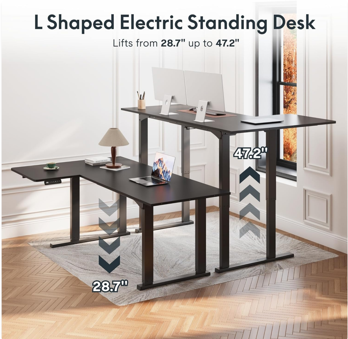
Image: The L-shaped electric standing desk demonstrating its height adjustment range.