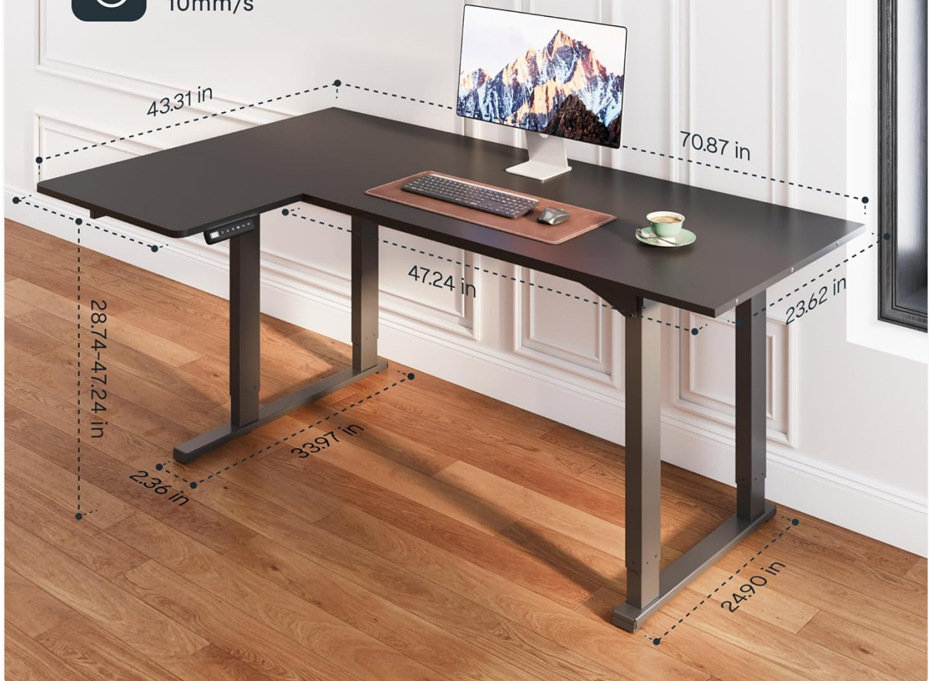
Image: Detailed desk dimensions for planning your space.