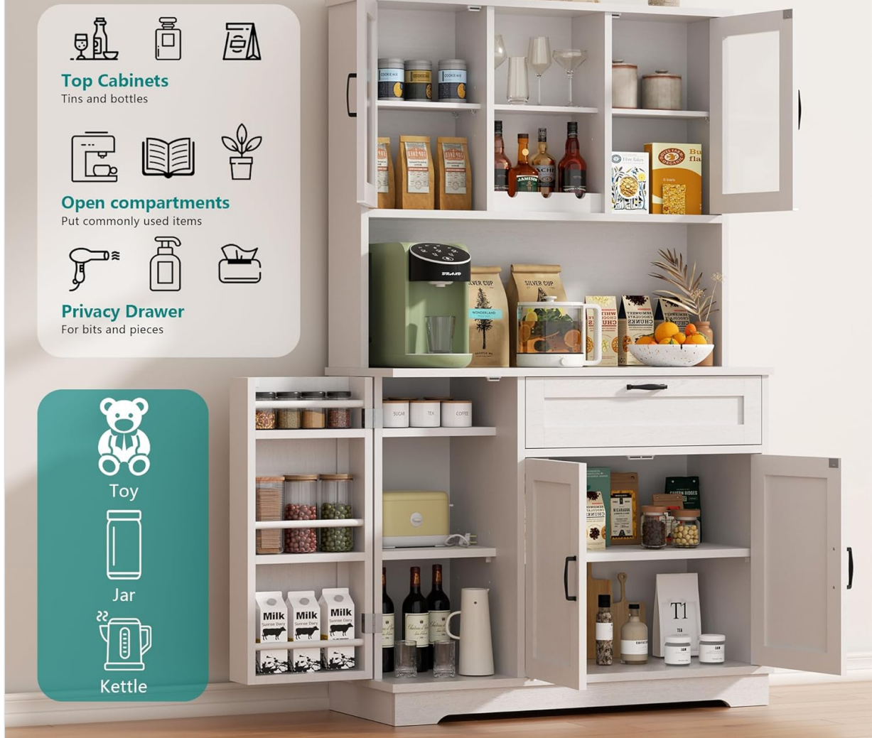
Figure 5: Visual representation of the cabinet's ample storage space, including top cabinets for tins and bottles, open compartments for commonly used items, and a privacy drawer for bits and pieces.

suitable for dining room, living room, kitchen.