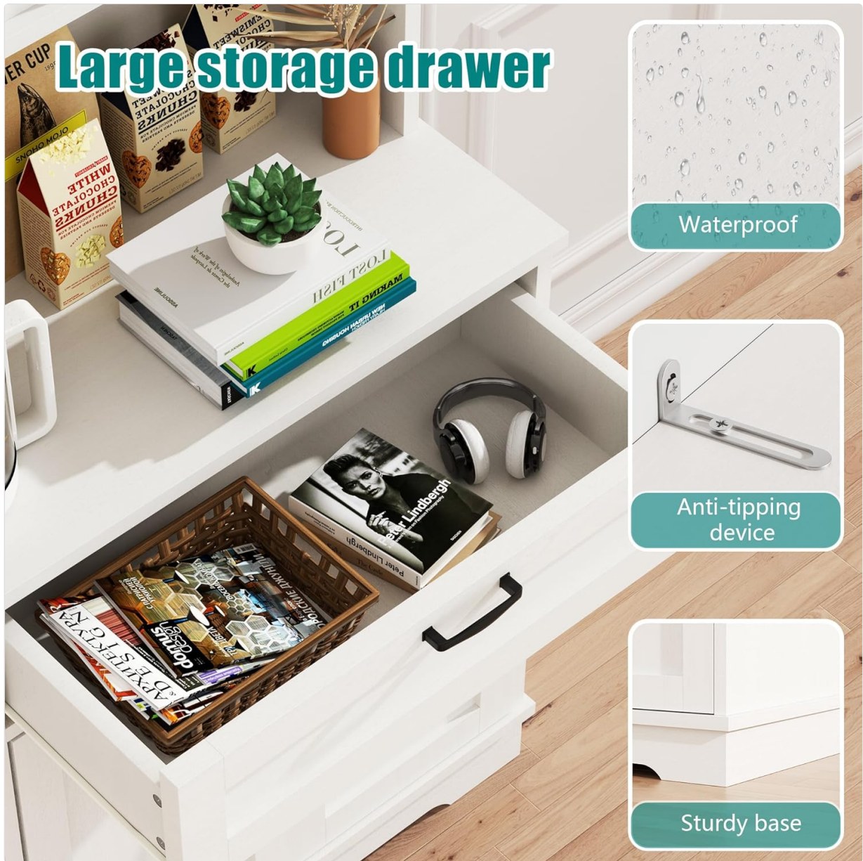
Figure 2: Details of the large storage drawer, featuring a waterproof surface, the anti-tipping device for wall attachment, and the sturdy base design.