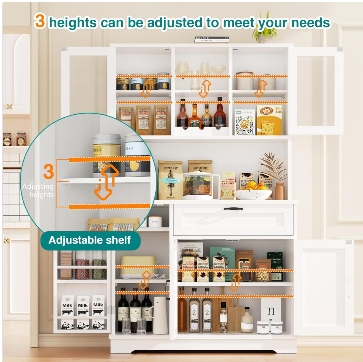
Figure 3: Illustration of the adjustable shelf feature, showing three possible height settings to accommodate various item sizes.