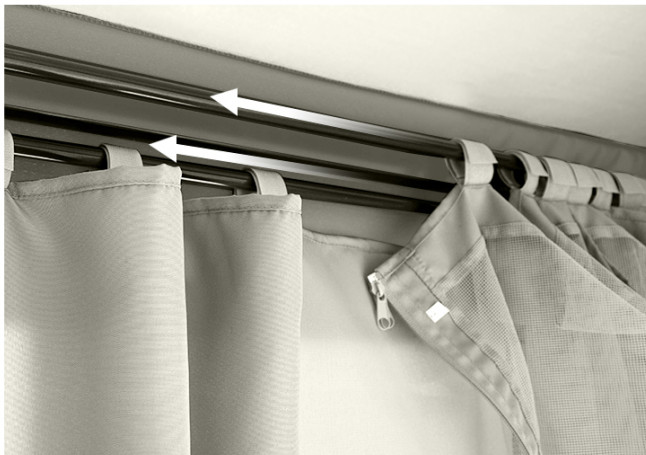
Image: A close-up view of the gazebo's vented double roof, highlighting the mesh layer that promotes airflow and helps repel mosquitoes.

Added nettings between the roofs for circulating air and repelling mosquitoes