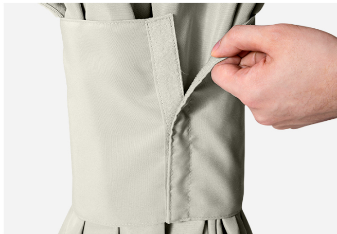
Image: Detail of the Velcro straps used to neatly organize and secure the gazebo's curtains when pulled back.