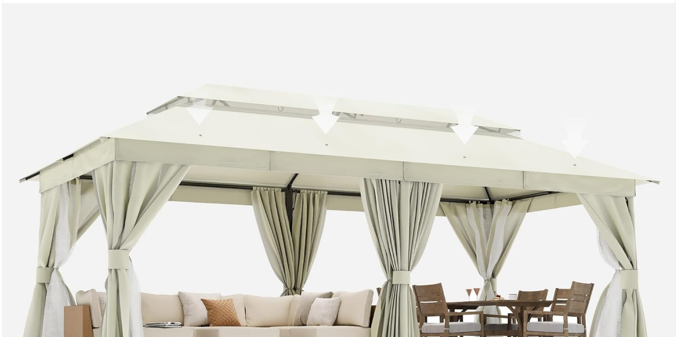
Image: Detail of the water leakage holes on the canopy, designed to prevent water accumulation and increase structural stability.