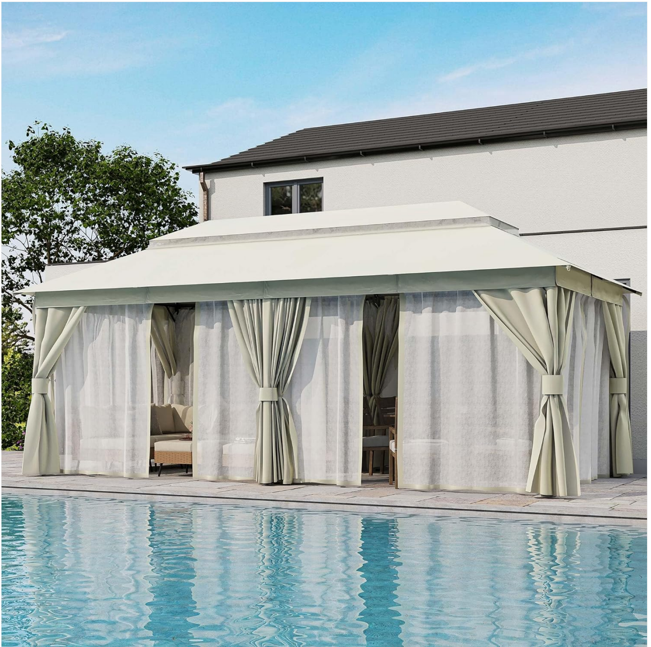
Image: The gazebo with its privacy curtains fully closed, offering a secluded and shaded area next to a pool.