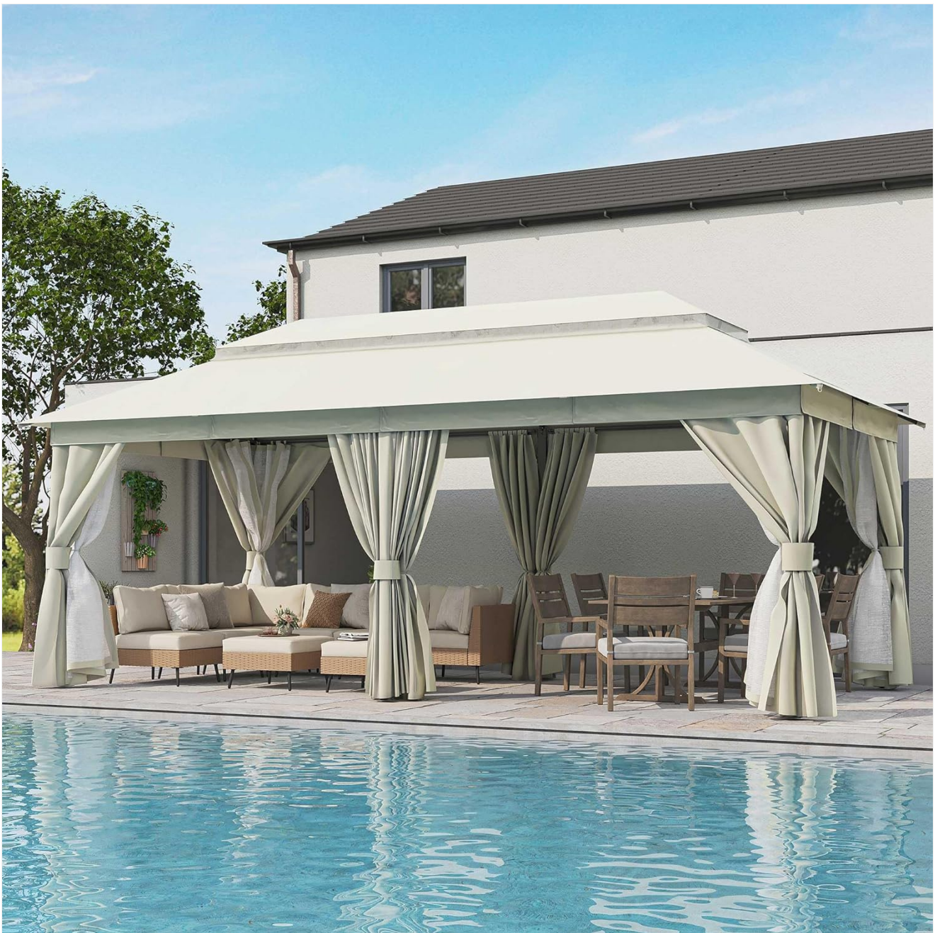
Image: The LAUSAIN HOME 10'x20' Outdoor Patio Gazebo with its curtains open, providing a shaded area next to a swimming pool.