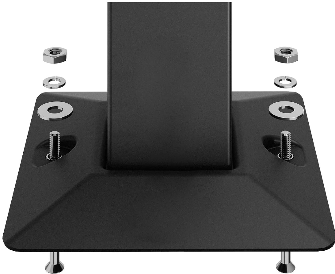
Image: A close-up view of the gazebo's base plate, showing the included expansion bolts, stakes, and ropes for secure installation.

12pcs expansion bolts, 12pcs stakes, 4pcs ropes