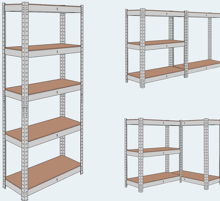
Image: Illustration of the modular assembly options, including a single tall unit, two shorter units, and a corner configuration.