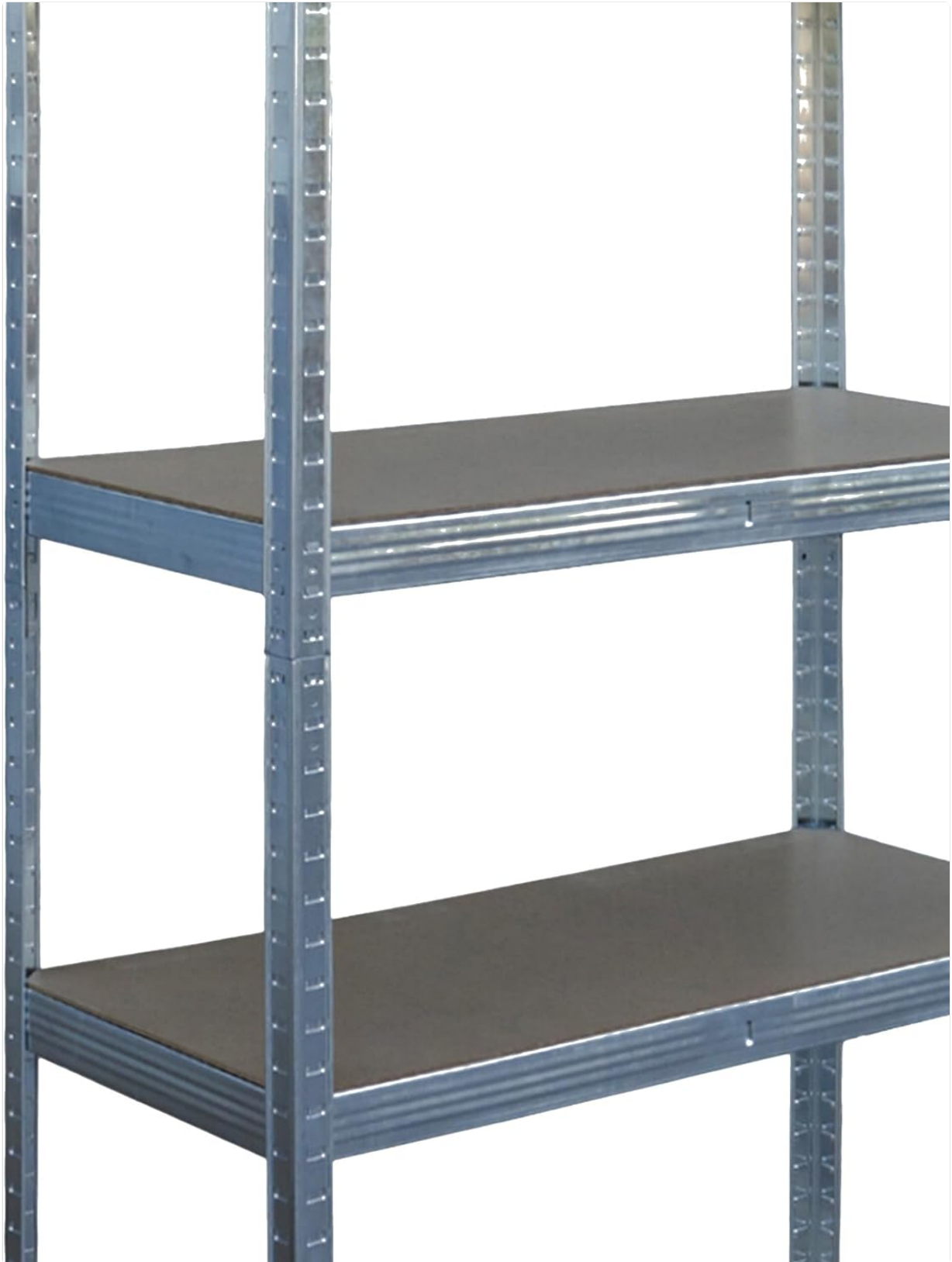
Image: Close-up view of the interlocking steel frame and an MDF shelf, illustrating the robust construction.