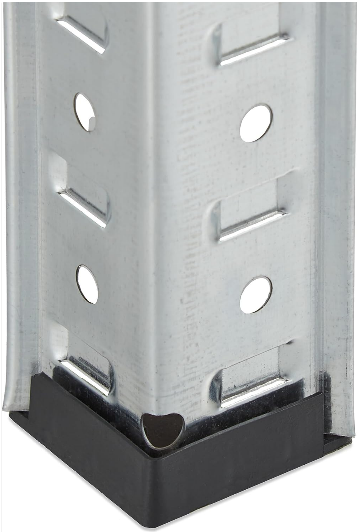
Image: Detail of the plastic foot protector, designed to prevent floor scratching and enhance stability.