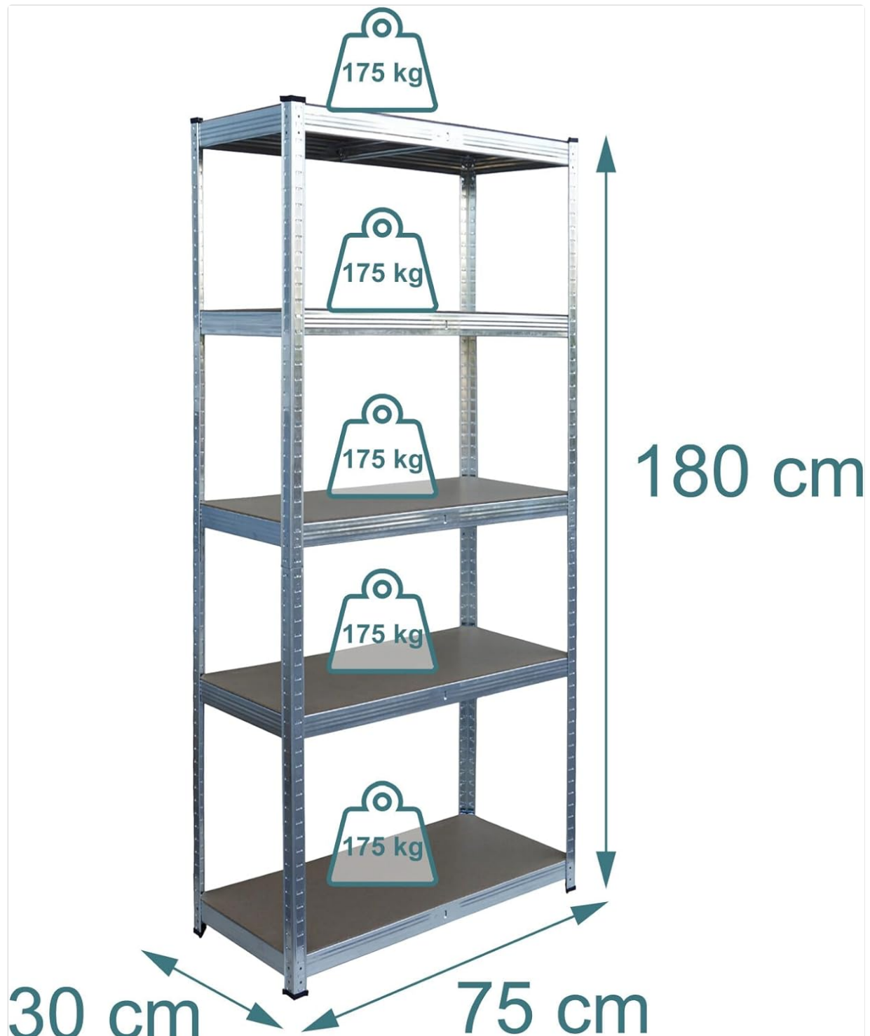
Image: Visual representation of the shelf's dimensions (180 cm height, 75 cm width, 30 cm depth) and the maximum load capacity of 175 kg per shelf.