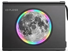
Scrolling light mode