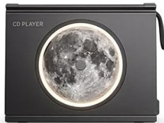
Breathing light mode