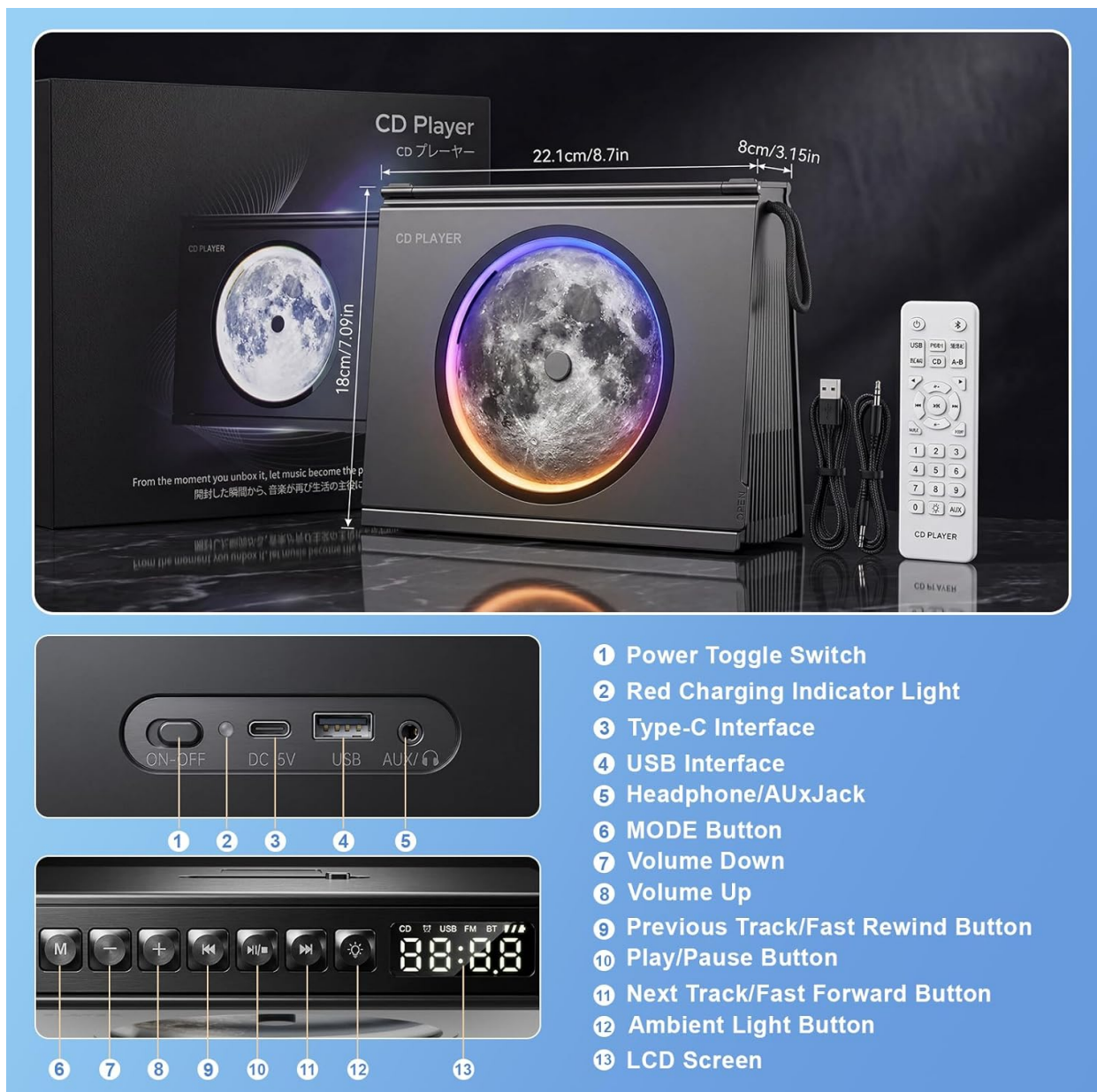
Figure 9: Controls and Ports