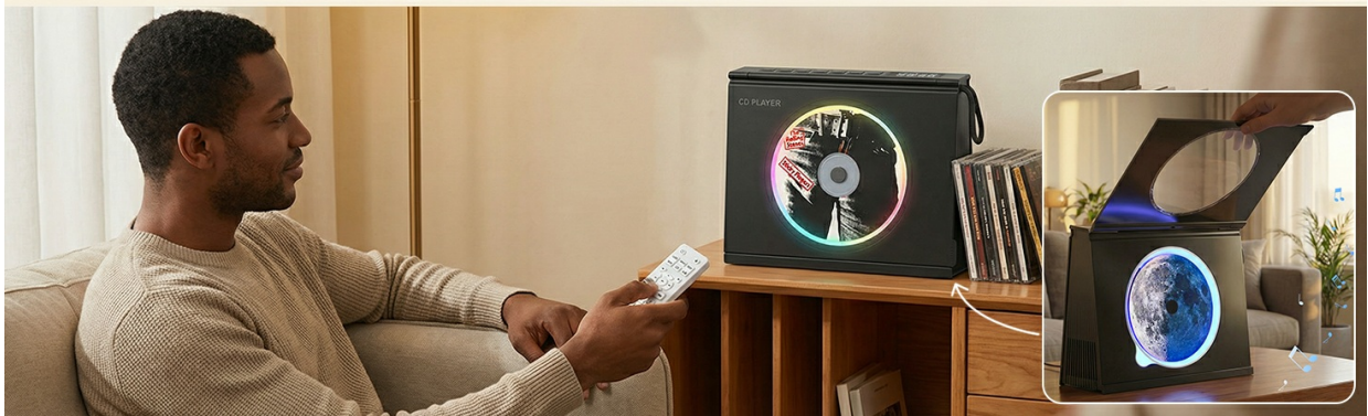
Figure 5: Bluetooth Receiving Function

Up to 3.5H Playback with Built-in Battery