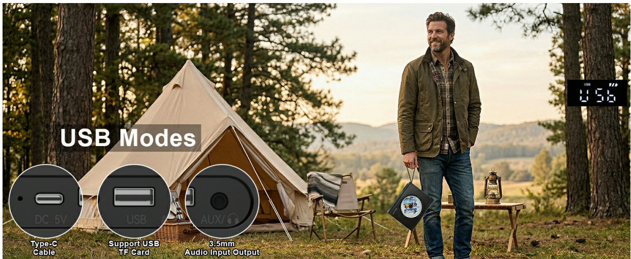
Figure 3: Supported Playback Modes

The Gueray Y-03 supports various audio playback modes including CD, Bluetooth (receiving and transmitting), FM radio, USB, and AUX. It is compatible with multiple audio formats such as CD, CD-R, CD-RM, MP3, and WMA, allowing you to enjoy your music effortlessly.