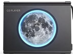
Constant light mode