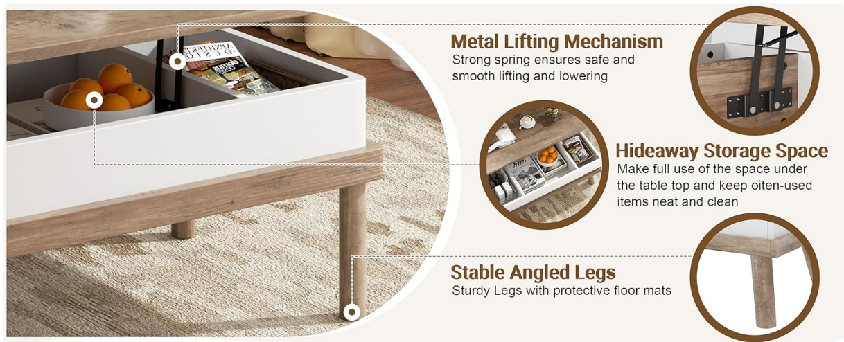
Figure 4.1: The lift-top mechanism allows for adjustable tabletop height.

To raise the tabletop, gently pull the front edge of the table upwards. The hydraulic lifter will assist in a smooth and quiet ascent. To lower, gently push the tabletop down until it rests in its original position. Ensure no objects are obstructing the mechanism during movement.