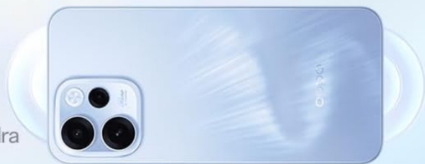
Image: Close-up of the OPPO Reno15 F 5G's rear camera module, highlighting the 50MP main, ultra-wide, and macro lenses.

Accelerazione del sistema di antenna di gioco AI Super potenziatore Wi-Fi AI Potenziatore di rete AI per combattimenti di squadra