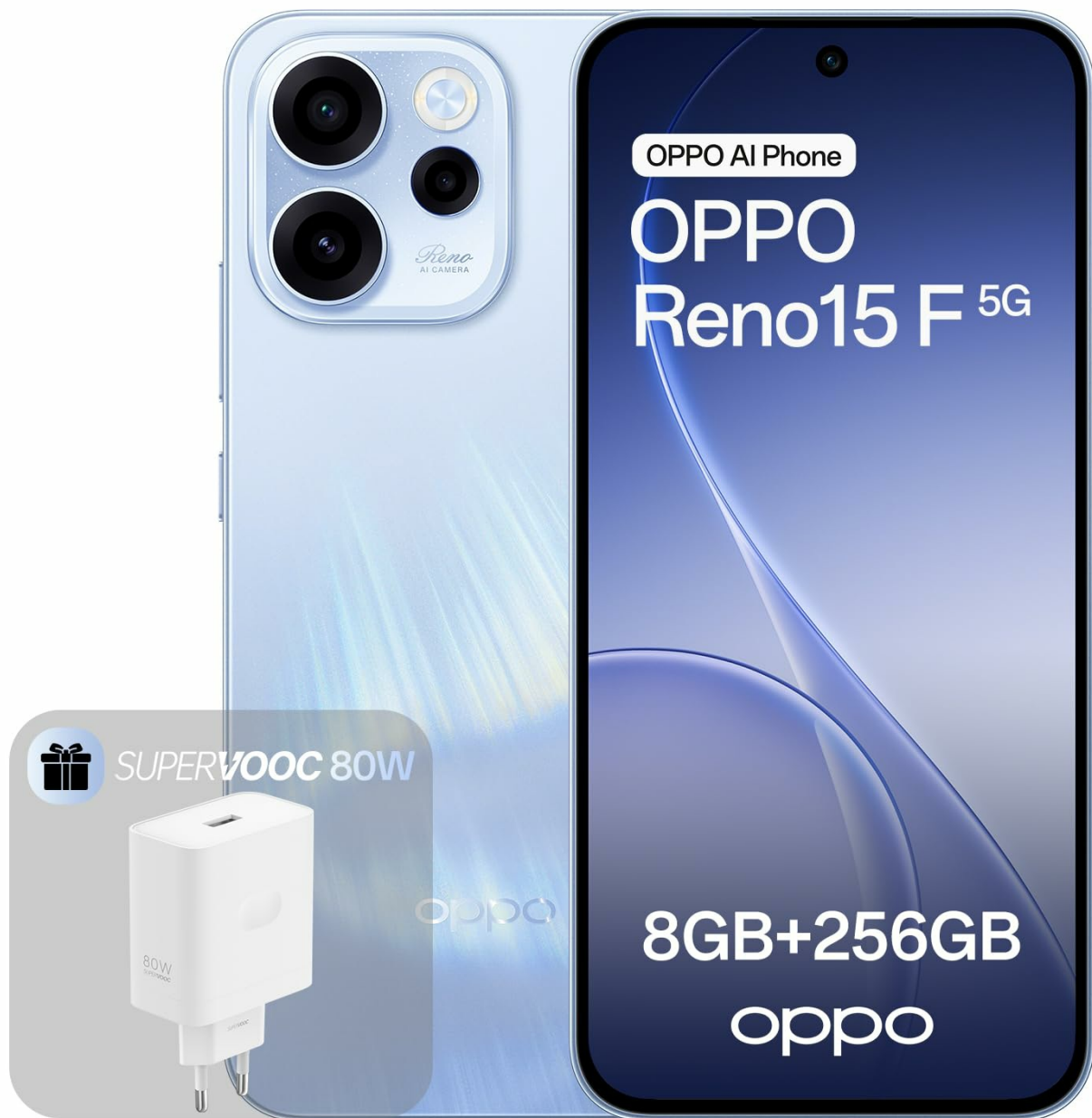
Image: OPPO Reno15 F 5G Smartphone in Aurora Blue.