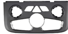
Automatic Ac conditioning panel