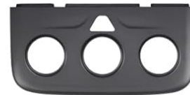
Manual Climate conditioning panel