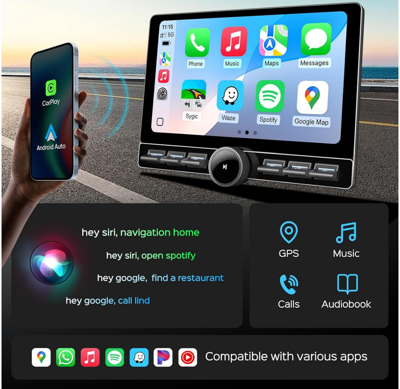
Figure 4: Wireless CarPlay and Android Auto functionality.