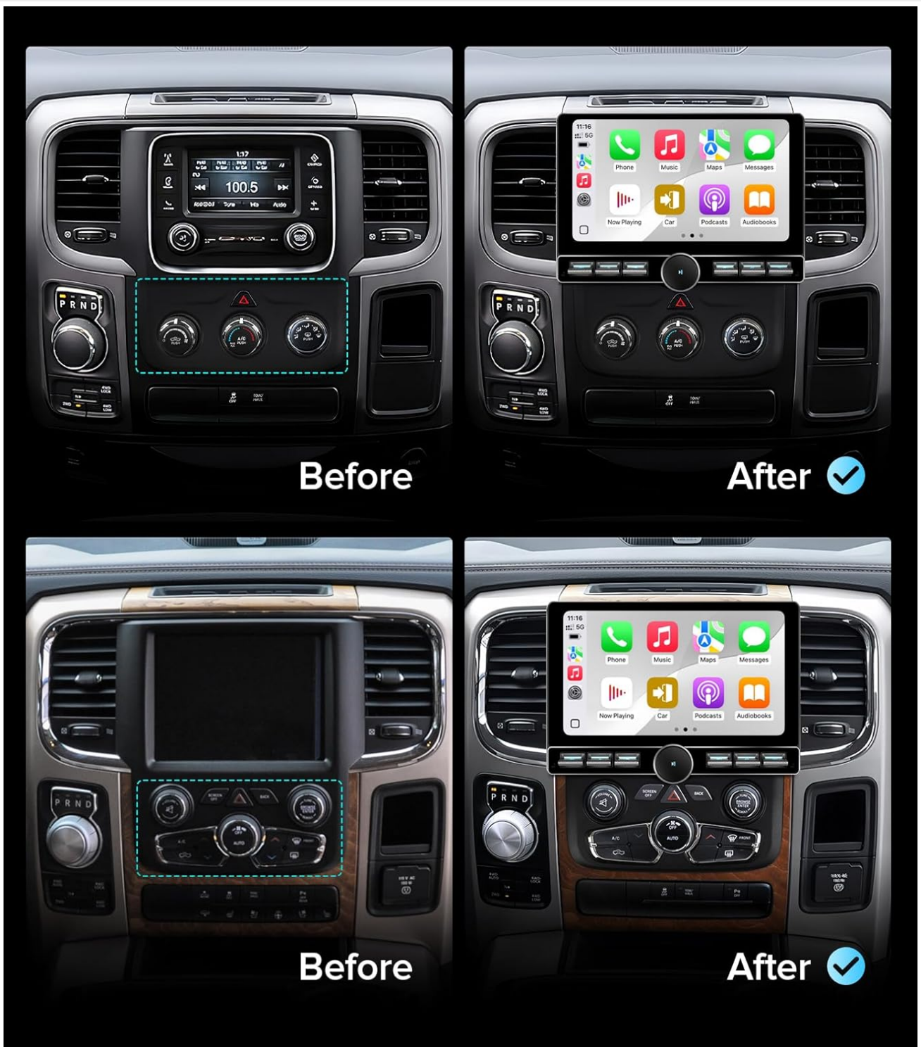
Figure 2: Before and after installation of the AINAVITO car stereo in a Dodge Ram dashboard.