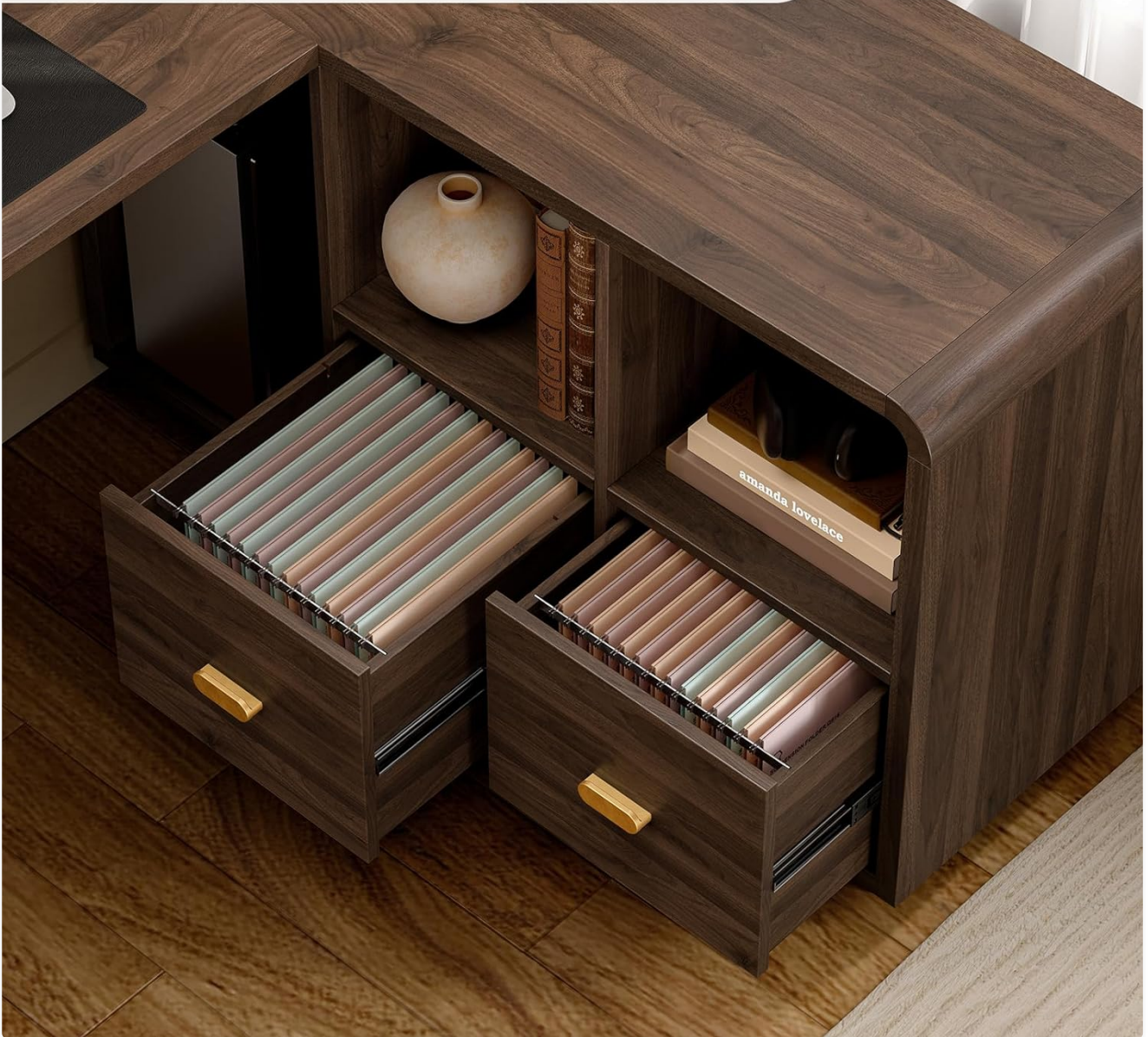
Image: Regular File Drawers