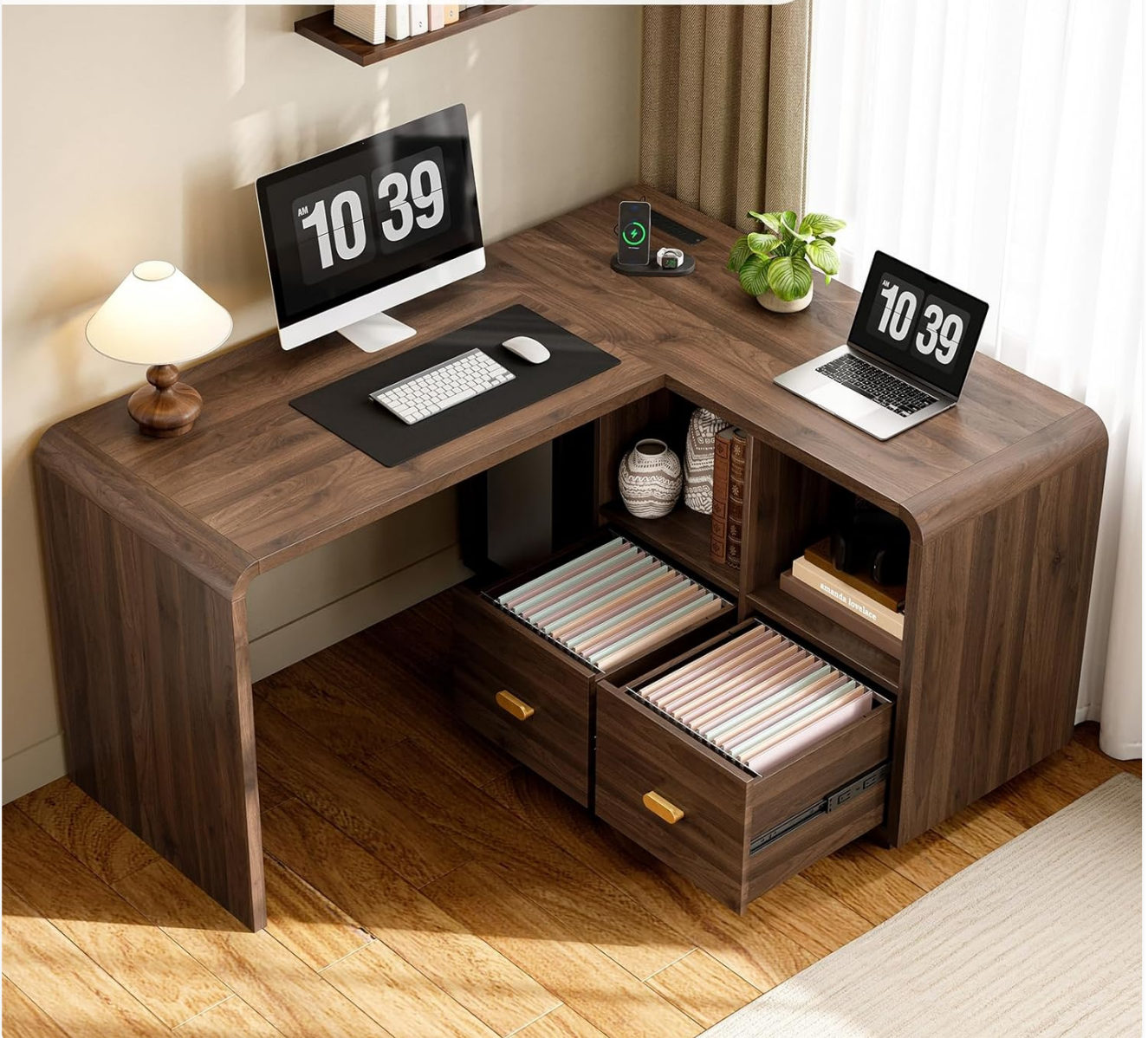
Image: Product Dimensions