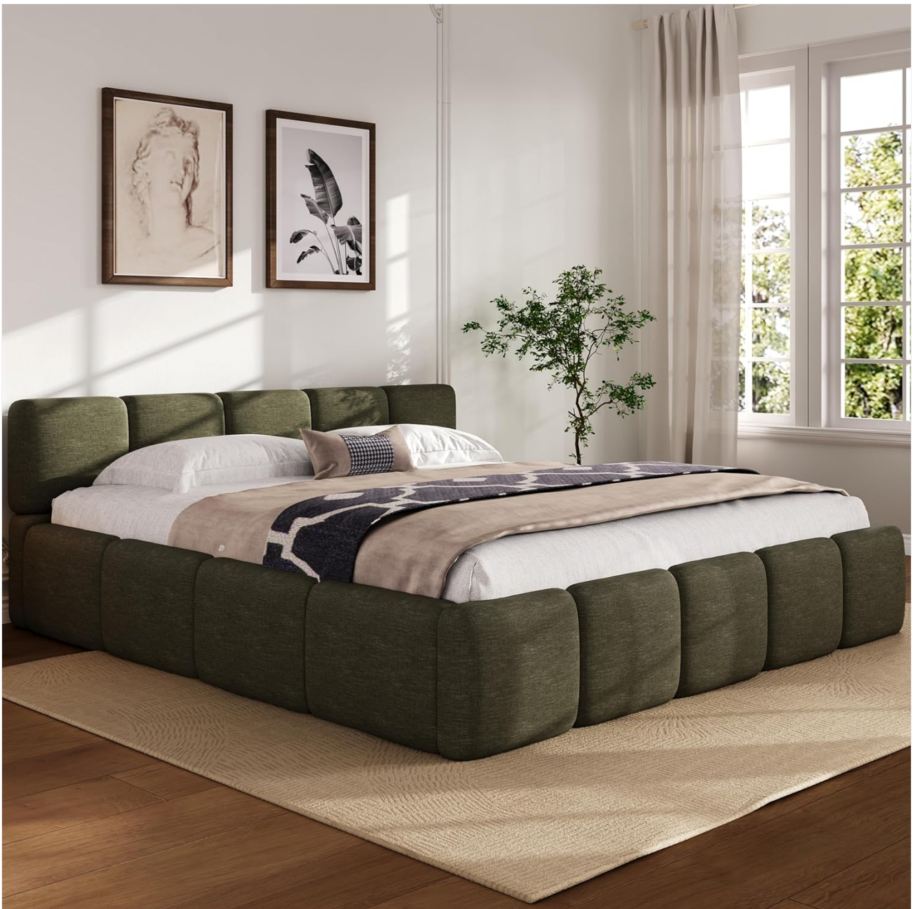
Image: The fully assembled Virubi King Size Upholstery Platform Bed, showcasing its block-style design and boucle fabric in a bedroom environment.