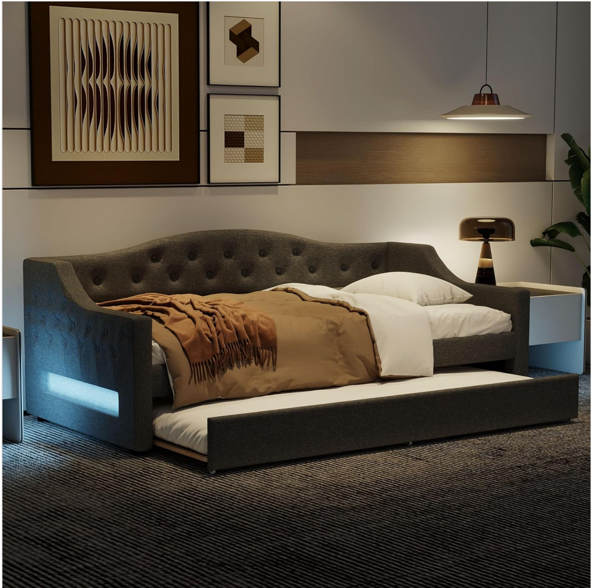
Image: The Bellemave daybed with its trundle bed fully extended, showing the additional sleeping surface and illuminated LED lights.