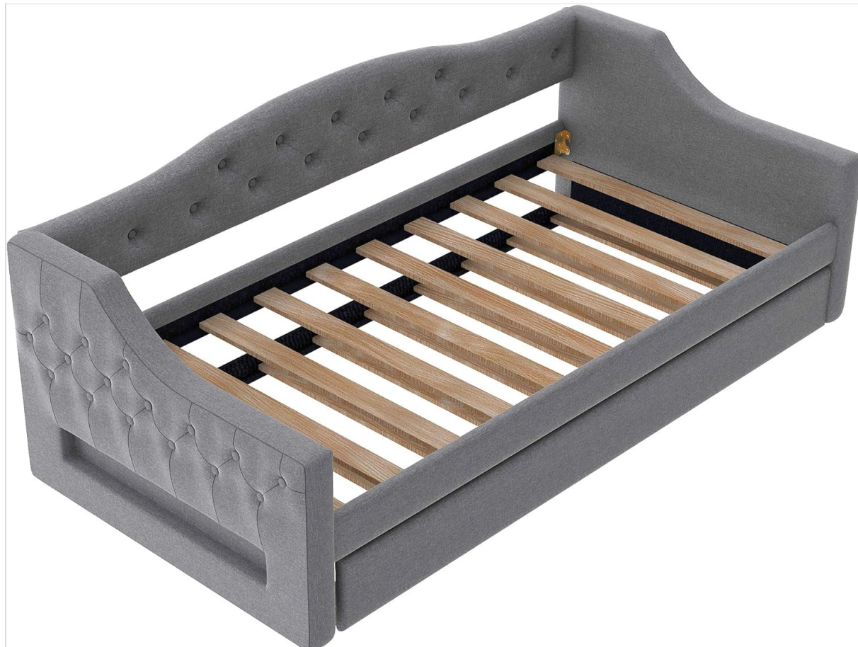
Image: View of the daybed frame with wooden slats properly installed, ready for a mattress.