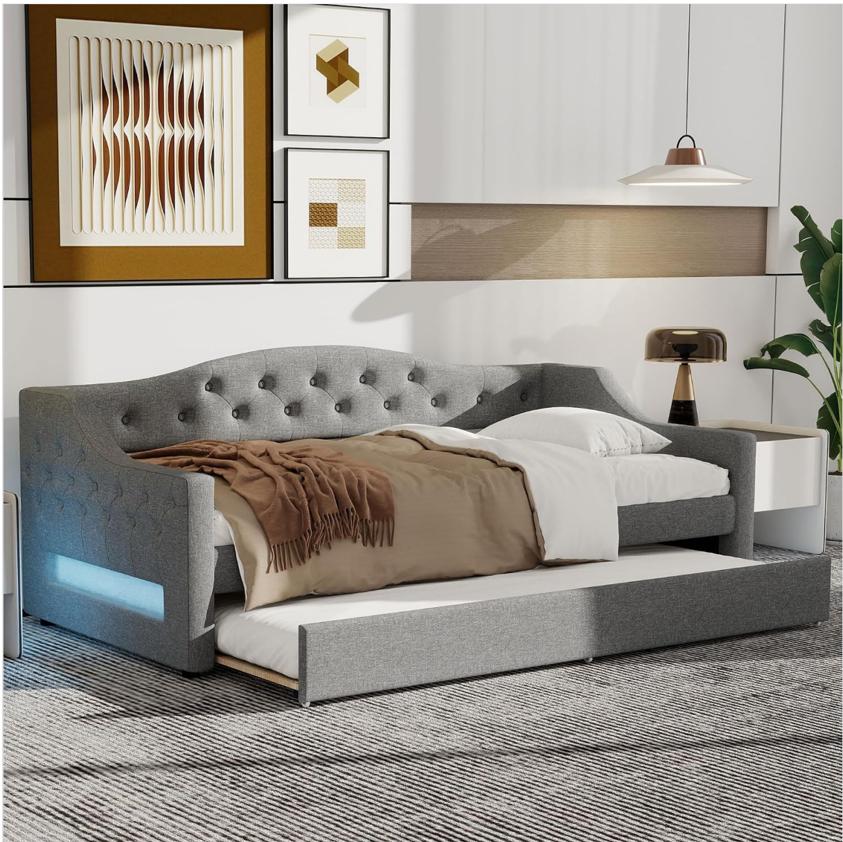
Image: The Bellemave daybed with the trundle bed neatly tucked away, showcasing the compact design and LED lighting.