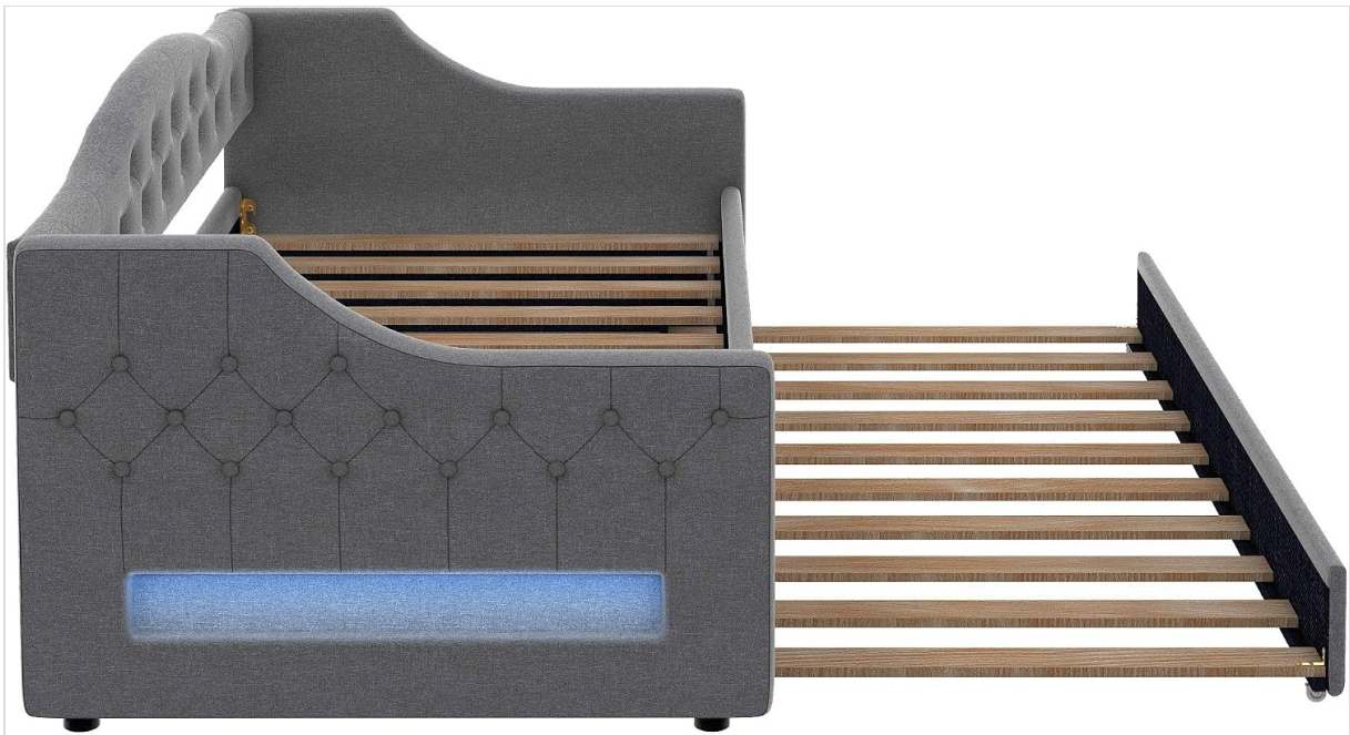
Image: A detailed view of the side panel of the daybed, highlighting the integrated LED light strip.