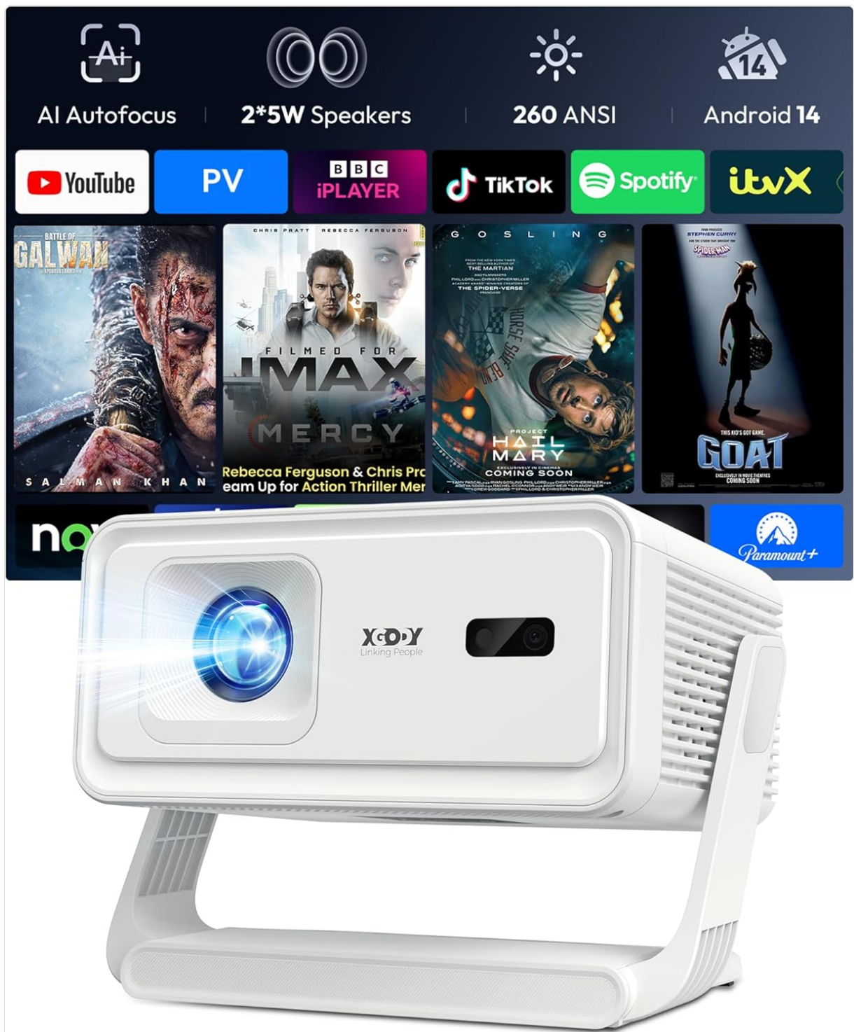
Image: Front view of the Xgody Gimbal A1 Projector, highlighting the projection lens and the autofocus sensor.