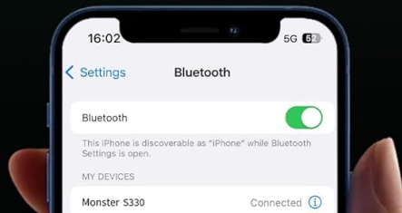
Image: Wired & Wireless Freedom. The speaker supports both USB-A/Type-C wired connections for devices like laptops and PCs, and Bluetooth 6.0 for wireless pairing with smartphones and tablets.