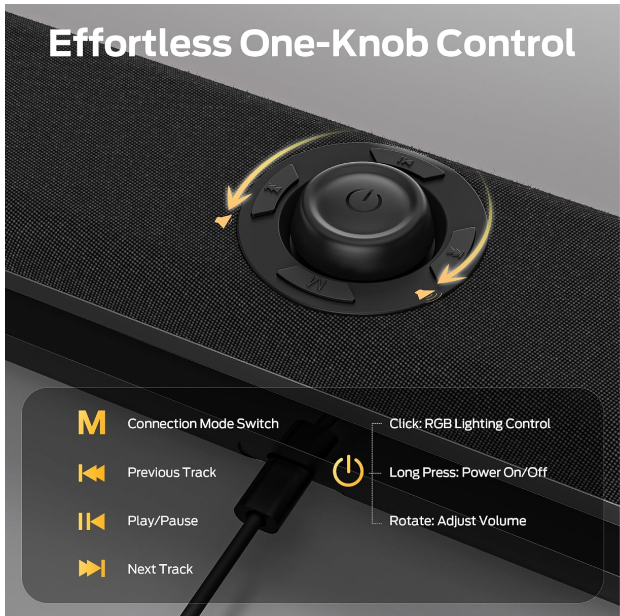
Image: Effortless One-Knob Control. The central knob allows for power on/off (long press), volume adjustment (rotate), and RGB lighting control (click). Additional buttons are for mode switching (M), previous track, play/pause, and next track.

The Monster S330 features an intuitive single-knob control for ease of use and versatile connectivity options.