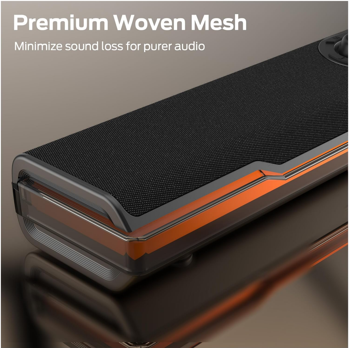
Image: Premium Woven Mesh. The speaker features a high sound transmittance woven mesh designed to minimize sound loss and distortion, ensuring clear and detailed audio.