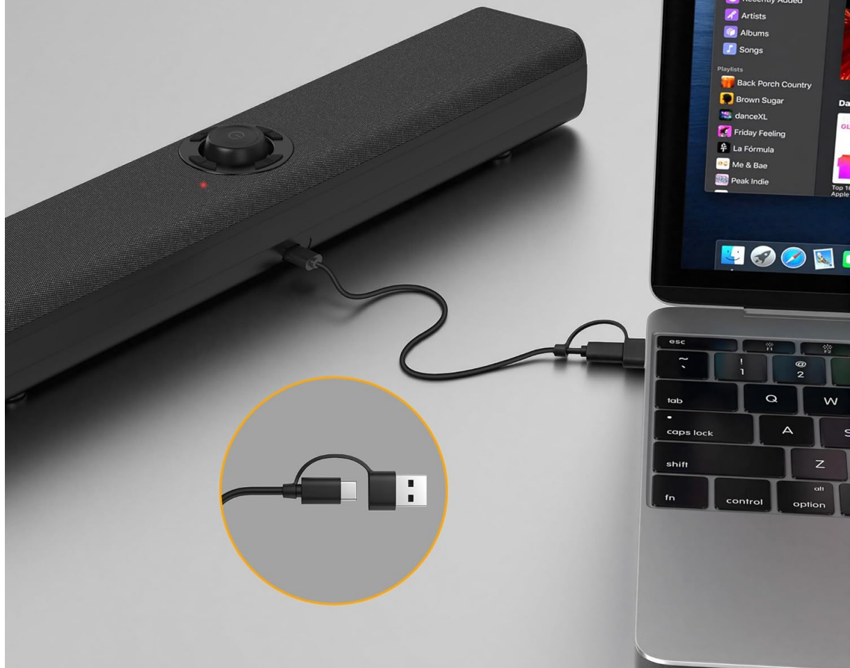
Image: Plug & Play. A single USB-A/Type-C cable provides both power and audio, allowing for instant, hassle-free setup with compatible devices.

Single Cable. Instant Sound. Hassle-Free Setup.