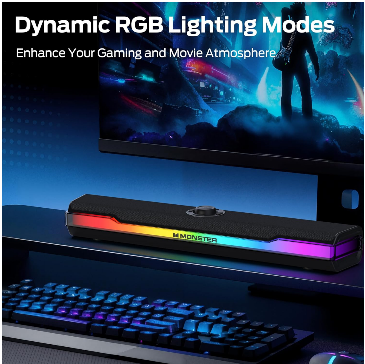
Image: Dynamic RGB Lighting Modes. The speaker features customizable RGB lighting to enhance your gaming and movie atmosphere.

Enhance Your Gaming and Movie Atmosphere