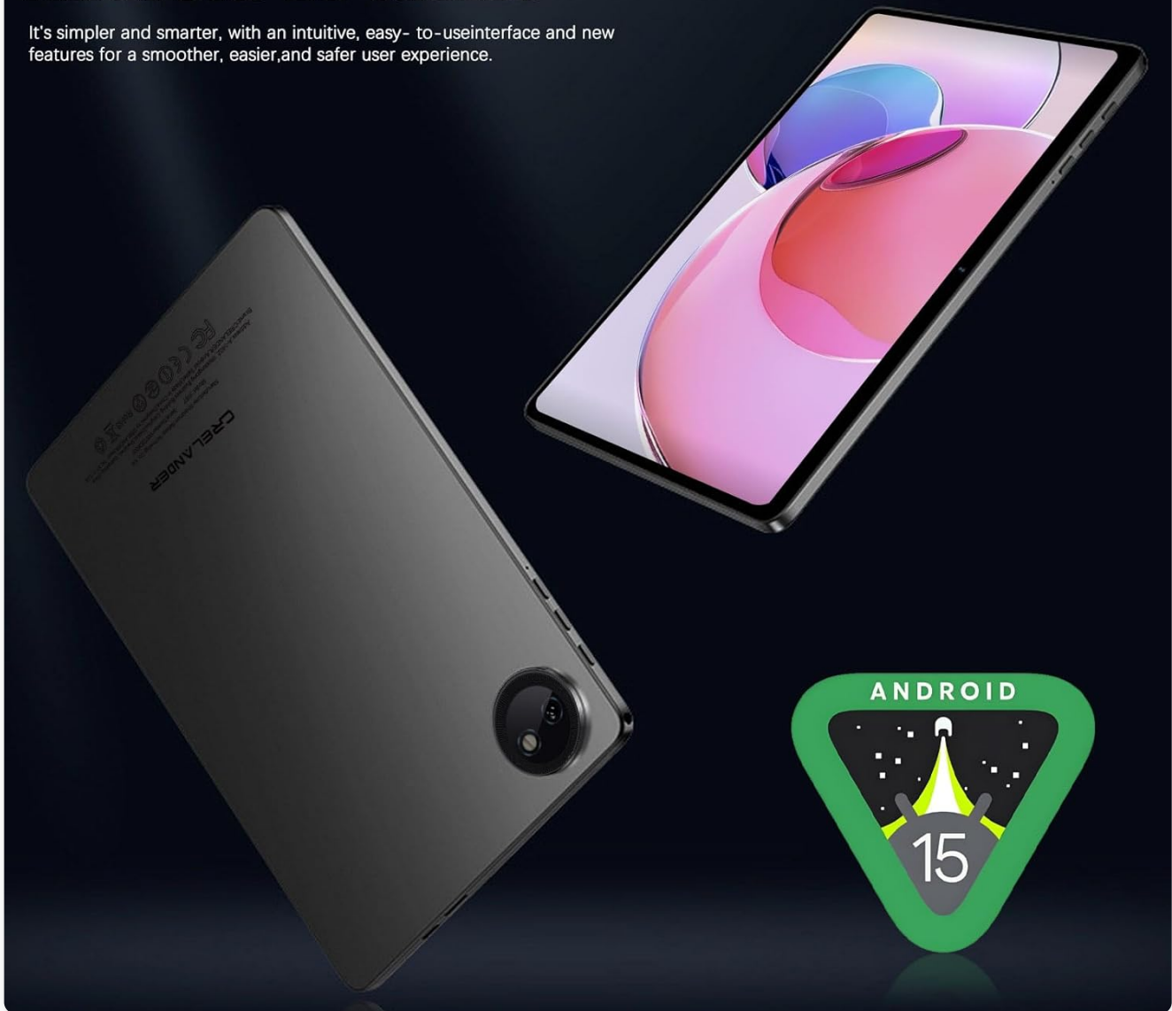
Figure 5.1: The tablet's home screen showing a variety of pre-installed and user-downloaded applications, demonstrating the Android 15 interface.

It's simpler and smarter, with an intuitive, easy-to-use interface and new features for a smoother, easier, and safer user experience.