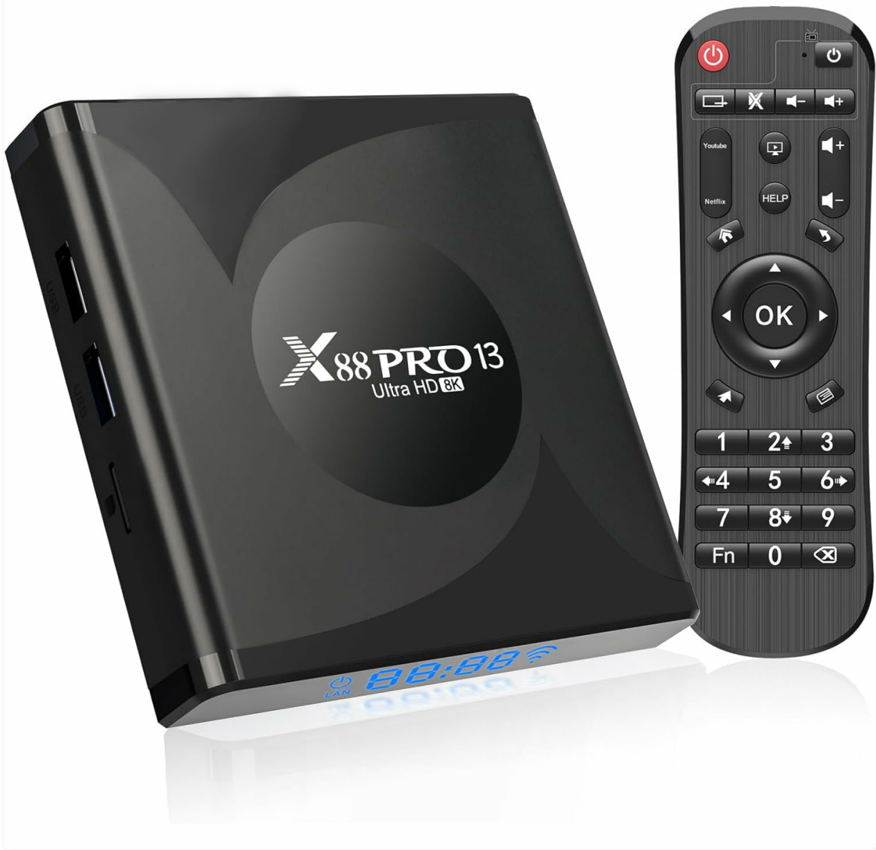
Image 1: The GREVA 8K Android TV Box 13.0, a compact streaming media player.