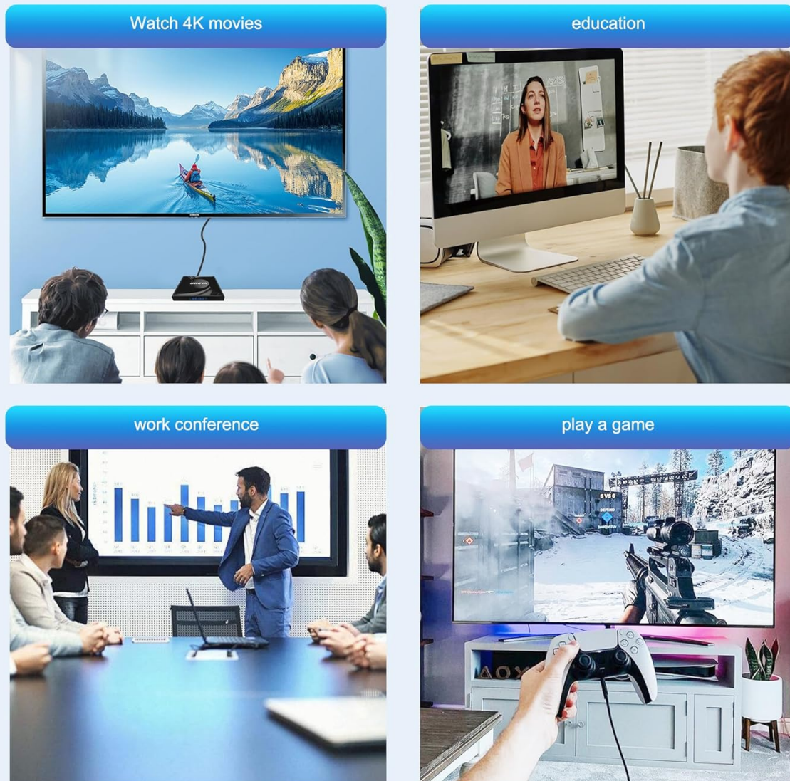
Image 4: Collage showing various applications of the GREVA TV Box, including watching 4K movies, educational content, work conferences, and gaming.

Your browser does not support the video tag.