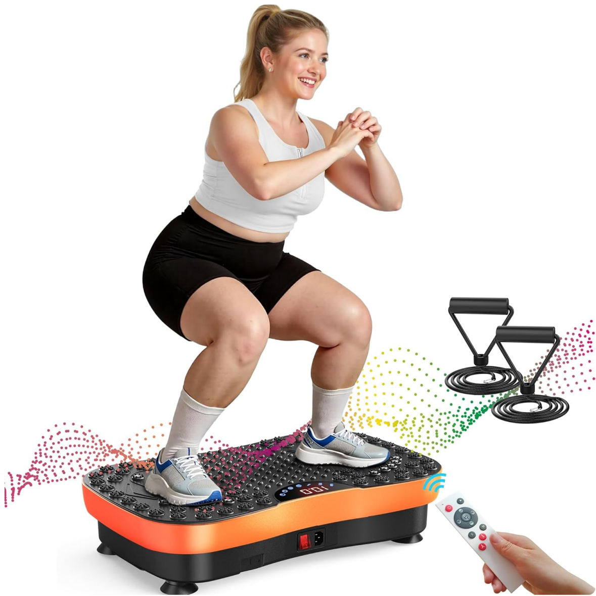
Figure 4.4: Squats on the vibration plate engage leg and core muscles, intensified by the vibrations and optional resistance bands.