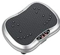
Figure 4.7: Bicep curls with resistance bands on the vibration plate provide an effective upper body workout.