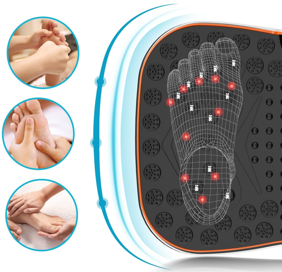
Figure 4.3: The integrated magnet health massage function targets specific points on the feet for enhanced well-being.