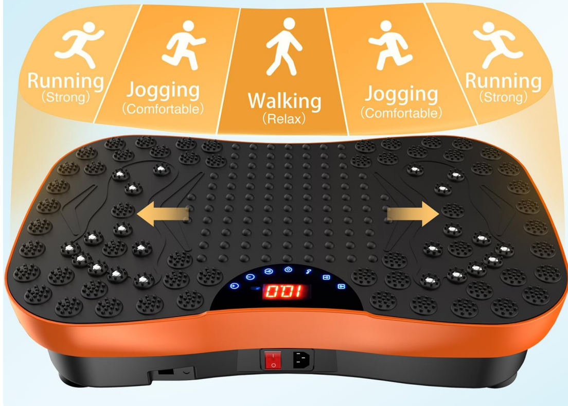
Figure 4.2: Foot placement on the vibration plate determines the intensity of the workout, ranging from a relaxing walk to an intense run.