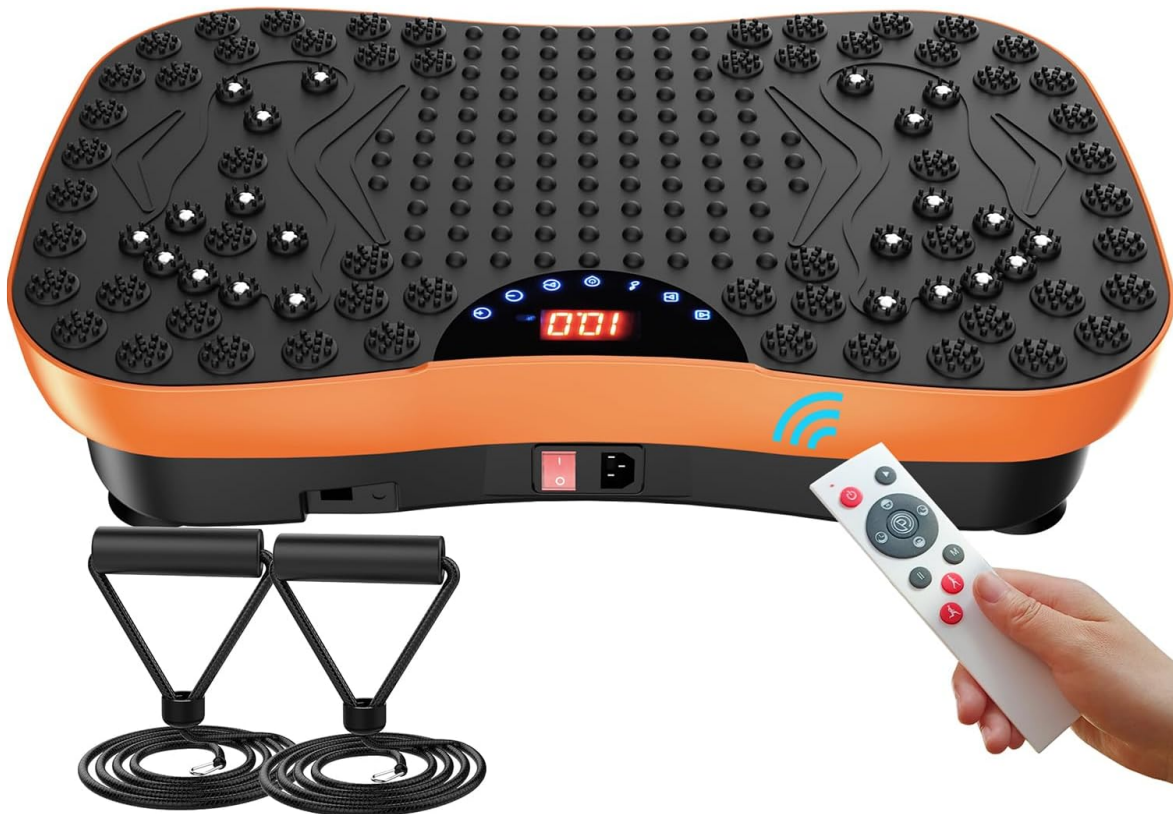
Figure 3.1: AXV Vibration Plate with included accessories (remote control, resistance bands, power cord).