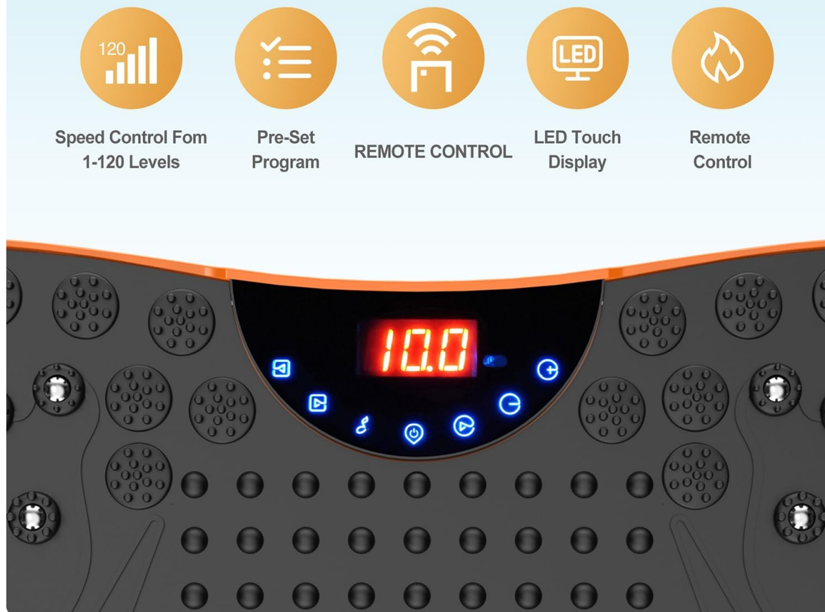
Figure 4.1: The control panel features buttons for power, time adjustment, program selection, speed adjustment, and mode selection. The remote control mirrors these functions for convenient operation.