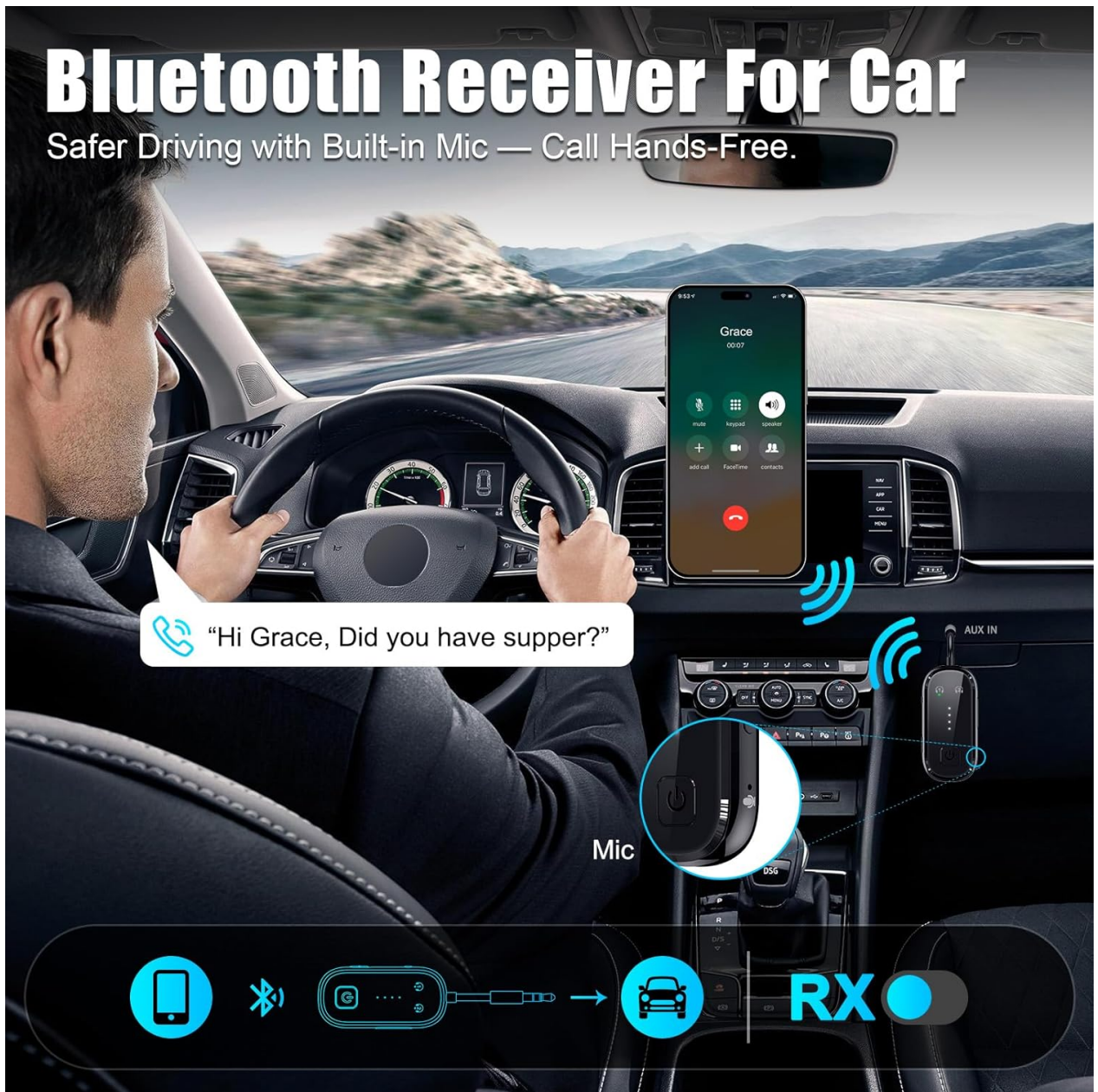
Image: The BF05 used as a Bluetooth receiver in a car, enabling hands-free calls and music streaming through the car's audio system.

Safer Driving with Built-in Mic — Call Hands-Free.