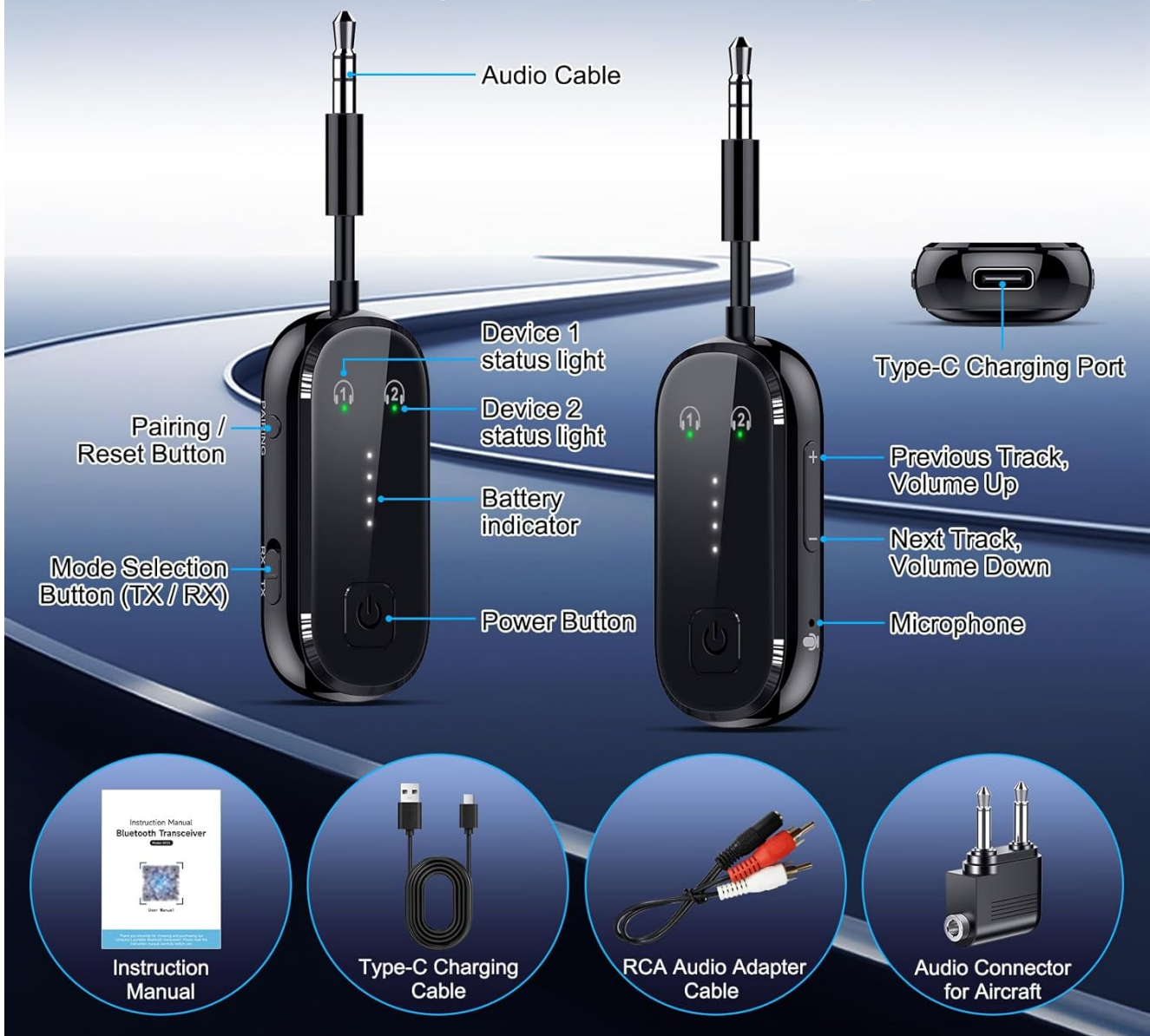
Image: A detailed view of the BF05's controls and indicators, showing the audio jack, pairing button, TX/RX switch, power button, LED indicators for device connection and battery, and the USB-C charging port.