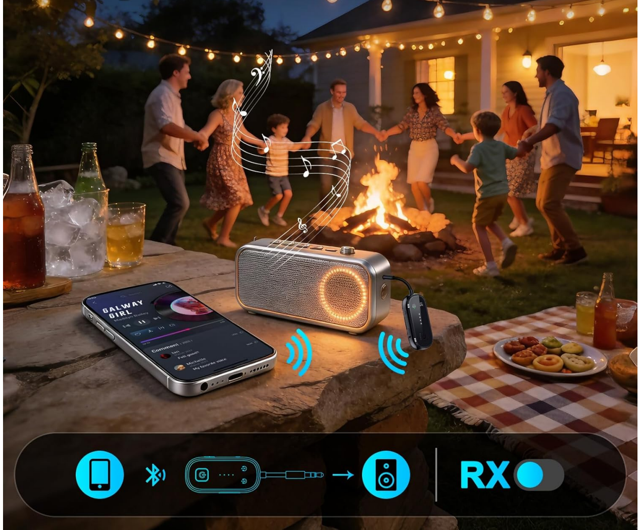
Image: The BF05 connected to a speaker, streaming audio from a phone for outdoor entertainment.