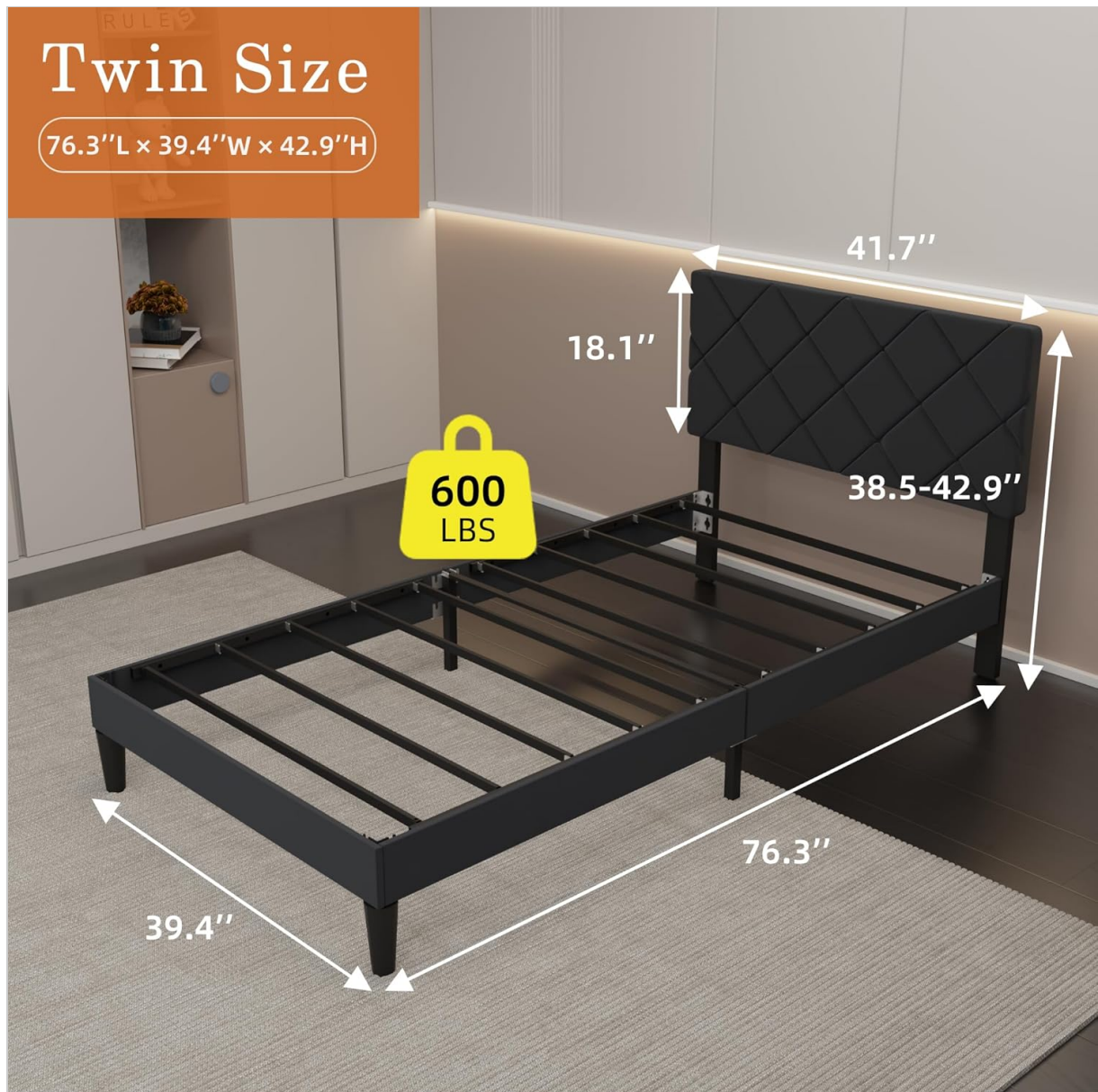
Figure 1: Product Dimensions and Weight Capacity.