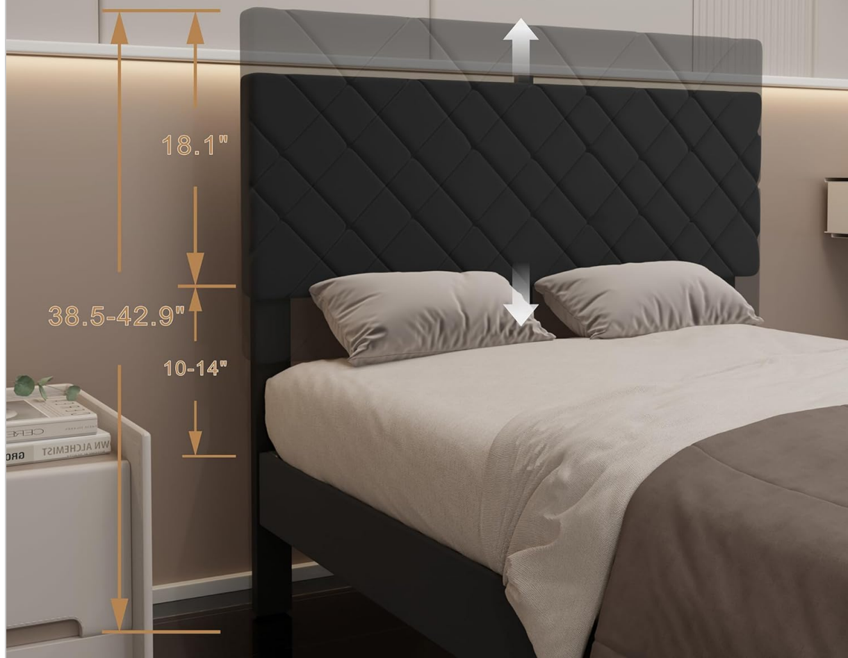
Figure 4: Adjustable Headboard Height Mechanism.

Tailored to suit the preferences of every individual