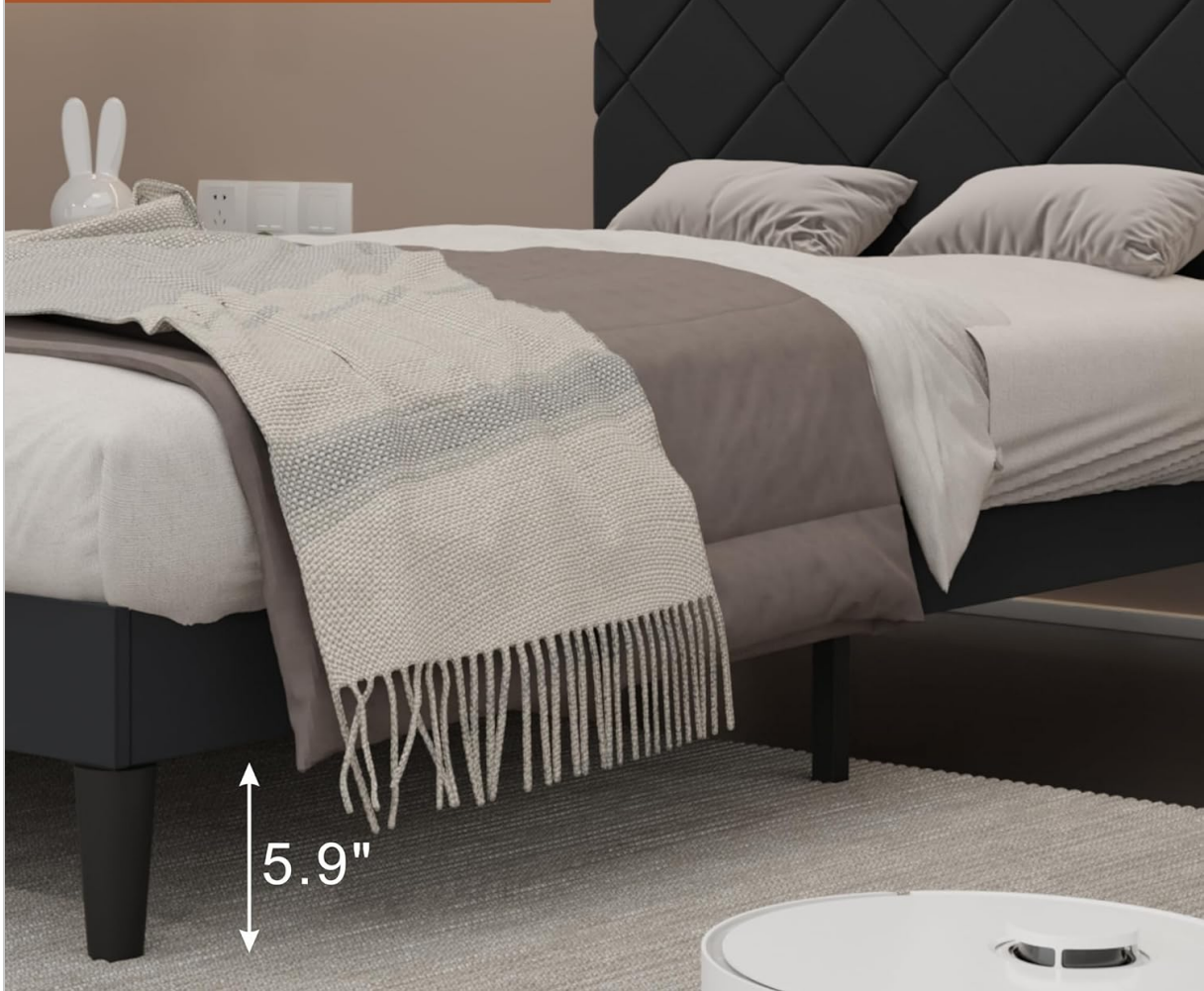
Figure 5: Under-Bed Storage Space.