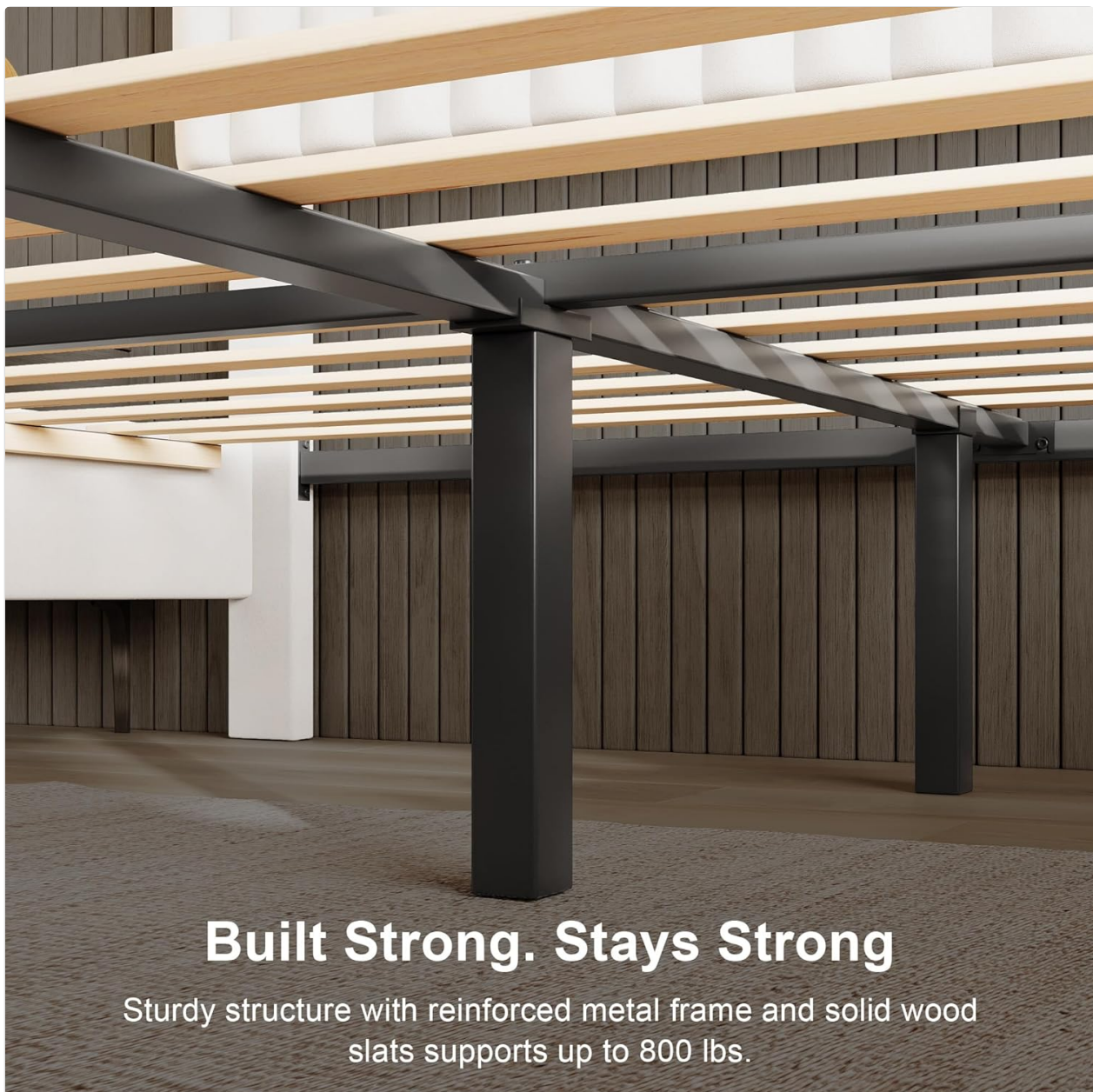
Image: Detail of the reinforced wood and metal slat construction, designed for stability.