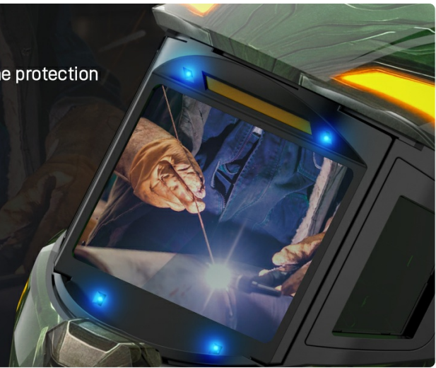
Figure 9: High photosensitivity allows detection of TIG arcs down to 5A.