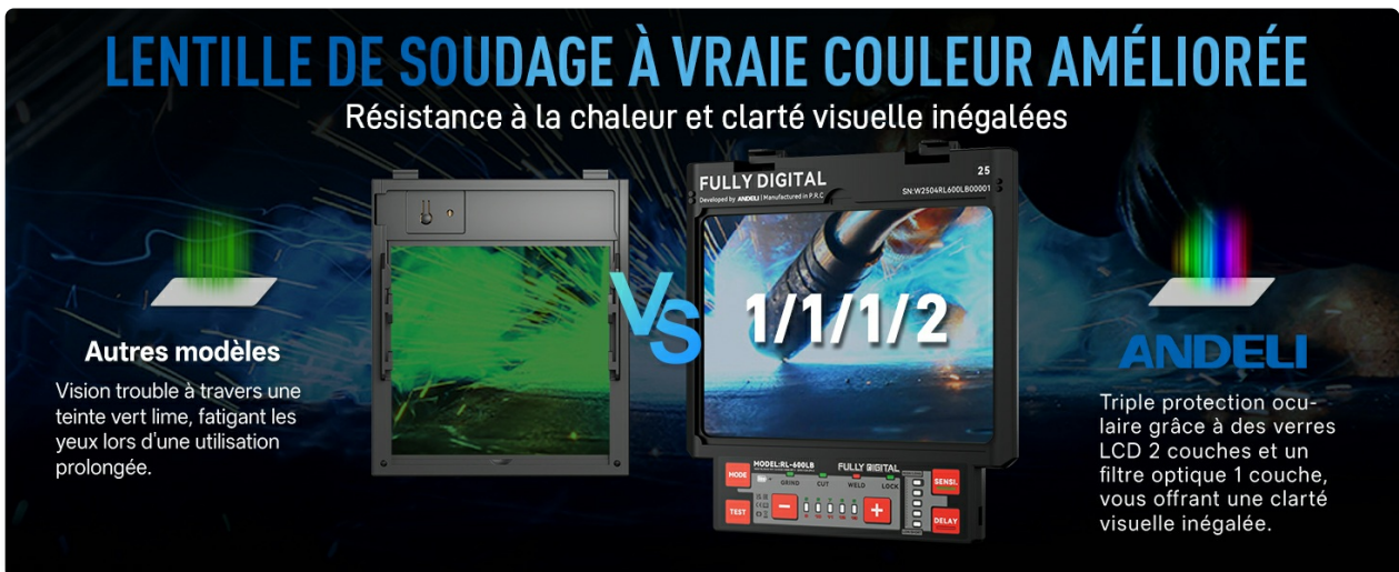
Figure 8: True Color technology provides enhanced visual clarity and natural color reproduction compared to traditional green-tinted lenses.

The helmet's four high-quality arc sensors ensure rapid darkening in 1/30,000 seconds, providing superior eye protection.