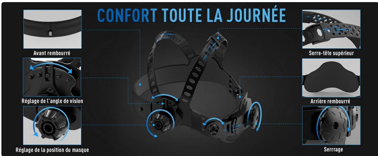
Figure 3: Headband components and adjustment points.