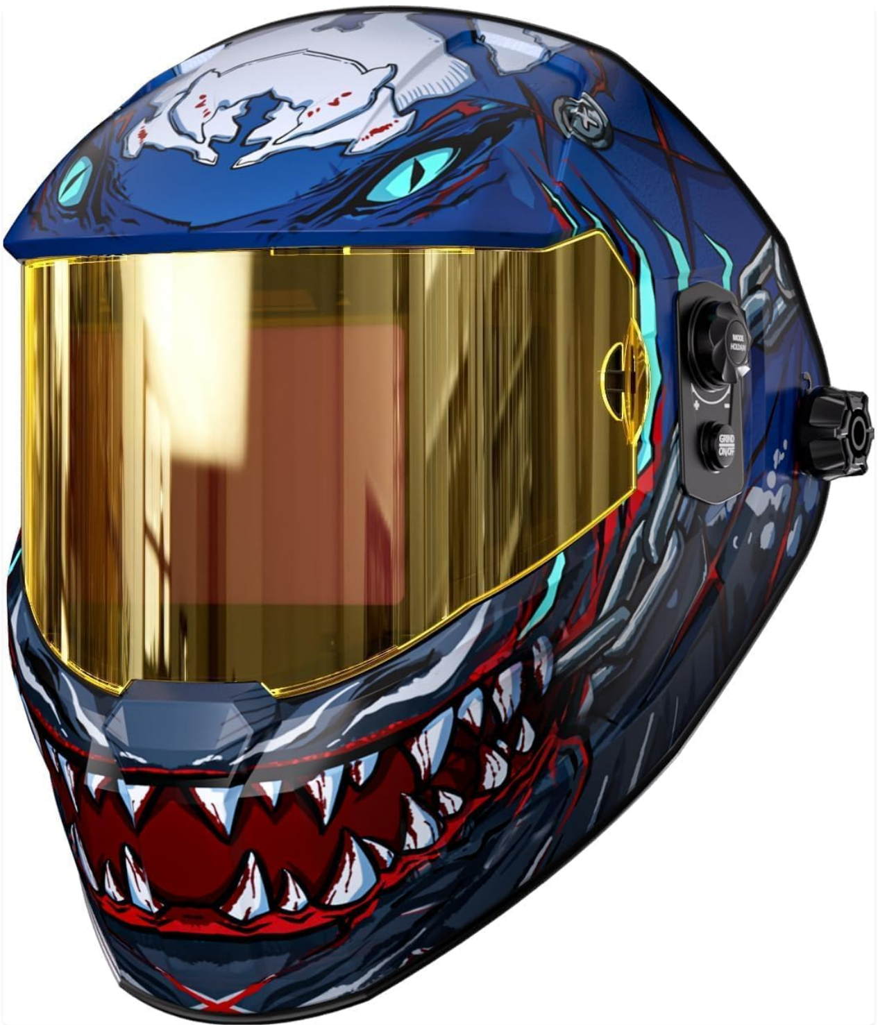
Figure 1: ANDELI Digital Auto-Darkening Welding Helmet, Raging Sharks model.