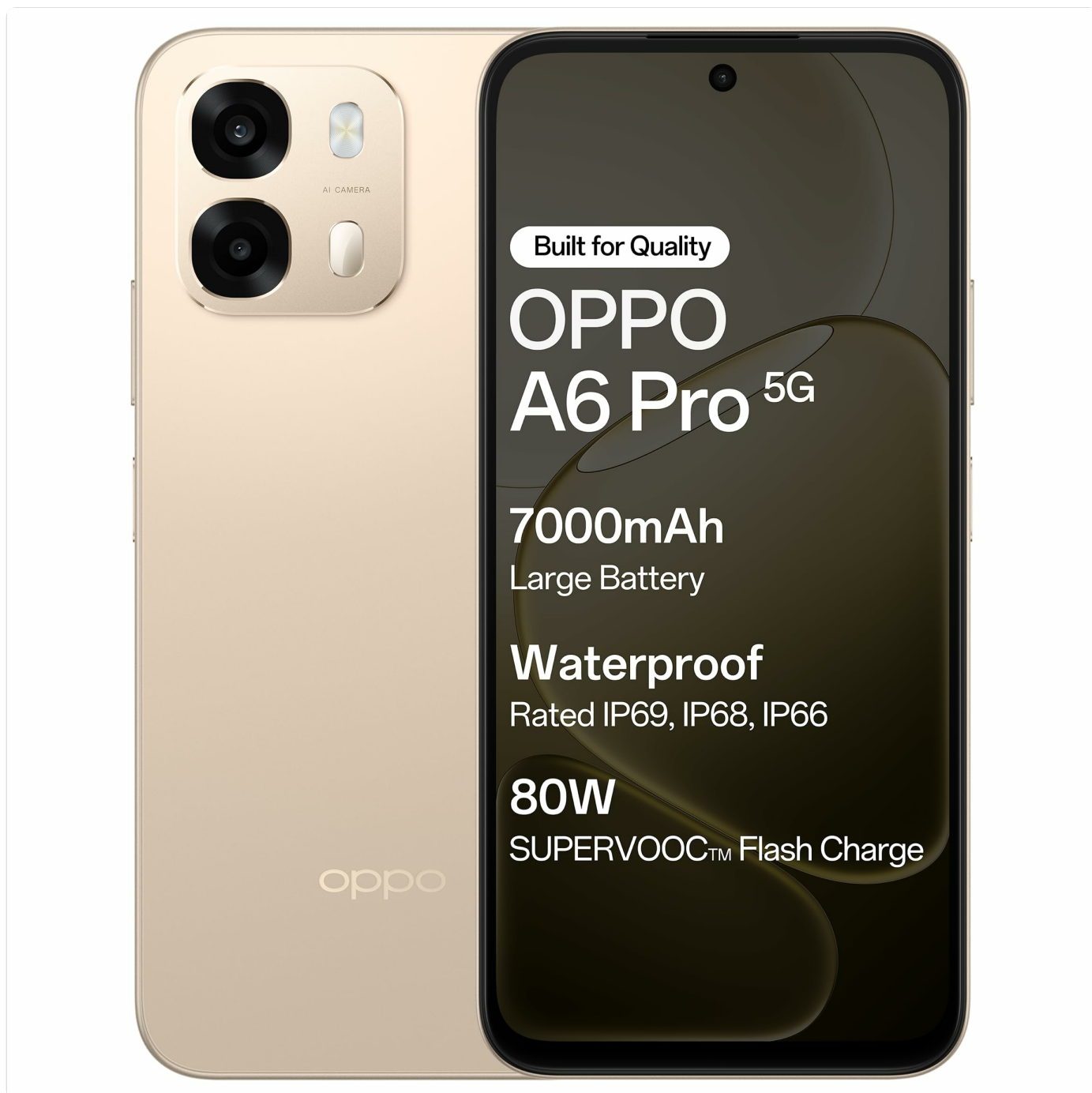
Figure 1.1: Front view of the OPPO A6 Pro 5G smartphone.