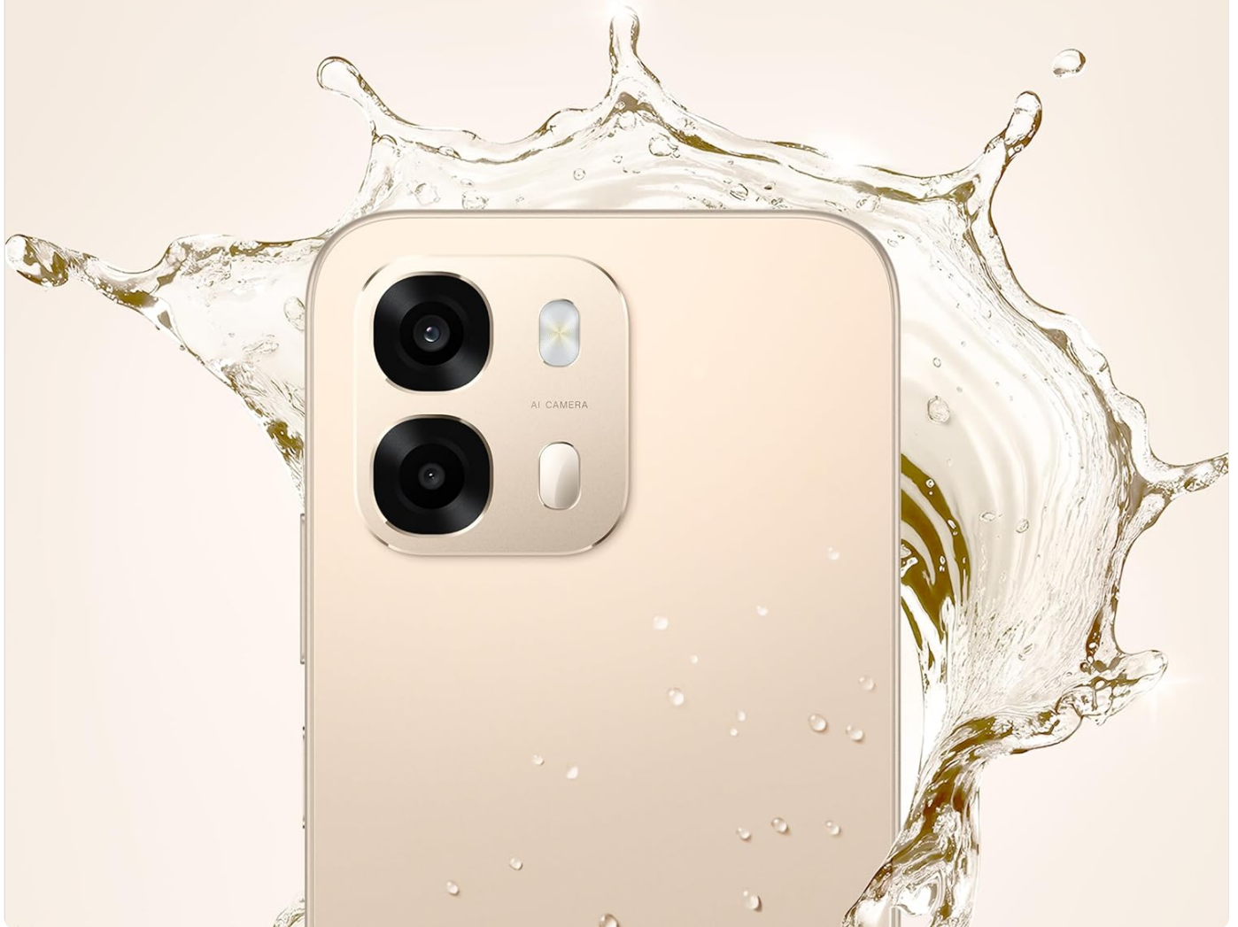
Figure 5.6: The device designed for 60-month fluency protection.