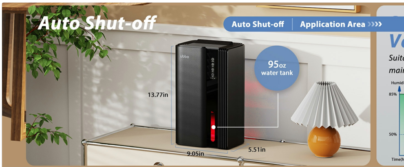
Figure 2.2: Overview of the UBBO Dehumidifier's main features.