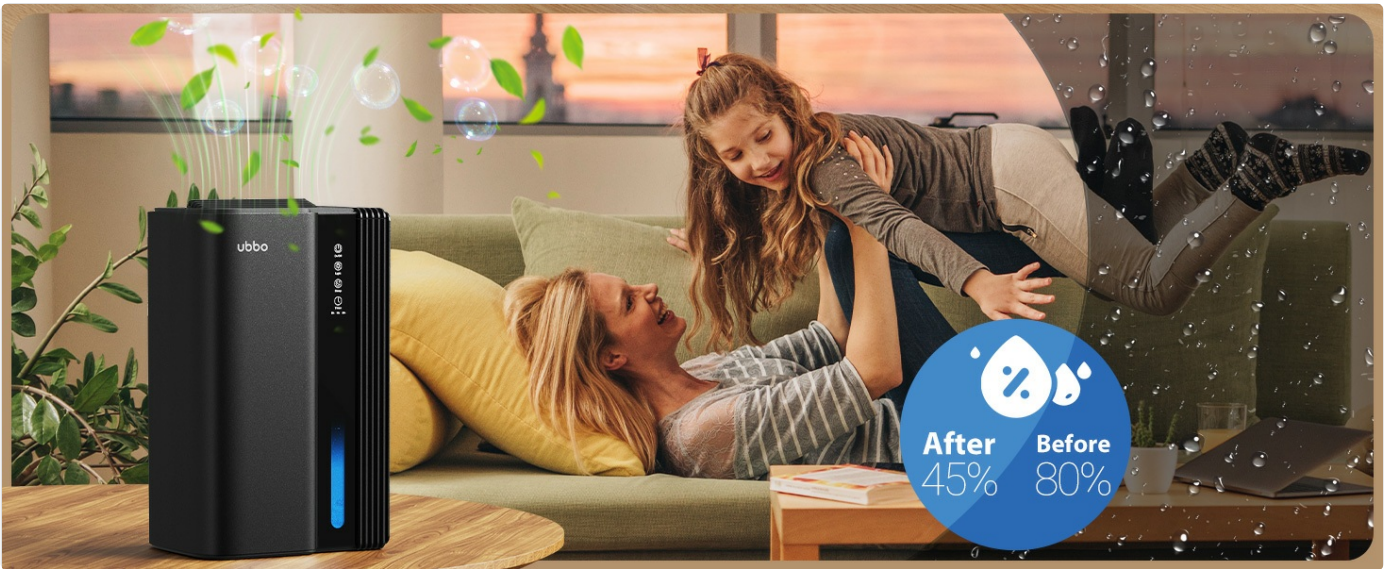
Figure 4.1: The dehumidifier operating in quiet Sleep Mode, suitable for bedrooms.