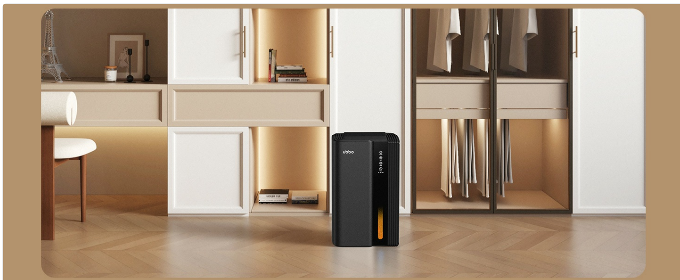
Figure 4.3: The dehumidifier's colorful ambient lighting feature.