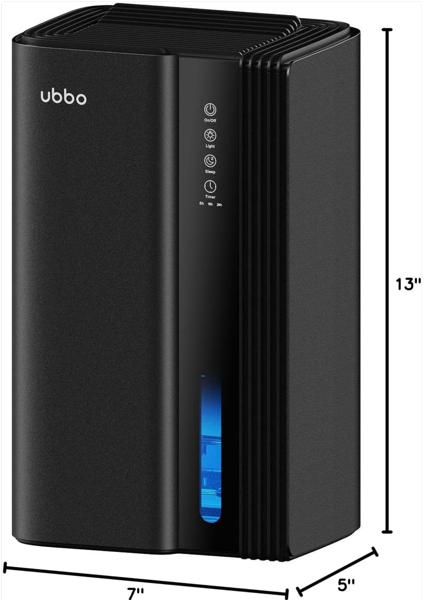
Figure 8.1: Dimensions of the UBBO Z18 Dehumidifier.