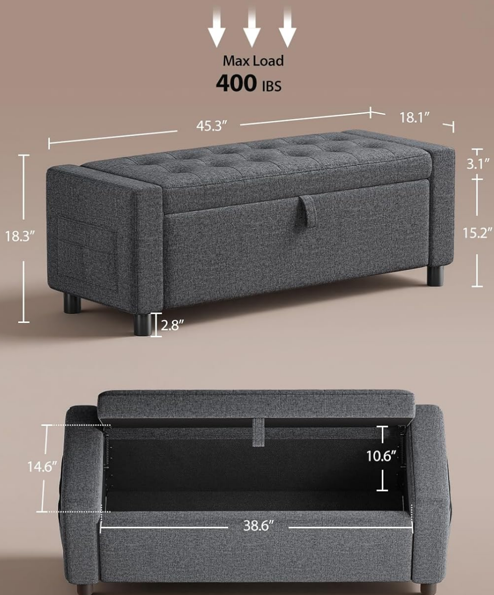
Image: A technical diagram illustrating the precise dimensions of the Amada Storage Ottoman, including length, width, height, and internal storage measurements.