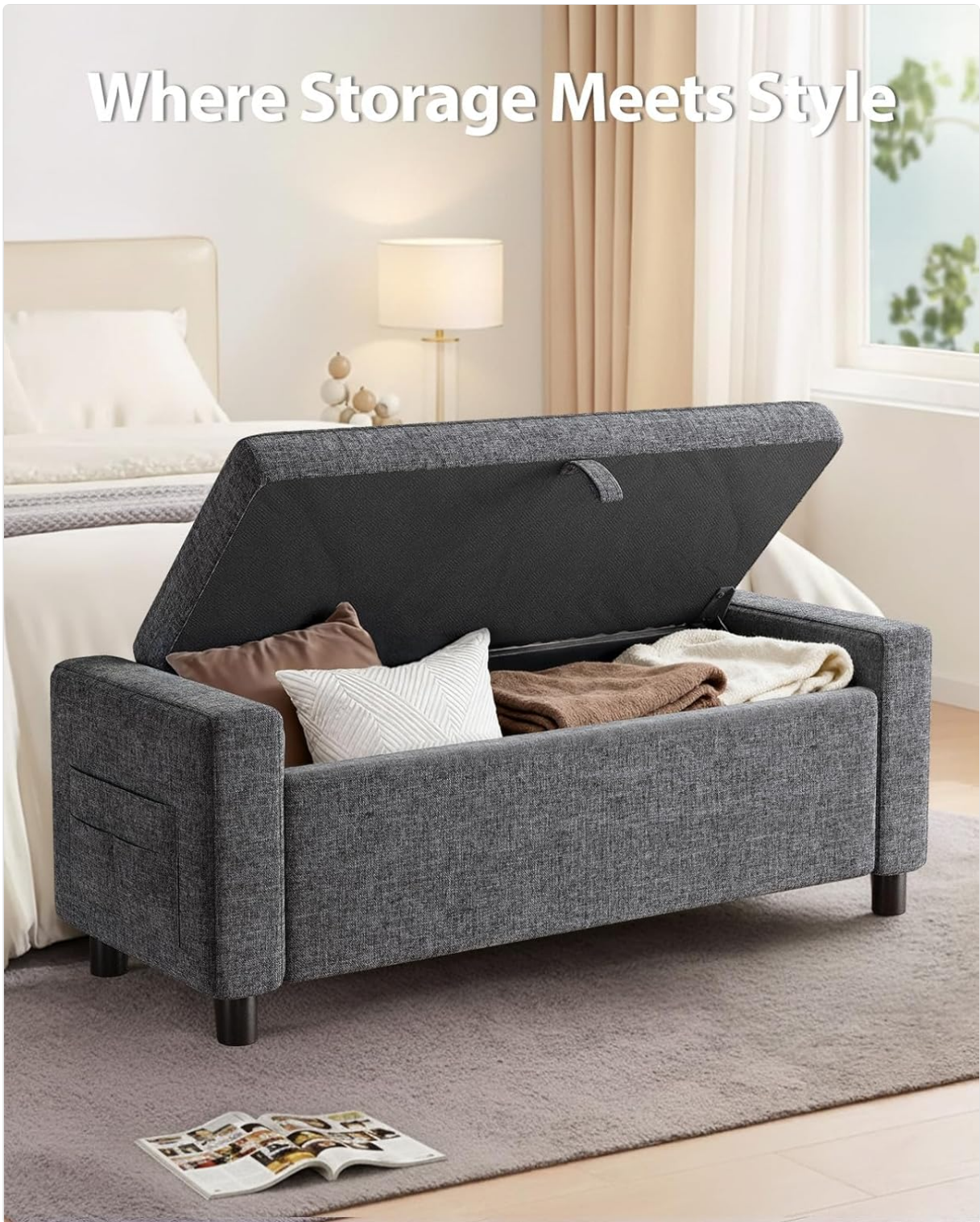
Image: The Amada Storage Ottoman with its lid fully open, showcasing the spacious interior storage compartment, ready to hold various household items.