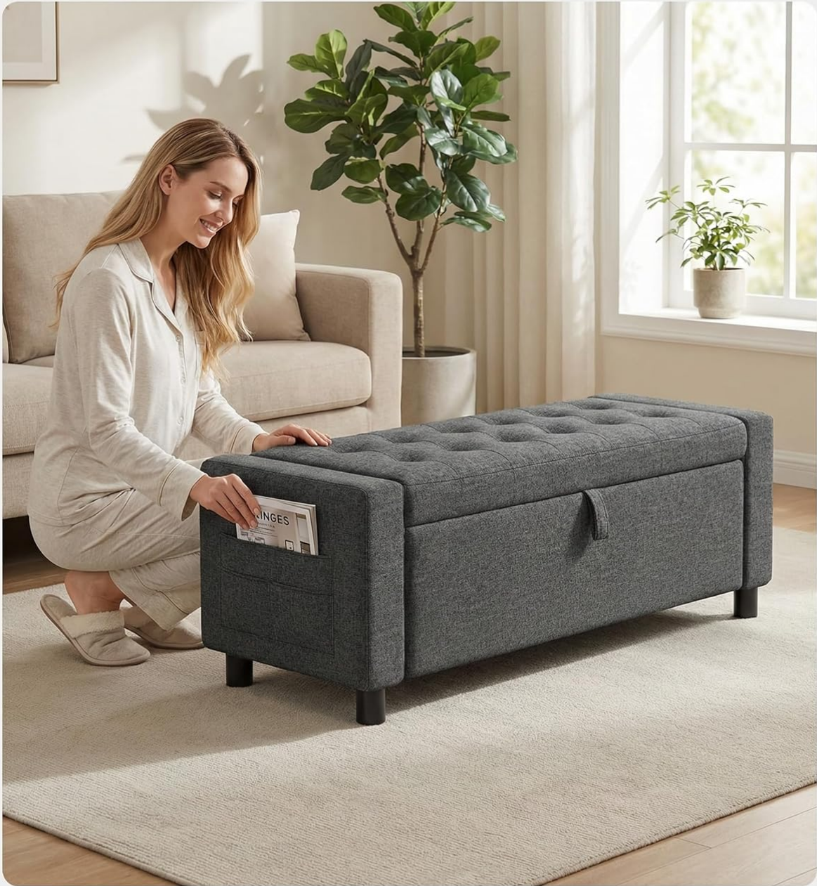
Image: A close-up view of the ottoman's integrated side pocket, demonstrating its use for storing small items like a book and a remote control, enhancing convenience.