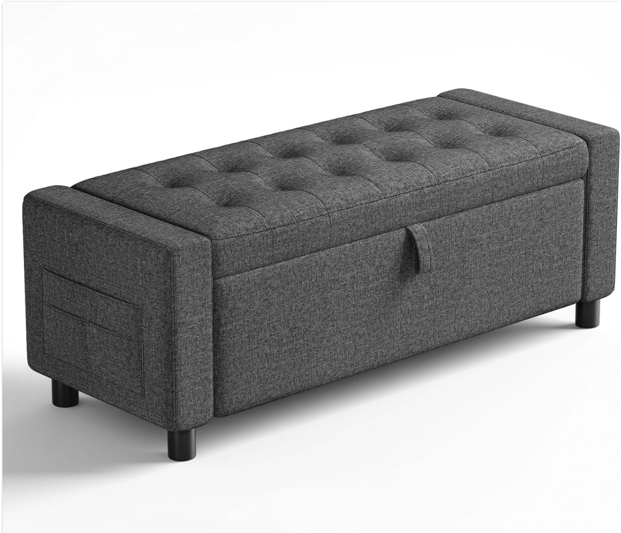
Image: The Amada 46-inch Storage Ottoman in Dark Gray, positioned in a modern living room. It features a tufted top and side

Thank you for choosing the Amada 46" Ottoman with Storage. This manual provides essential information for the safe assembly, operation, and maintenance of your new ottoman. Please read these instructions carefully before use and retain them for future reference.