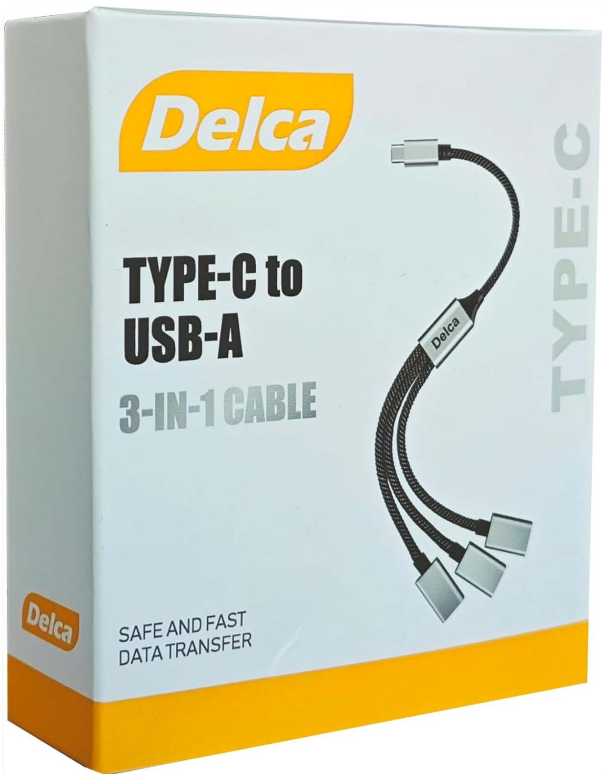
Image 2.1: The Acer Predator Helios Neo 16 AI Gaming Laptop alongside the included DLCA Type-C to USB-A 3-in-1 cable, facilitating versatile peripheral connections.