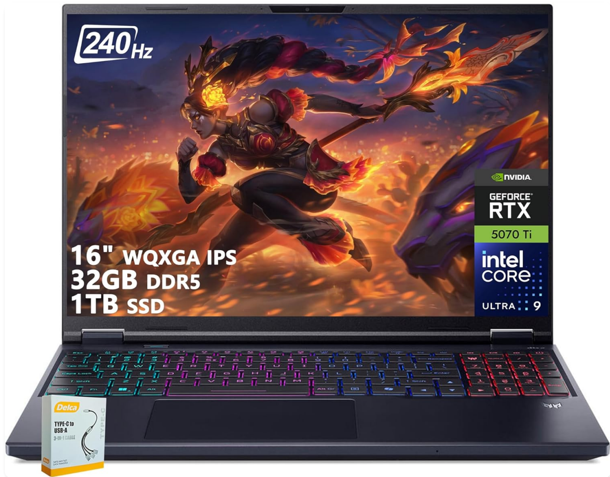
Image 1.1: Acer Predator Helios Neo 16 AI Gaming Laptop, showcasing its sleek design and vibrant display.