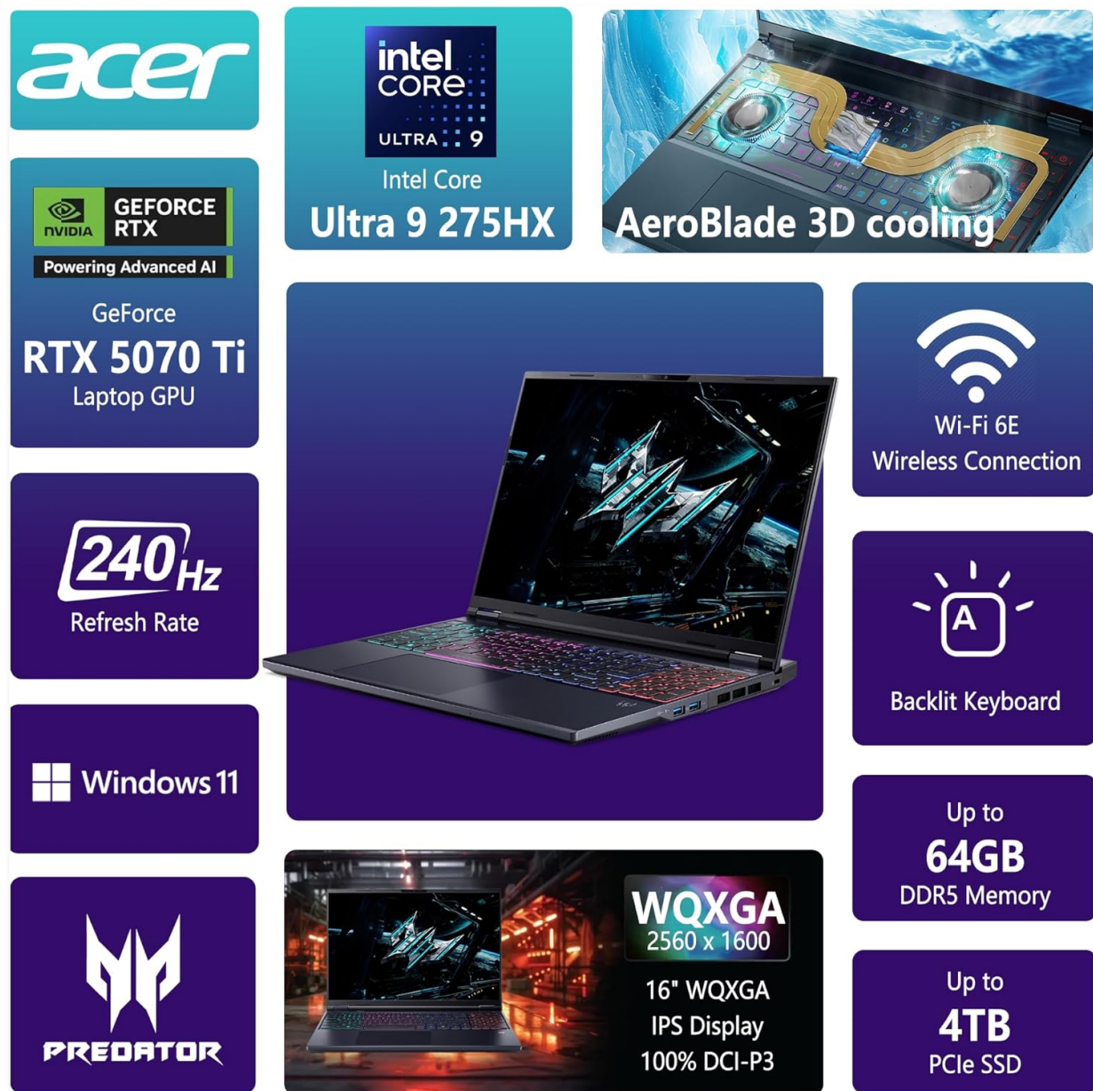
Image 4.1: Close-up view of the laptop's advanced AeroBlade 3D cooling system, designed for efficient heat dissipation during intensive use.

The laptop features 5th Gen AeroBlade 3D Fan technology for efficient cooling. Ensure vents are clear of obstructions to maintain optimal airflow.