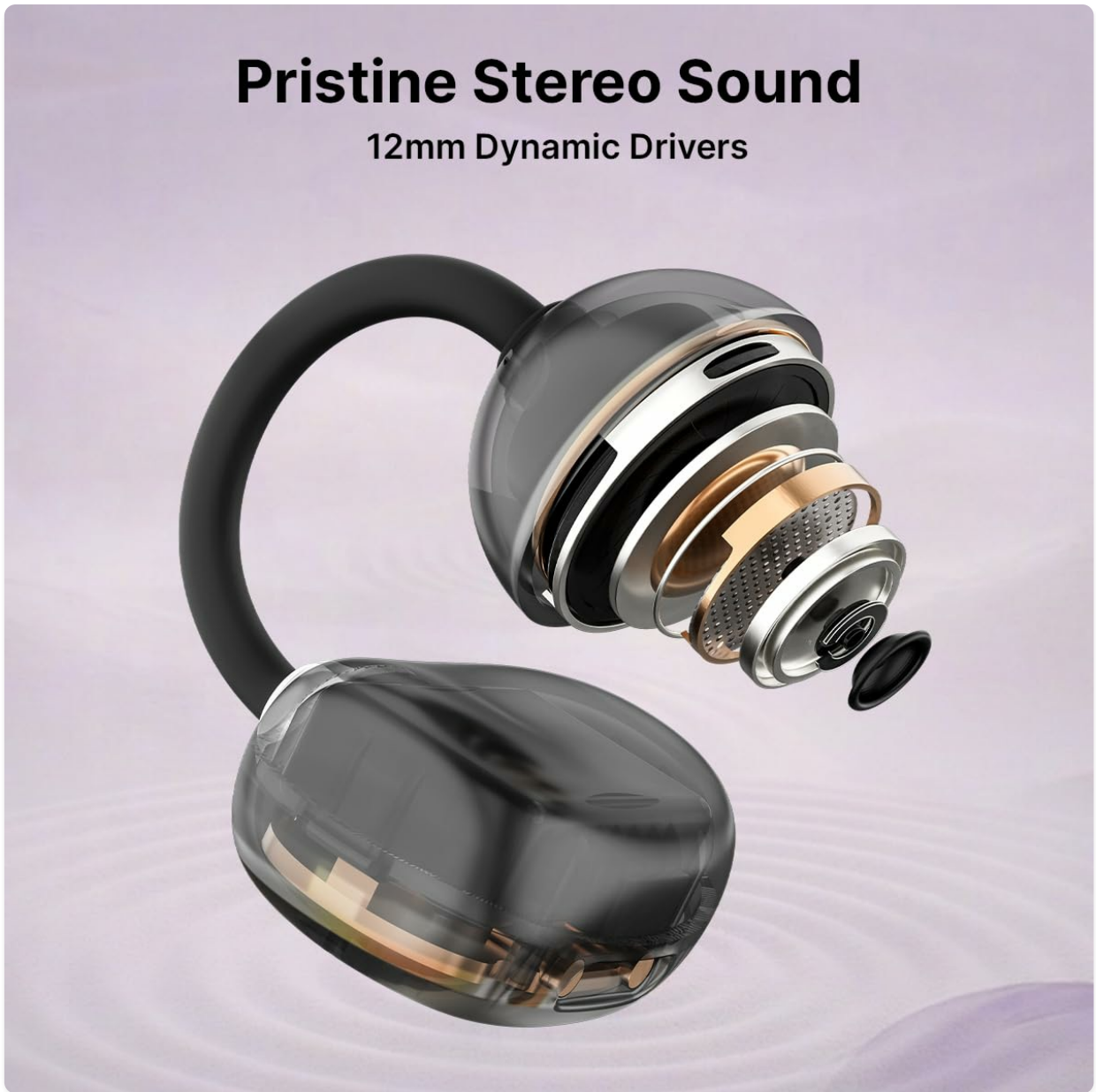
Image: An exploded view of the pTron Bassbuds Verse Clips earbud, detailing the internal 12mm dynamic driver components responsible for pristine stereo sound.