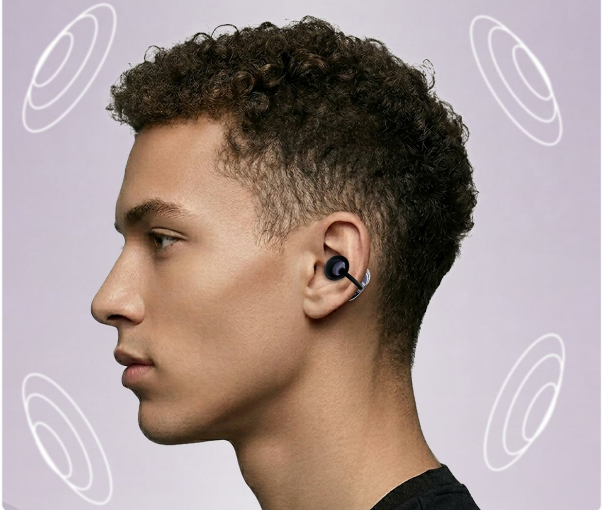
Image: A person wearing pTron Bassbuds Verse Clips, visually representing the TruTalk AI-ENC technology and Dual HD Microphones for enhanced call clarity.