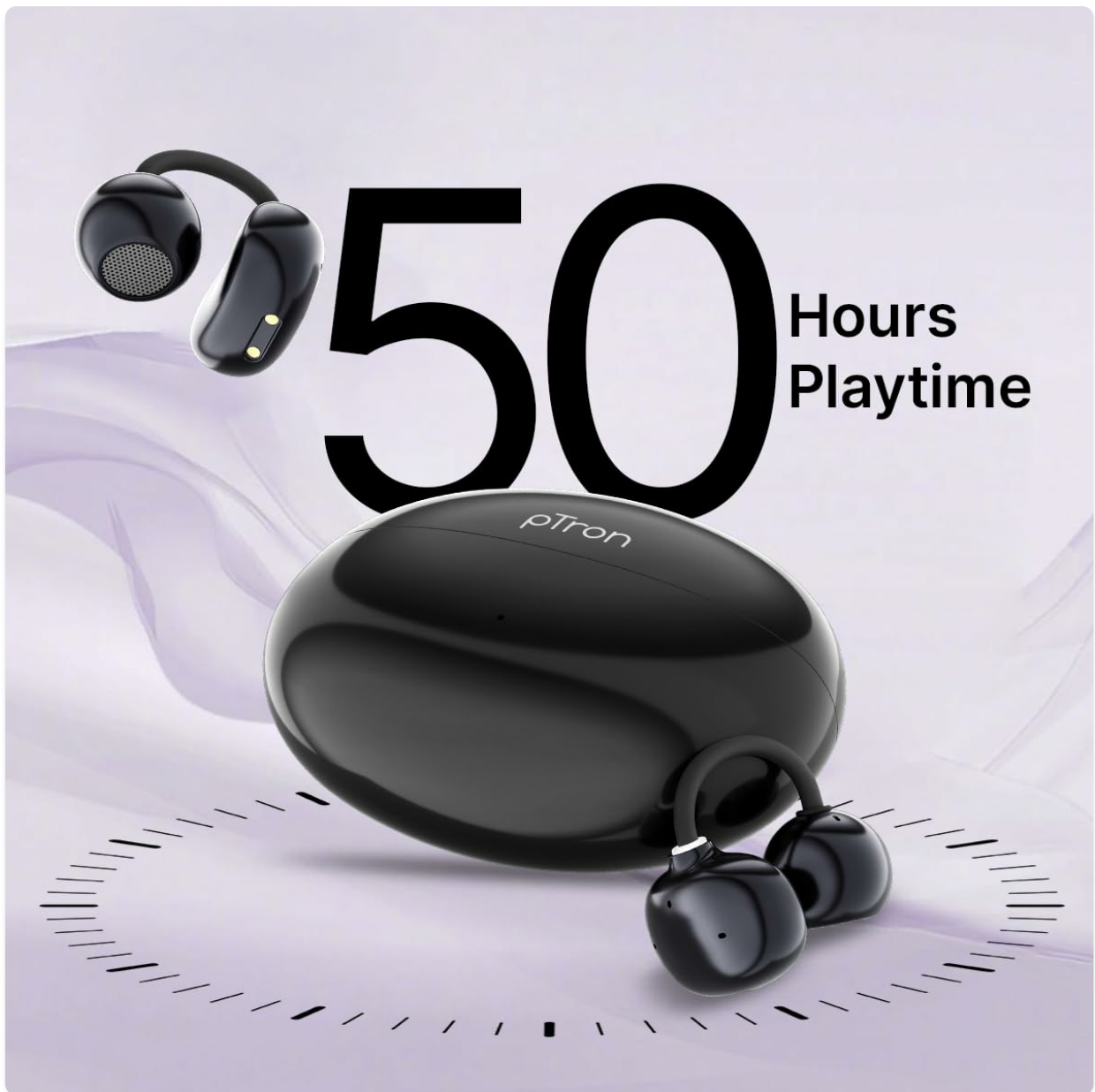
Image: pTron Bassbuds Verse Clips earbuds and charging case, highlighting the 50 hours of playtime.