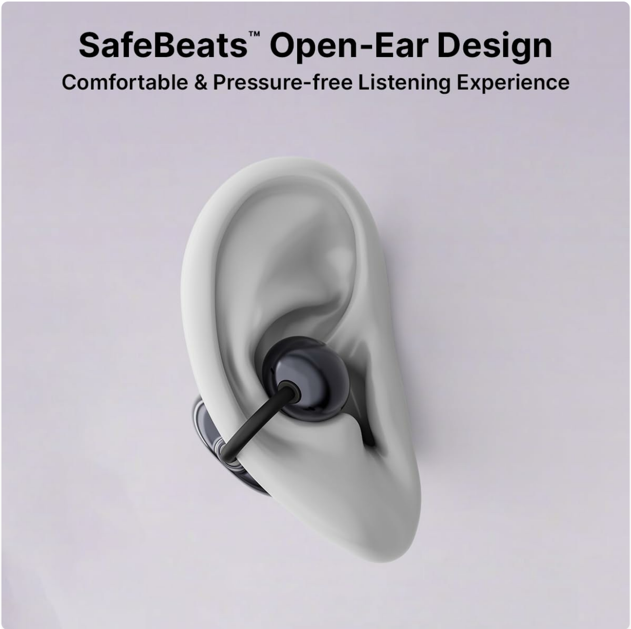
Image: A diagram illustrating the correct placement of the pTron Bassbuds Verse Clips earbud on the ear, highlighting its SafeBeats Open-Ear Design for comfort.