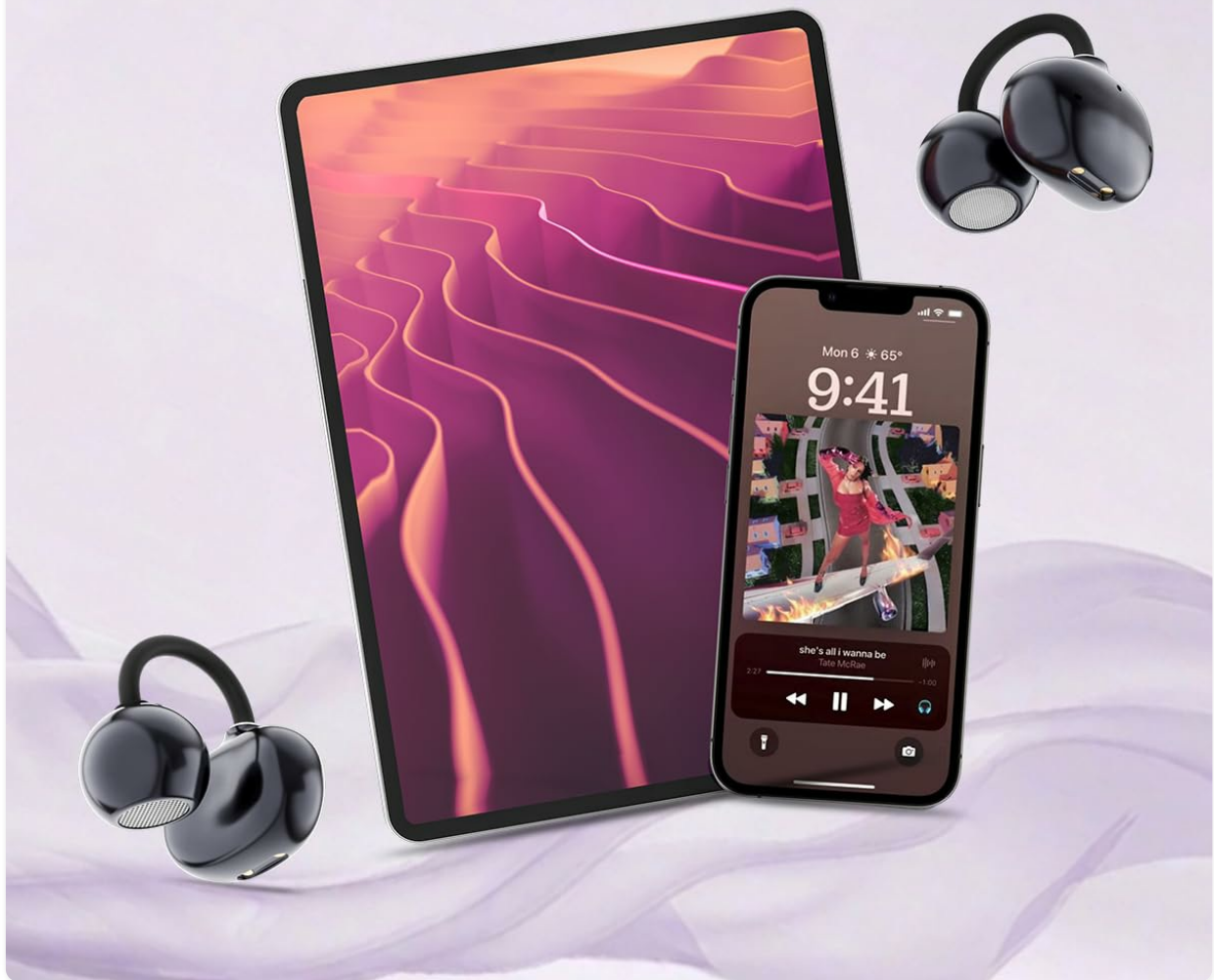
Image: pTron Bassbuds Verse Clips demonstrating Bluetooth 6.0 wireless connectivity with a smartphone and tablet.