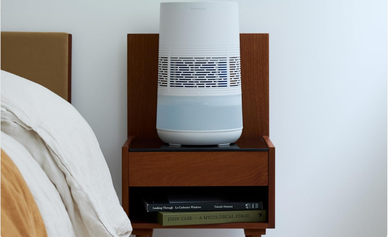
Image: The Blueair Humidifier highlighting its anti-scale design, which is engineered to prevent mineral buildup and ensure consistent performance over time.