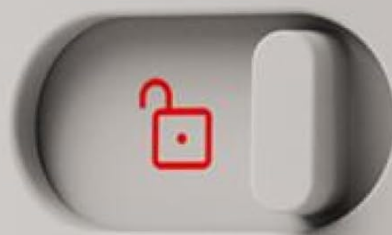
Image: A close-up view of the easy release lock button on the side of the humidifier, designed to secure the device for safe carrying, quick refills, and convenient wick replacements.

Easy release lock button secures device for safe carrying, fast refills & wick replacements