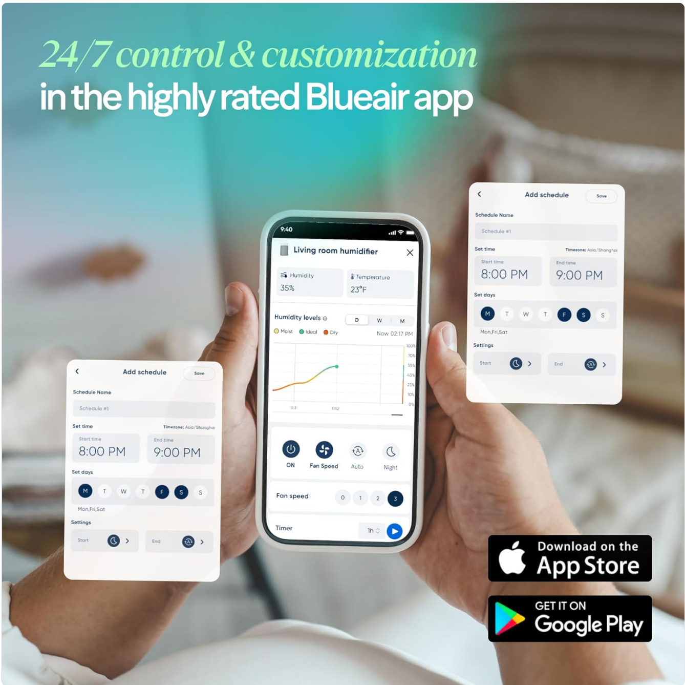
Image: Multiple screenshots of the Blueair mobile application, illustrating its user-friendly interface for controlling the humidifier, monitoring humidity and temperature, adjusting fan speeds, and setting up custom schedules.