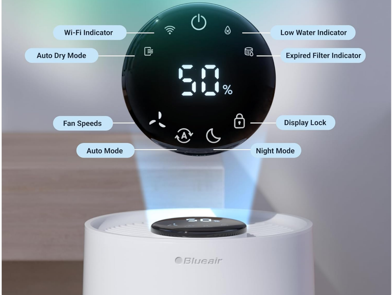
Image: A detailed view of the humidifier's touchscreen display, highlighting icons for Wi-Fi, Auto Dry mode, fan speeds, Auto mode, Night mode, display lock, expired filter indicator, low water indicator, and the current humidity percentage.