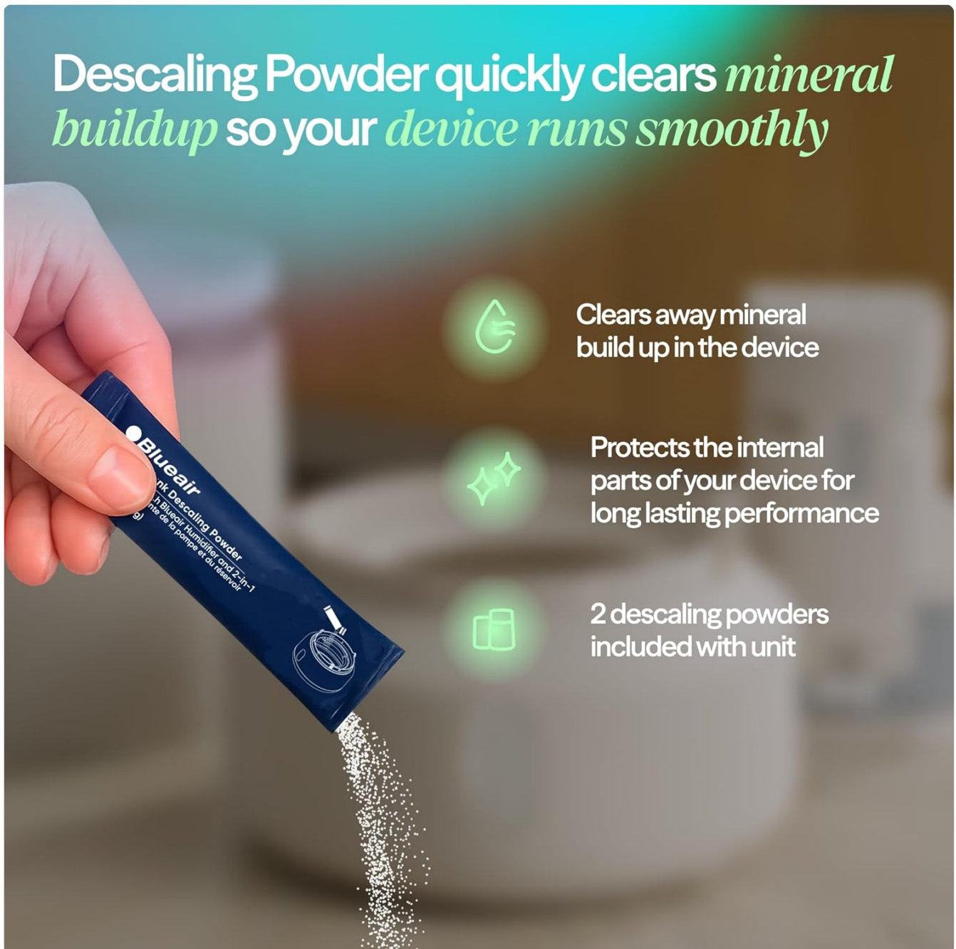
Image: A hand holding a Blueair descaling powder packet, with the powder being poured into the humidifier's water tank, illustrating the process of clearing mineral buildup for smooth operation.