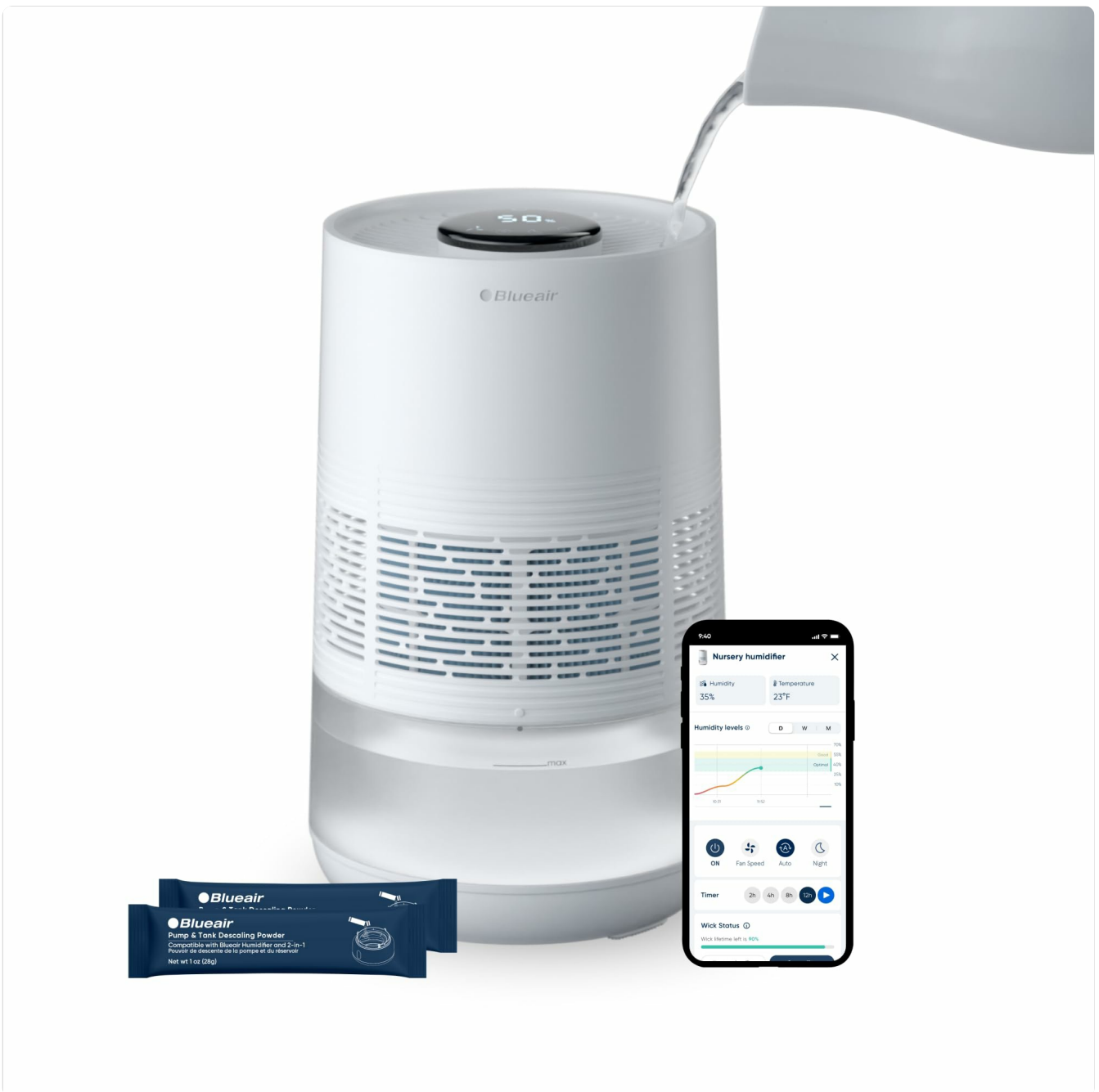
Image: The Blueair Premium Smart Humidifier, showcasing its sleek design and key features such as InvisibleMist Technology for mess-free humidification, an easily redesigned top for refills, an upgraded auto mode for peak performance, and an easy-open wick cage.